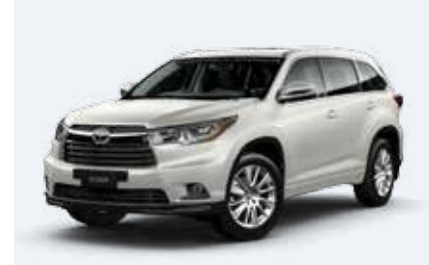
A. Crystal Pearl<sup>12</sup> 070

Every family has their own taste and style. Which is why we've created nine vibrant colours spread across the Kluger range. Now all you have to do is get everyone to agree on the right one for your family.