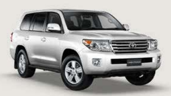
Crystal Pearl<sup>19</sup> (070)