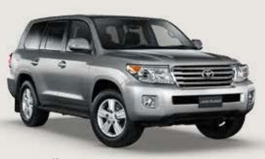
Silver Pearl<sup>19</sup> (1F7)