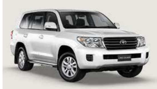
Glacier White (040)