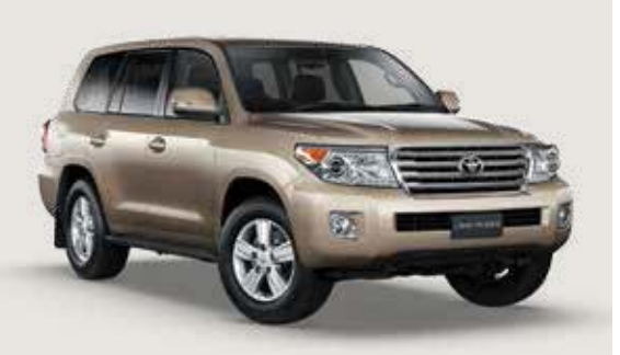
Vintage Gold<sup>19</sup> (4R3)