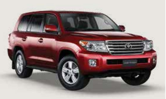
Merlot Red<sup>19</sup> (3Q3)