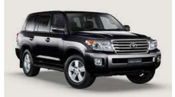
Eclipse Black<sup>19</sup> (218)