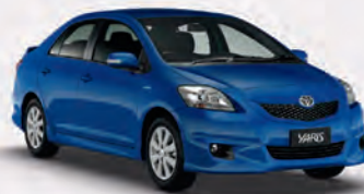
Tidal Blue ® 8T7