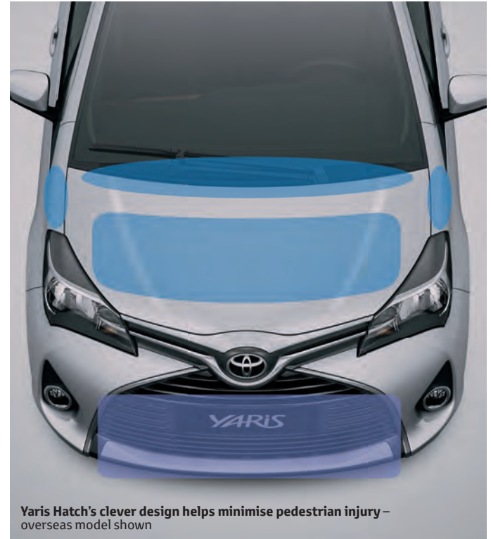
Yaris Hatch's clever design helps minimise pedestrian injury – overseas model shown

Choose from the Yaris Hatch range and you'll be equipped with seven SRS airbags and an emergency brake signal, which automatically activates and flashes the car's hazard warning lamps. This helps draw the attention of drivers behind you to assist in reducing the likelihood of a collision. All grades of Yaris Hatch have also been awarded the highest 5-star ANCAP safety rating.