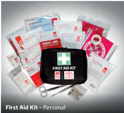
First Aid Kit – Personal