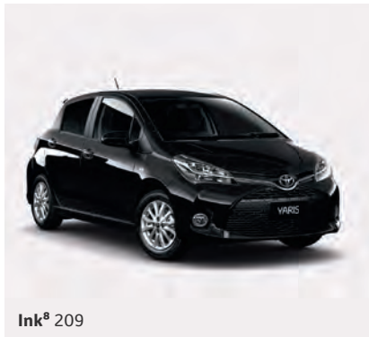
Ink ® 209