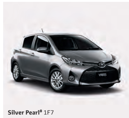
Silver Pearl ® 1F7