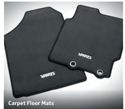
Carpet Floor Mats