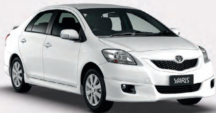
Glacier White 040

There is a great range of seven fun-loving colours available for Yaris Sedan. You'll find the right colour to match your personal style.