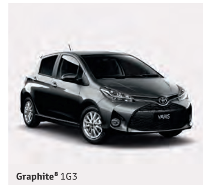
Graphite ® 1G3