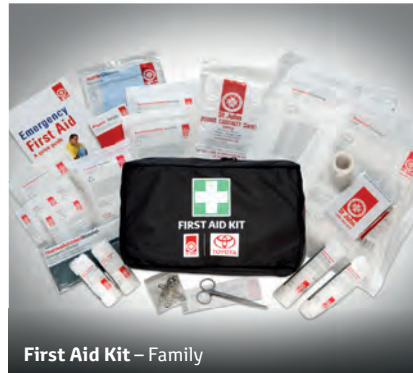
First Aid Kit – Family

You can personalise your Yaris with Toyota Genuine Accessories 9 (each sold separately). Whether it's to enhance looks or functionality, they're all developed to strict standards and backed by our Toyota Warranty.