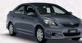
Blue Storm ® 8R3