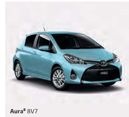
Aura ® 8V7