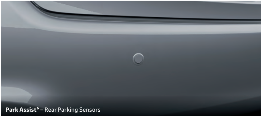
Park Assist 6 – Rear Parking Sensors