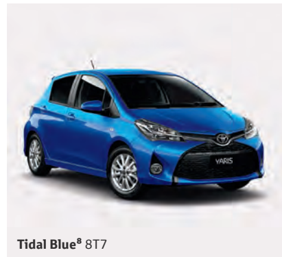
Tidal Blue ® 8T7