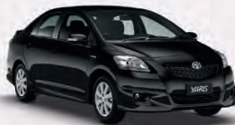
Ink ® 209