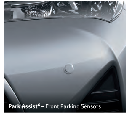
Park Assist 6 – Front Parking Sensors