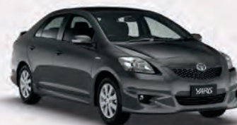
Storm Grey ® 1E0