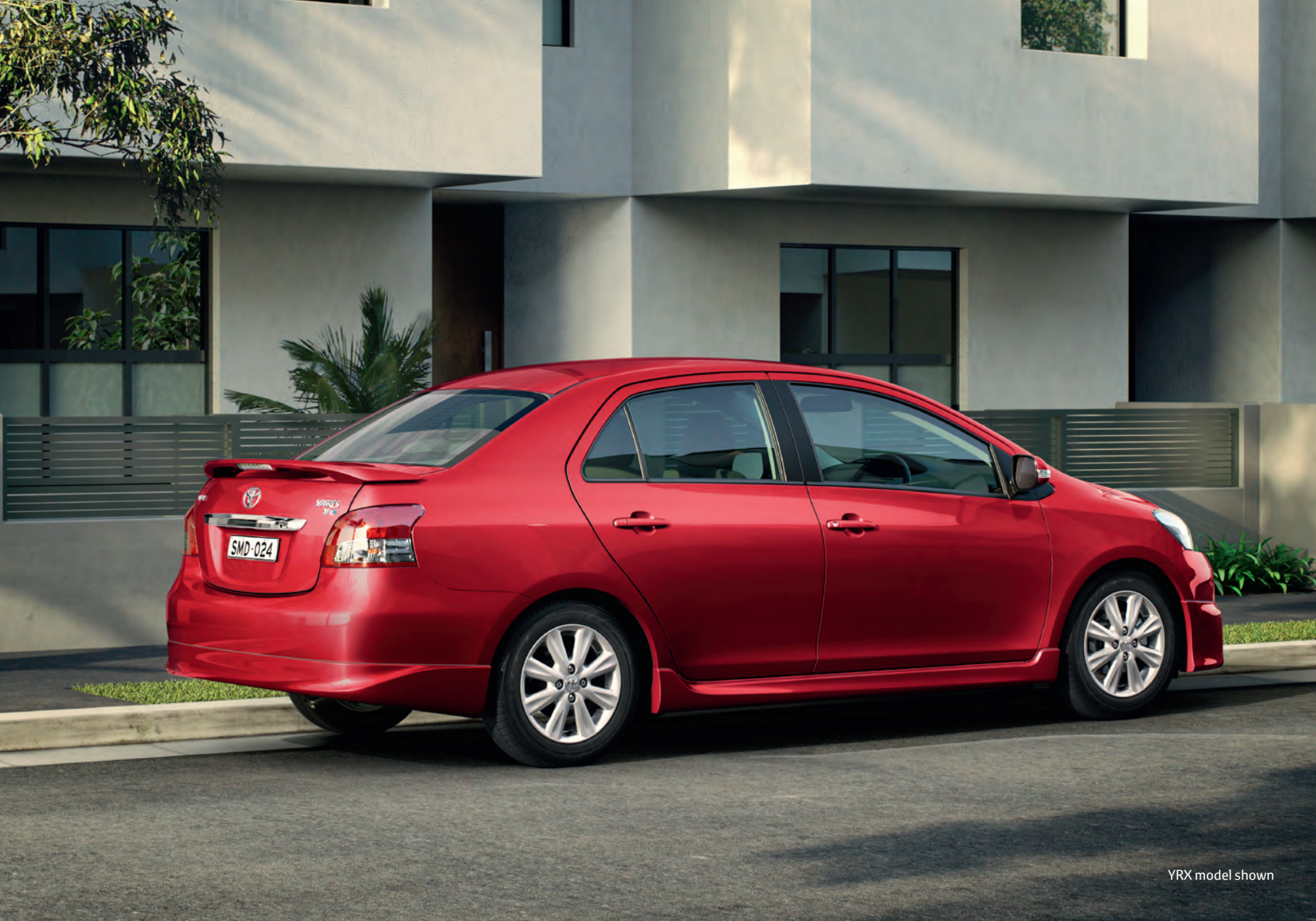
YRX model shown