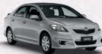
Silver Pearl ® 1F7