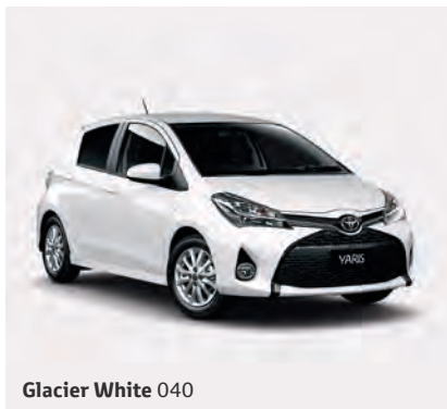
Glacier White 040

Yaris Hatch is available in nine fun-loving colour variations, suited to any personality and style. So whatever your plans, or wherever you need to go, there's sure to be a Yaris that's perfect for you.