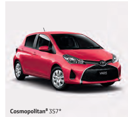
Cosmopolitan ® 3S7*