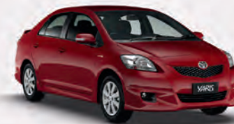
Wildfire ® 3R3