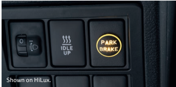
Shown on HiLux.

Tested to Toyota quality and durability standards, the LED Work Lamps are built to provide a generous beam of light for a variety of situations featuring a low current draw and multi-directional adjustment.