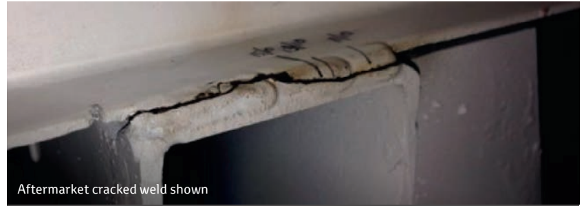
Aftermarket cracked weld shown