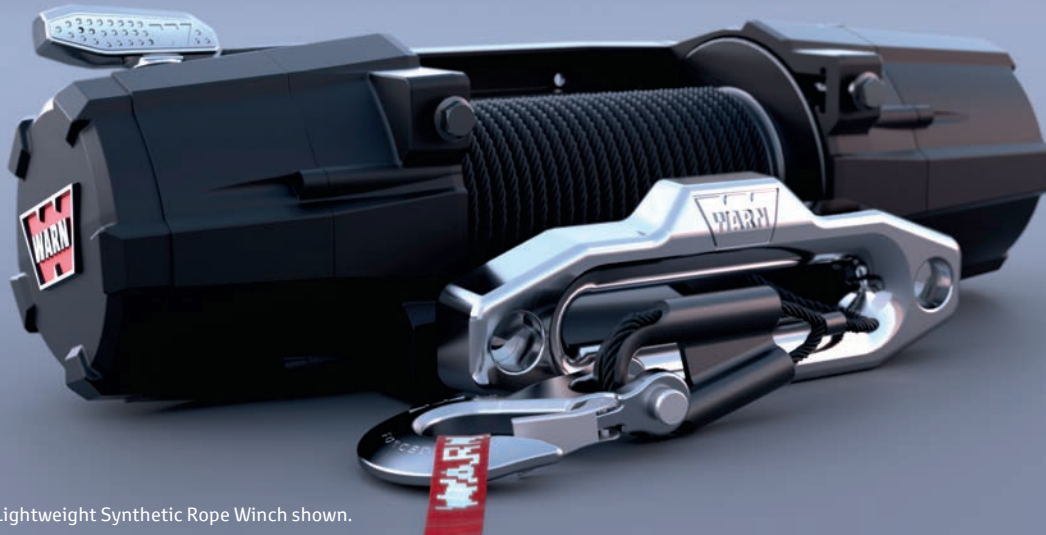
Lightweight Synthetic Rope Winch shown.