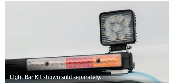
Light Bar Kit shown sold separately.

The Light Bar Kit provides improved visibility, which is especially important on any work site. The kit includes Light Control Switches, a Reverse Buzzer 2 (to notify of reversing vehicle) and a Flashing Beacon.