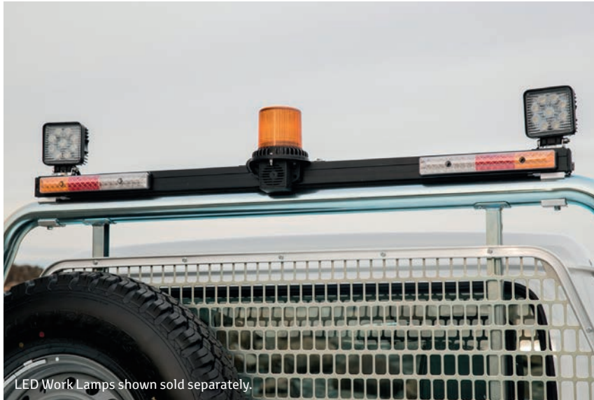
LED Work Lamps shown sold separately.