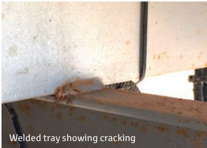
Welded tray showing cracking

Dropsides are manufactured using galvanised sheet steel or high-strength alloy, and are subjected to a lifetime of use simulation which is equal to lowering and raising the sides of the tray, approx. 14 times a day over 10 years. Dropside supports can also be added to maintain rigidity when the Tailgate is removed or in the lowered position.