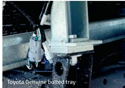
Toyota Genuine bolted tray