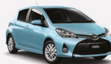
Aura ® 8V7