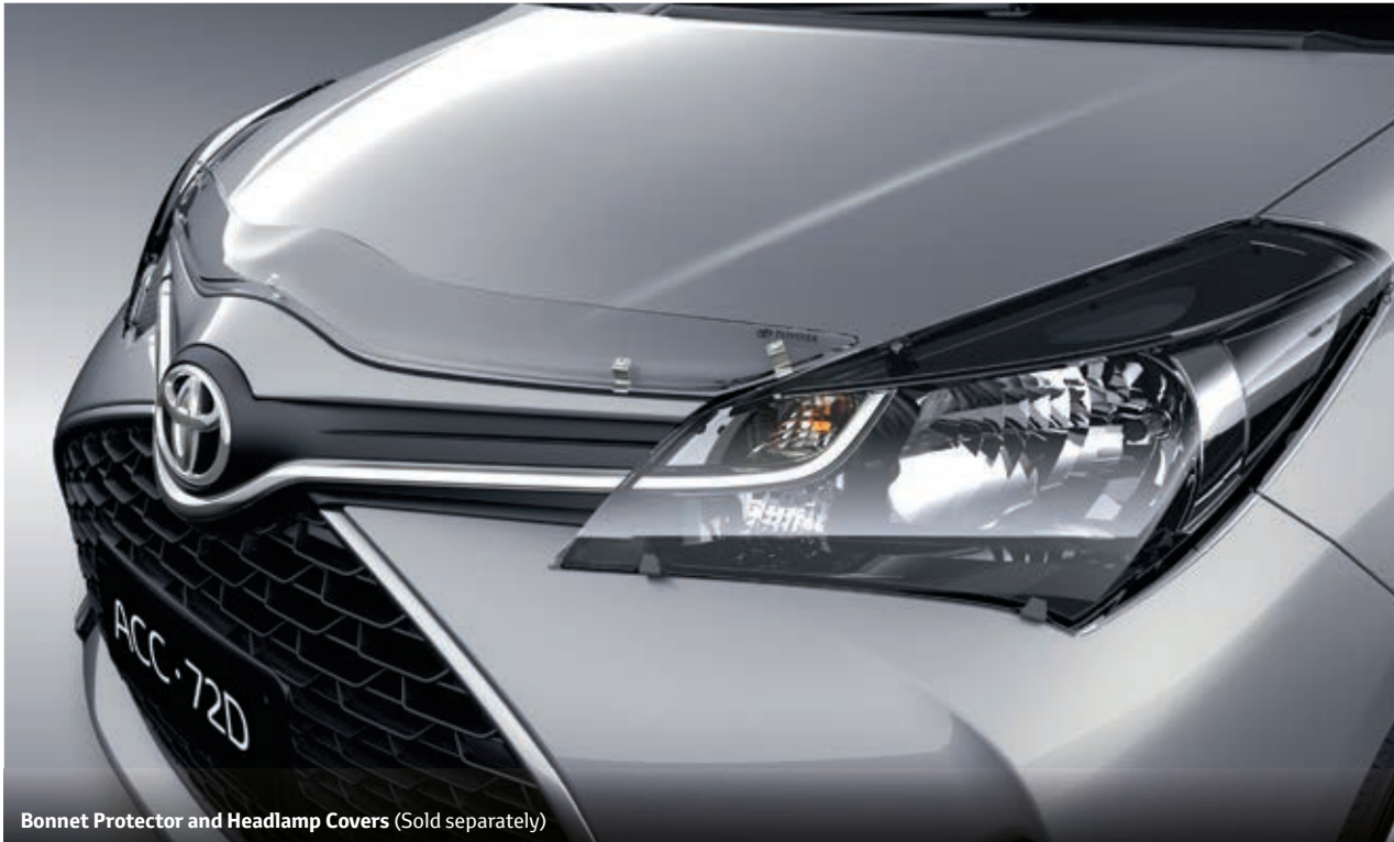
Bonnet Protector and Headlamp Covers (Sold separately)