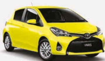
Vivid Yellow 5B5