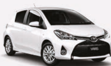
Glacier White 040

Yaris is available in 10 fun-loving colour variations, suited to any personality and style. So whatever your plans, or wherever you need to go, there's sure to be a Yaris that's perfect for you.