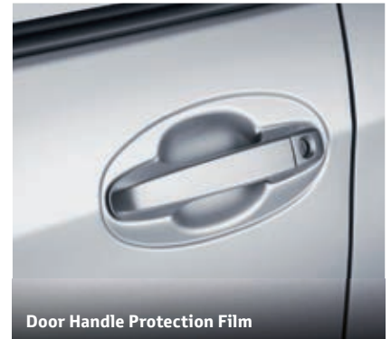
Door Handle Protection Film