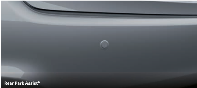
Rear Park Assist 6