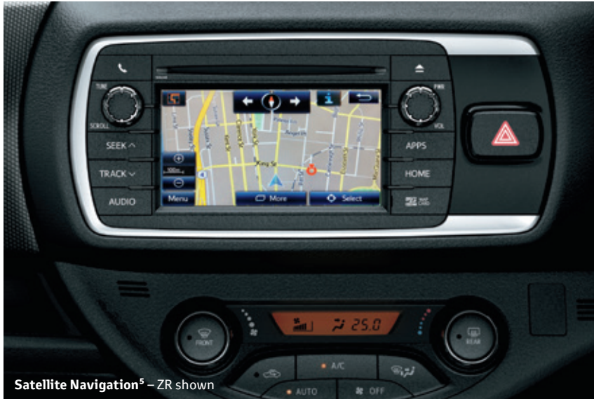
Satellite Navigation 5 – ZR shown