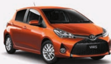
Inferno ® 4R8