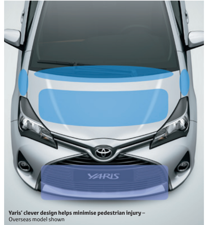
Yaris' clever design helps minimise pedestrian injury – Overseas model shown

For even more added safety, Emergency Brake Signal (EBS) alerts trailing vehicles if you're forced to make a sudden stop.