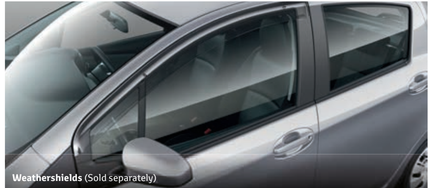
Weathershields (Sold separately)