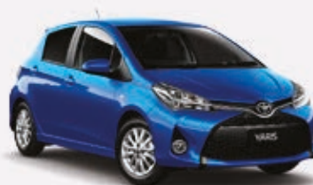
Tidal Blue ® 8T7