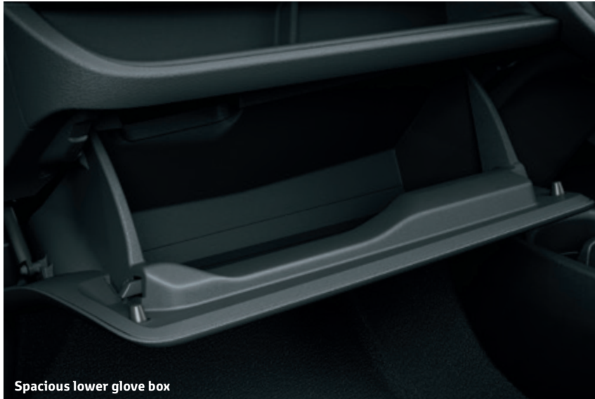
Spacious lower glove box