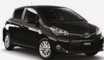
Ink ® 209