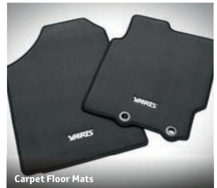
Carpet Floor Mats