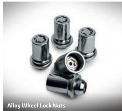
Alloy Wheel Lock Nuts