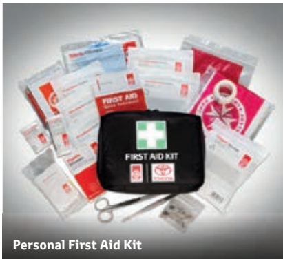
Personal First Aid Kit