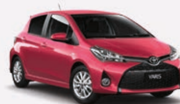
Cosmopolitan ® 3S7