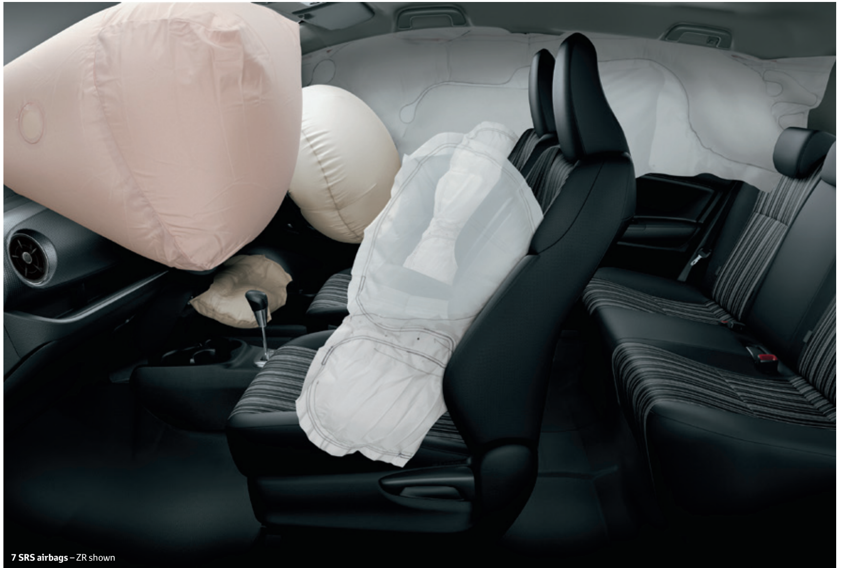
7 SRS airbags – ZR shown