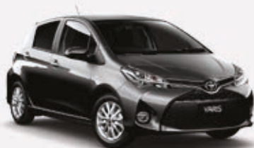
Graphite ® 1G3