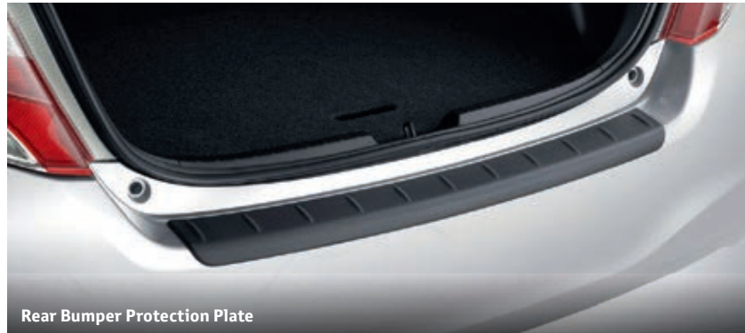
Rear Bumper Protection Plate