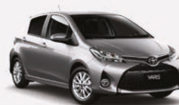
Silver Pearl ® 1F7