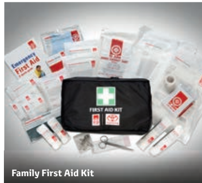
Family First Aid Kit

You can personalise your Yaris with Toyota Genuine Accessories 9 (each sold separately). Whether it's to enhance looks or functionality, they're all developed to strict standards and backed by our Toyota Warranty. 10