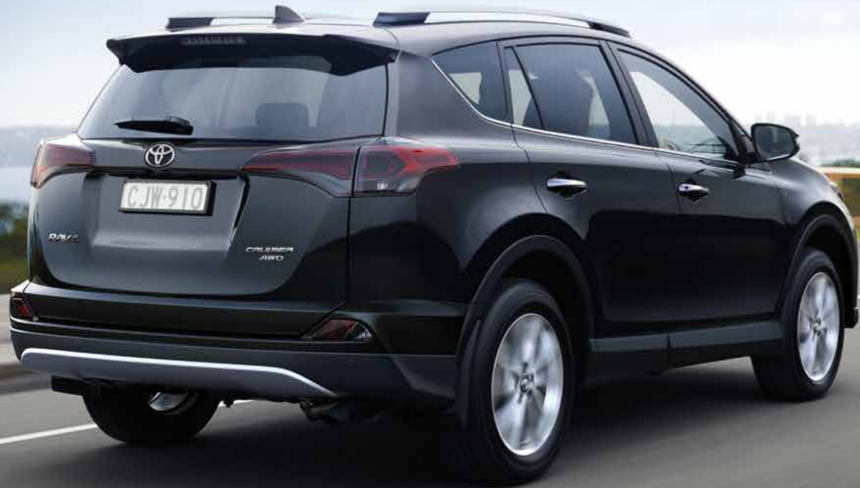
Cruiser Petrol model shown

From the first look it's clear this is a vehicle that wears its stylish sophistication with pride. With the angular headlights, sculpted body, deep grille and squared off bumpers – the RAV4 makes no effort to hide its sporty sense of adventure.