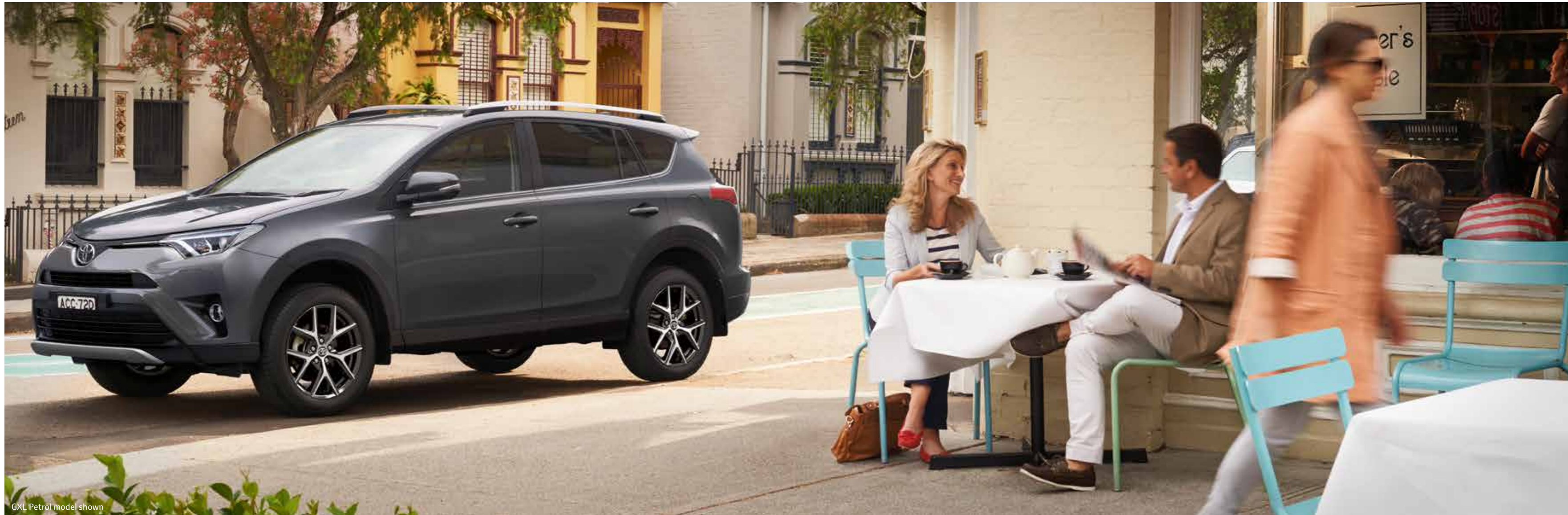
GXL Petrol model shown