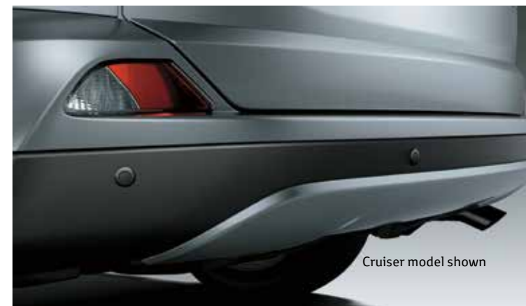
Cruiser model shown