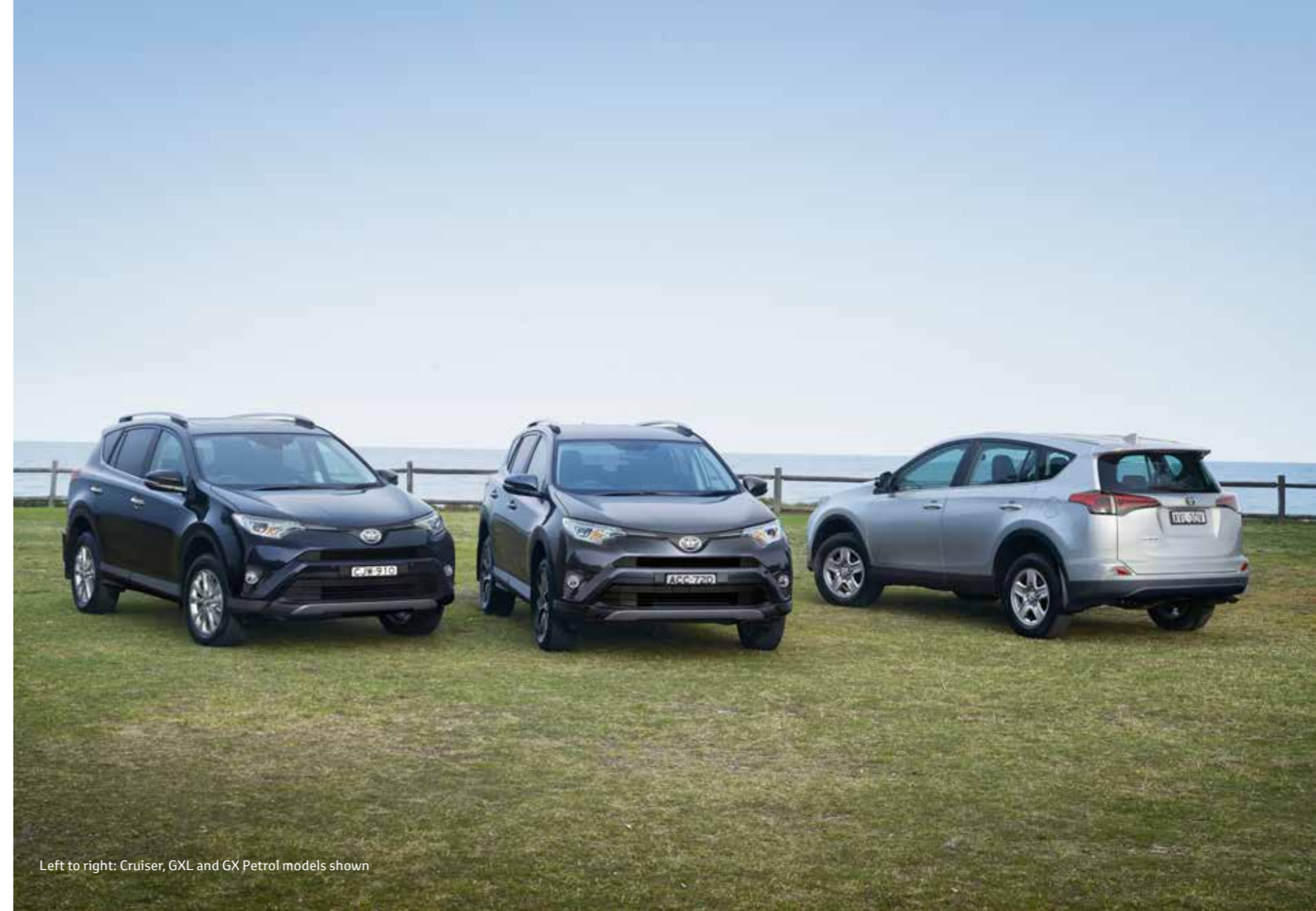
Left to right: Cruiser, GXL and GX Petrol models shown

your Toyota dealer. Toyota Australia reserves the right to change, without notice, prices, colours, materials, equipment, specifications and discontinue colours/models. To the extent permitted by law, Toyota Australia will not be liable for any damage, loss or expense incurred as a result of reliance on this material in any way. Distributed nationally (other than in Western Australia) by Toyota Motor Corporation Australia Limited ABN 64 009 686 097, 155 Bertie St, Port Melbourne 3207. Material distributed in Western Australia by or on behalf of Prestige Motors Pty Ltd (for vehicles) and by Eastpoint Pty Ltd (for parts/accessories). Toyota Australia makes no warranties regarding (and will not be liable for) accuracy of materials distributed in Western Australia. PART NUMBER: TYRAV4PACKBRO. PROOF HQ: T2016-005164. PRINTED: OCTOBER 2016. GTO1725.