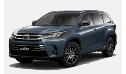
I. Cosmos Blue<sup>12</sup> 8V5