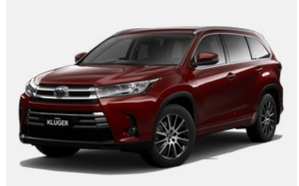
H. Merlot Red<sup>12</sup> 3Q3