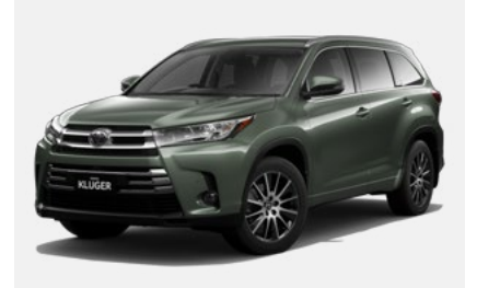
G. Rainforest Green<sup>12</sup> 6W4