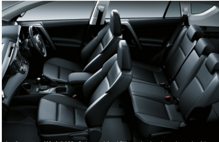
Leather accented black (LA20 – Cruiser model and GXL premium interior option pack only)