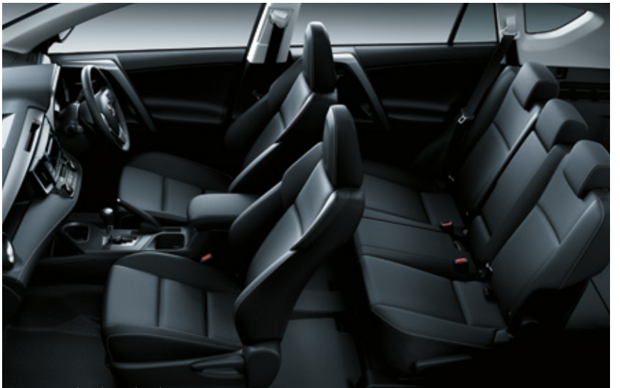
Black fabric with stitching (FA20 – GXL model only)