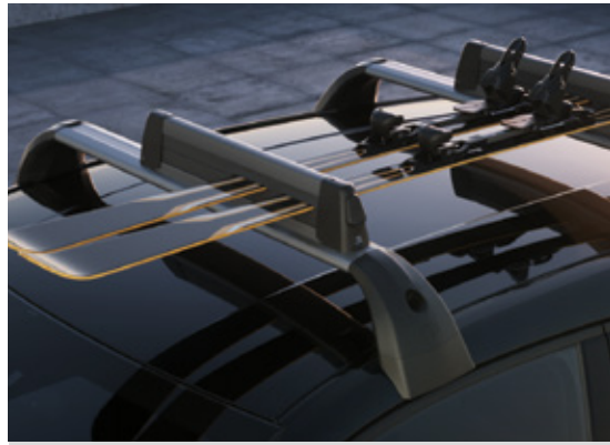
Choose your own adventure with roof racks and bicycle, kayak or ski/snowboard carriers (each sold separately). Roof racks and ski carrier shown.