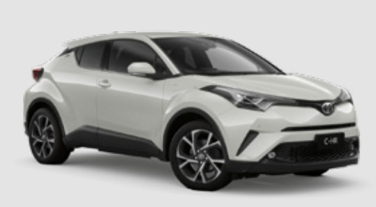
Crystal Pearl<sup>10</sup> 070