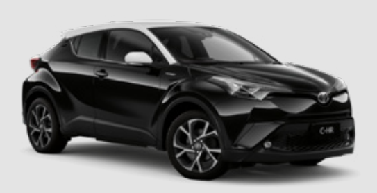
Ink with white roof<sup>10</sup> 2ND