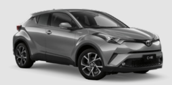
Shadow Platinum<sup>10</sup> 1K0

Now all you have to do is match your C-HR to suit your style.