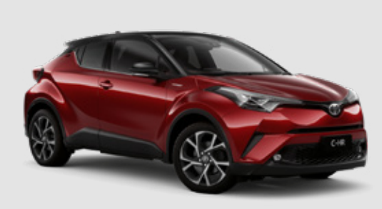
Atomic Rush with black roof<sup>10</sup> 2NF