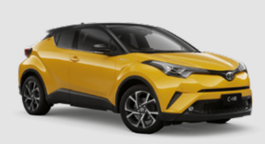
Hornet Yellow with black roof<sup>10</sup> 2PQ