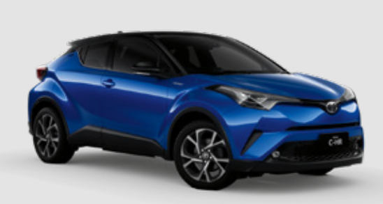
Nebula Blue with black roof<sup>10</sup> 2NH