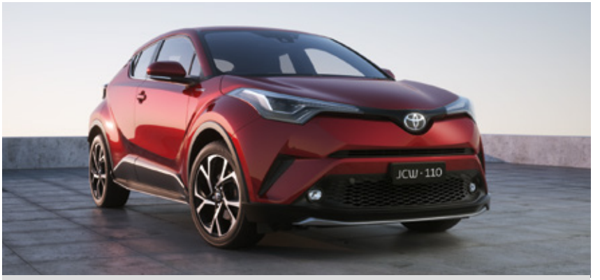
Take your C-HR to the next level in appearance and style with the front skirt, side skirt and rear skirt.