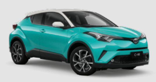
Electric Teal with white roof<sup>10</sup> 2NJ