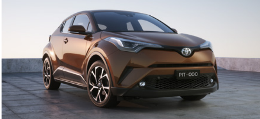
Subtle yet attention-grabbing, the addition of side steps provides easy access to your roof-mounted accessories.