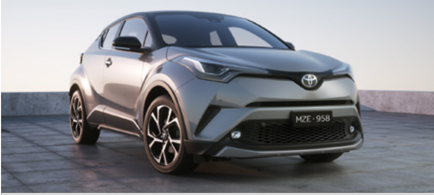
Complement your active lifestyle with the following rugged and tough accessories, including front underrun, side underrun and rear underrun.