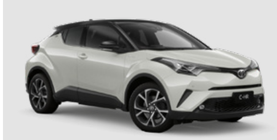
Crystal Pearl with black roof<sup>10</sup> 2NA