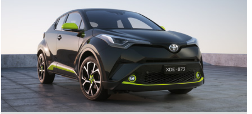
Stand out from the crowd with C-HR's eye catching colours. Garnishes available in White, Grey, Red, Dark Brown or Lime Green. C-HR shown accessorised with front garnish, fog lamp garnish, wheel caps, mirror covers and side garnish.