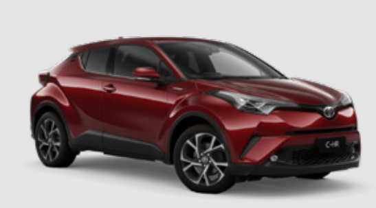
Atomic Rush<sup>10</sup> 3T3