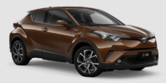
Bionic Bronze<sup>10</sup> 4U3