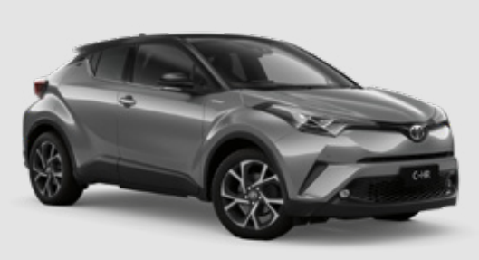
Shadow Platinum with black roof<sup>10</sup> 2NK