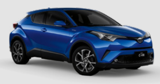
Nebula Blue<sup>10</sup> 8X2