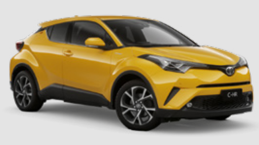
Hornet Yellow 5A3