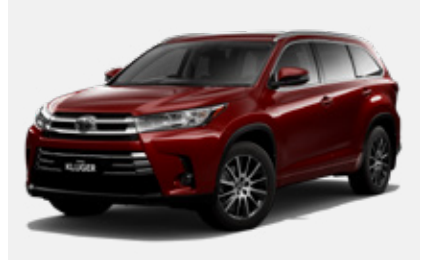
H. Merlot Red<sup>12</sup> 3Q3