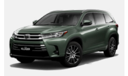
G. Rainforest Green<sup>12</sup> 6W4