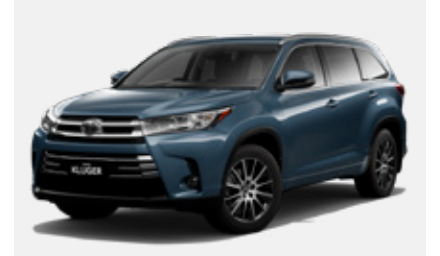
I. Cosmos Blue<sup>12</sup> 8V5