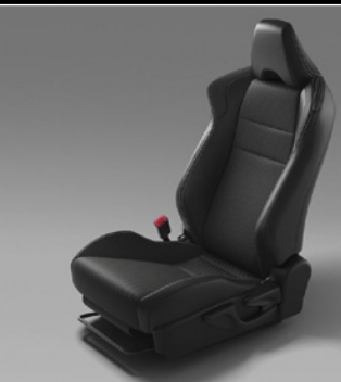
Black leather accented front seats with Alcantara® fabric inserts