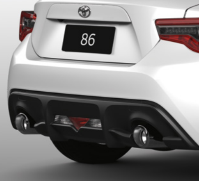
Dual exhaust tail pipes with diffuser