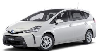
Crystal Pearl 8 070

..... Prius v is available in a choice of two models and nine dynamic colours, so you can choose the model that best suits your family, taste and lifestyle.