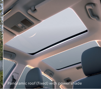
Panoramic roof (fixed) with power shade