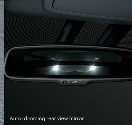
Auto-dimming rear view mirror