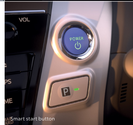
Smart start button