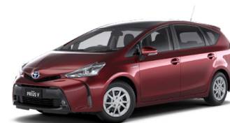
Atomic Rush 8 3T3