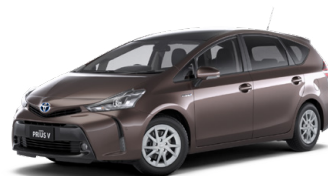
Rustic Brown 8 4W4