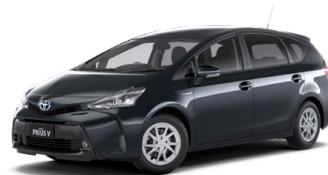
Peacock Black 8 221