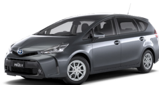
Graphite 8 1G3