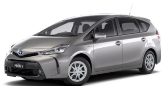
Steel Blonde 8 4X1