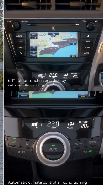
6.1" colour touchscreen display with satellite navigation*