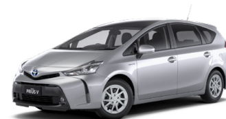
Silver Sky 8 1D6