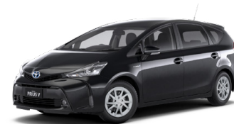
Eclipse Black 8 218