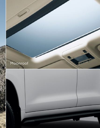
Black anodized look side steps