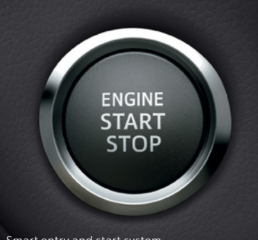
Smart entry and start system