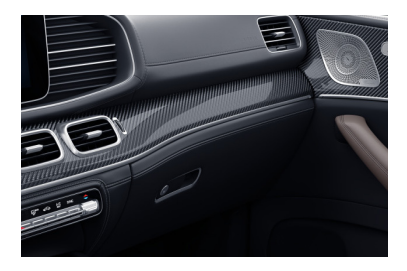
Anthracite open-pore oak wood trim | H31