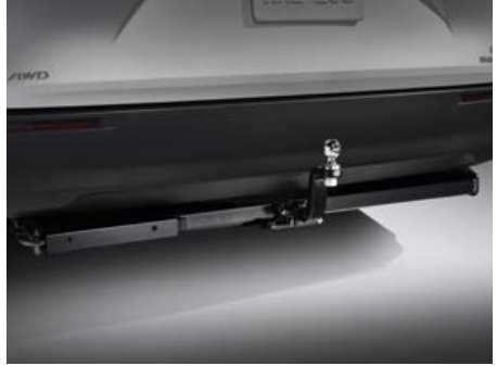
Towing hitch receiver and wiring harness<sup>50, 51</sup>