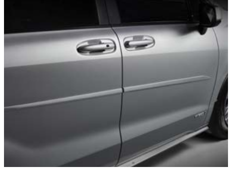
Body side moldings