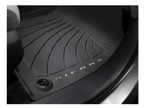
All-weather floor liner<sup>46</sup>

This is a great way to add extra personality to your Sienna. Not every accessory is available in your area, so for a complete list of accessories, go to toyota.com/sienna/accessories.