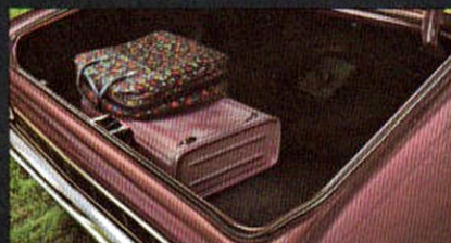
Acadian's trunk—12.7-cubic-foot big.