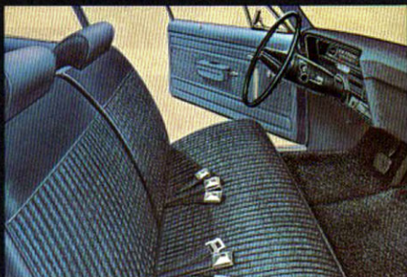
Acadian standard interior.

Good reasons to move to Acadian that will make your Acadian worth a lot more at trade-in. And if getting extra money back after enjoying your car isn't a good idea, we don't know what is.