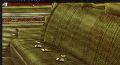
Acadian's Custom interior.