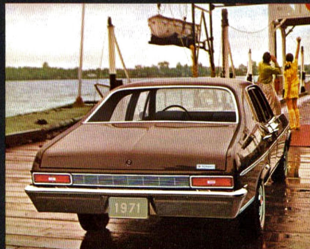
Acadian Sedans know what families need in economical transportation.