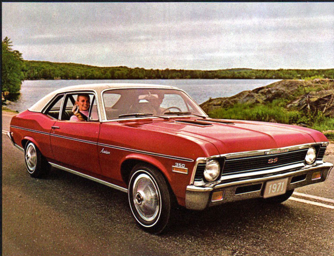
Acadian SS Coupe. Some Acadians are tops in economy, this one is tops in performance.