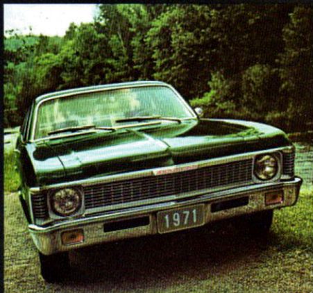
Acadian. You'd never guess it was so low priced.