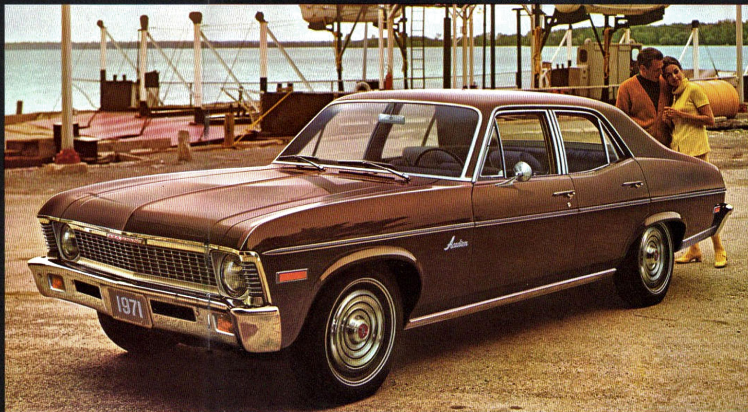
Acadian Four-Door Sedan. This is how Acadian's appearances help you keep up yours. Good looks is just another good reason to move to Acadian.