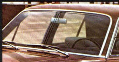
Order a radio and the antenna's hidden in the windshield.