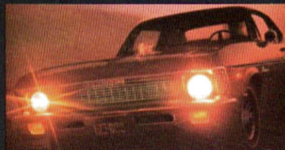
New headlamps give 25 per cent more light.

Some of the equipment illustrated is optional at extra cost.