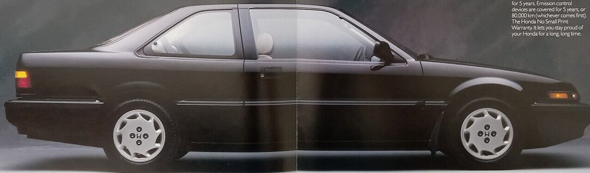
ACCORD EX COUPE

You're covered for surface corrosion for 2 years, perforation for 5 years. Emission control devices are covered for 5 years, or 80,000 km (whichever comes first). The Honda No Small Print Warranty. It lets you stay proud of your Honda for a long, long time.