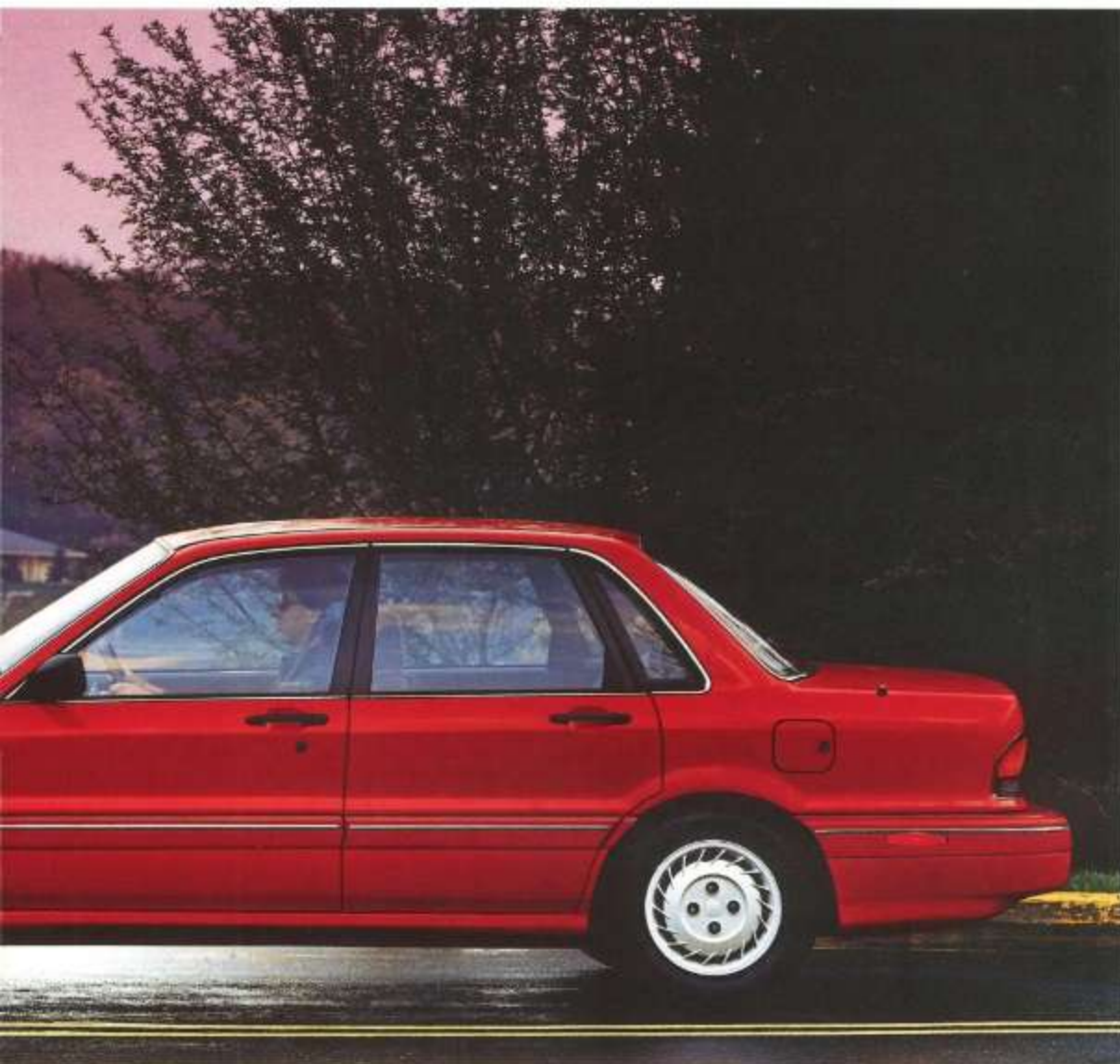
Eagle 2000 GTX

Power is supplied capably by a 2.0 litre 16-valve SOHC Balance-Shaft engine, standard on both models, that delivers 90 kW (120 hp) @ 6000 rpm and 163 N·m (120 lb-ft) @ 4750 rpm.