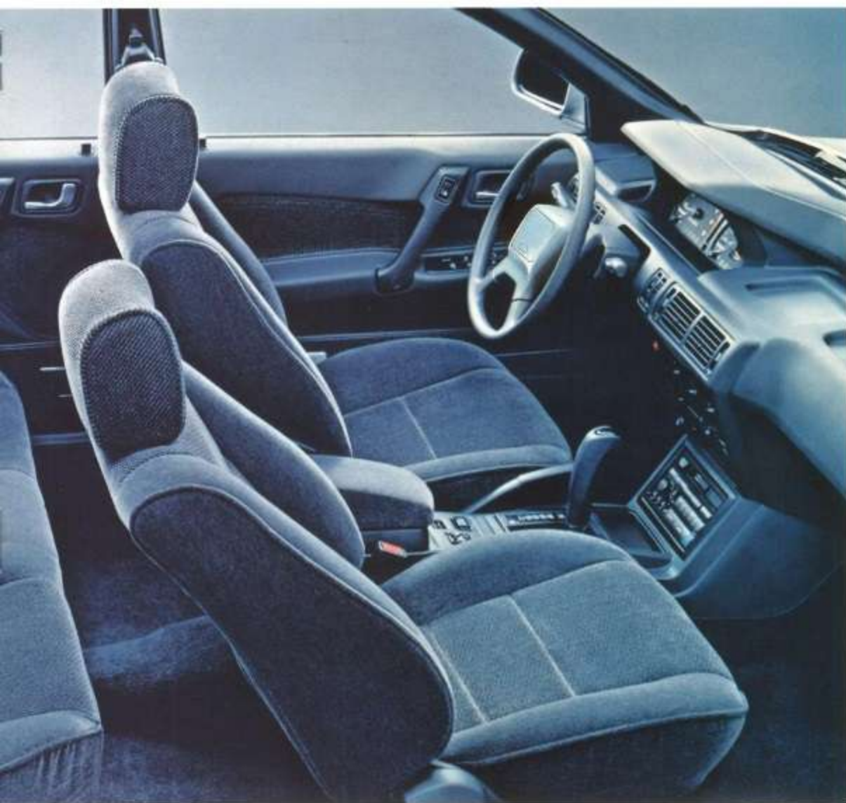
Eagle 2000 GTX Premium interior

2000 GTX Premium offers standard power windows and door locks, dual power mirrors, speed control, rear seat heater ducts, and an electronically tuned AM/FM MPX cassette six-speaker audio system.