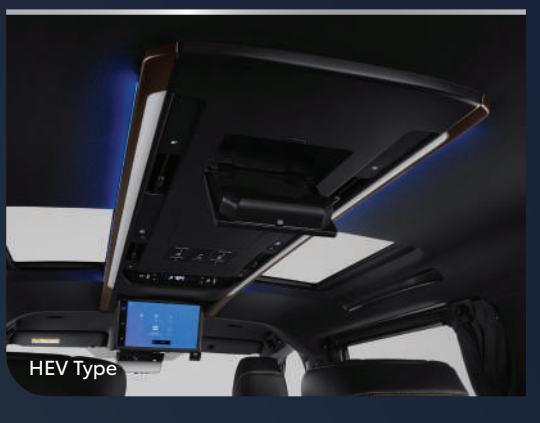
EXPERIENCE HIGH-END LOUNGE Comes with Interior Lighting, Ceiling Storage, and 14" Rear Seat Entertainment to provide you with ease along the journey. (All Type)

The luxurious design and advance features including Steering Wheel, MID, Head Unit Display (All Type), and DVR (G & HEV Type) to satisfy you in every drive.