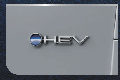
PERFECT EMBLEM COMBINATION New Beyond Zero logo paired with HEV emblem symbolized your effort to contribute for the environment in every trip. (HEV Type)