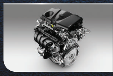
HEV ENGINE Sustainable system design delivers fuel efficiency and environmental friendly in every journey. (HEV Type)

Discover every path with the next level luxury Toyota All New Alphard HEV along with Modellista* design to contribute more for the environment.