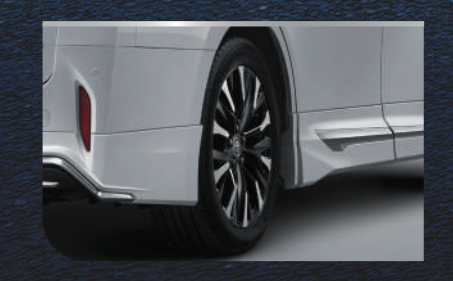
PERFECTION 19" ALLOY WHEEL ON THE ROAD

High-end alloy wheel design to strengthen the glamorous look on the road. (G & HEV Type)