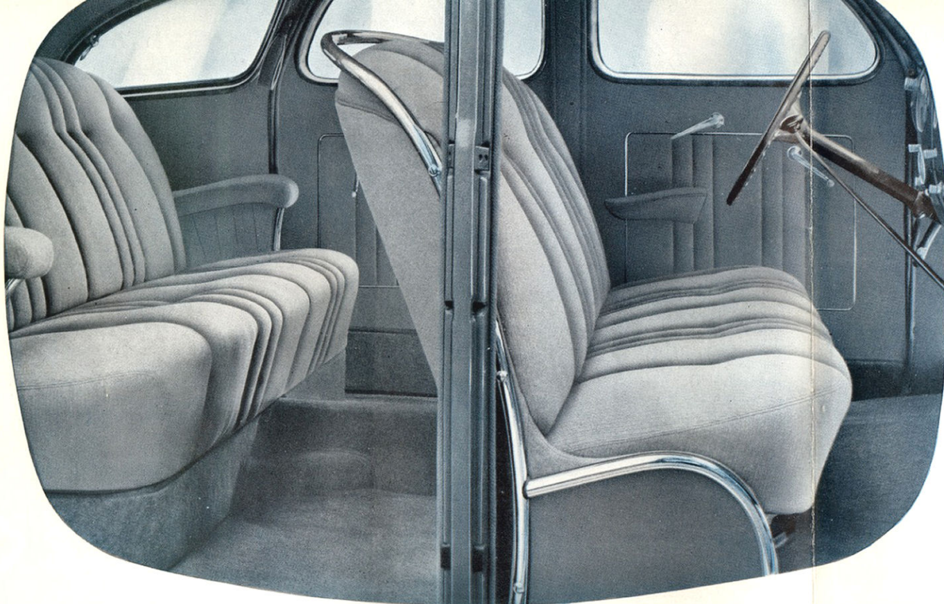
Seats are like divans. You sit as on luxurious cushions. The angle of the seats completely rests the back. Arm rests are on both front doors, and in rear compartments as well.

This compartment holds three or four traveling cases or golf bags. The compartment is lined, is dust-proof and water-proof. . . . Additional tire is also enclosed in rear deck and swings out on specially constructed bracket.