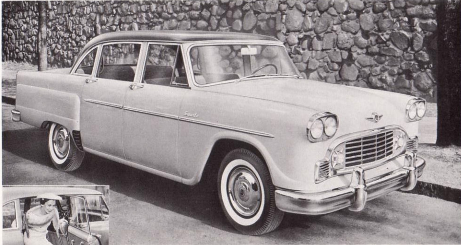
Illustrated: Superba Special Sedan