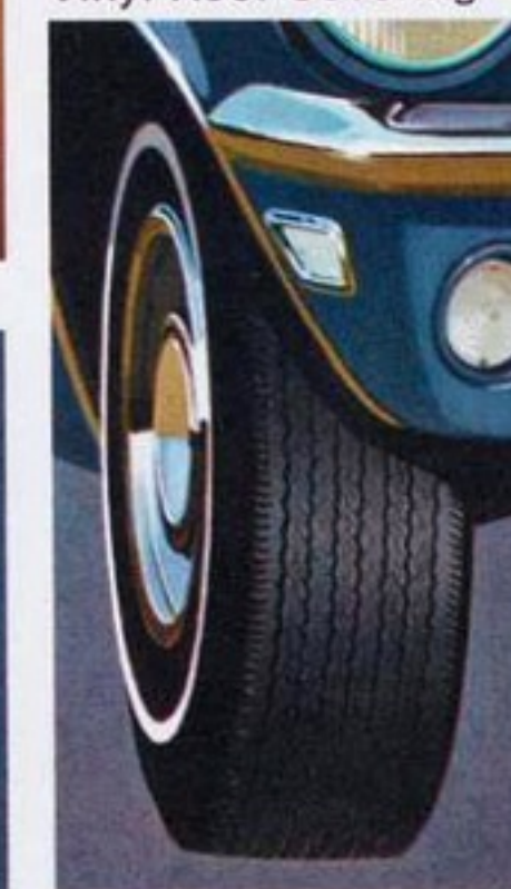
Wide-ovals come with either Radial or Bias Ply