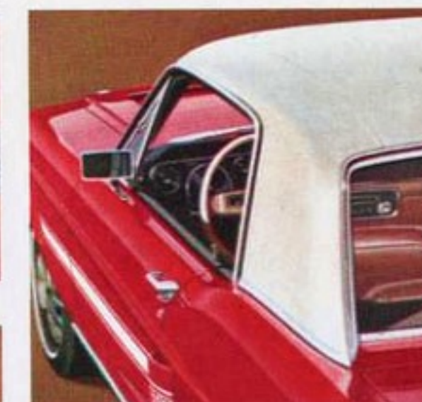
Vinyl Roof Covering