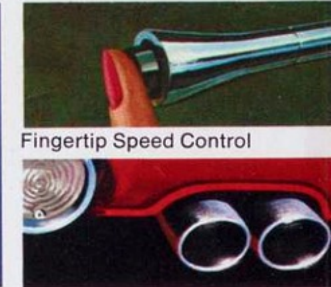
Quad Exhausts (GT Group)