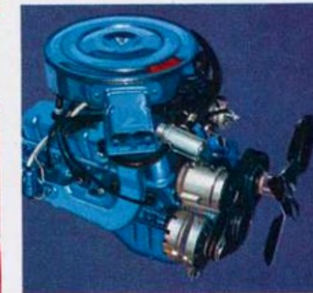
Four V-8's—up to 390 cubes!