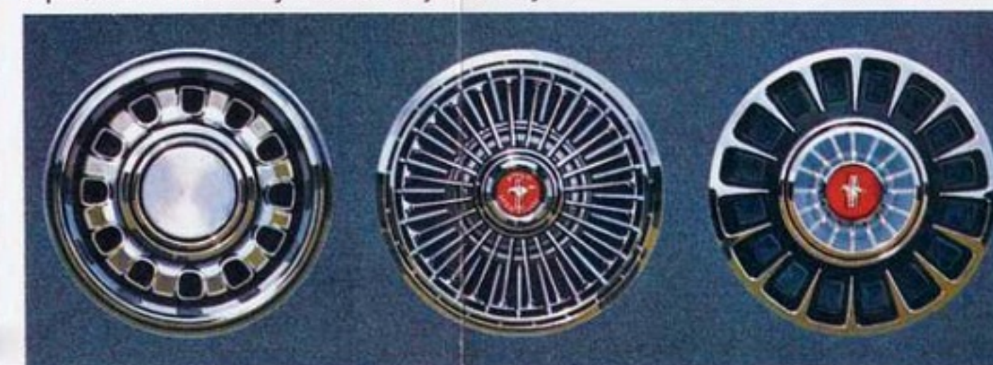
Styled Steel Wheels. Wire-Style or Deluxe Wheel Covers