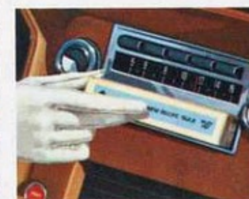
Stereo Tape System