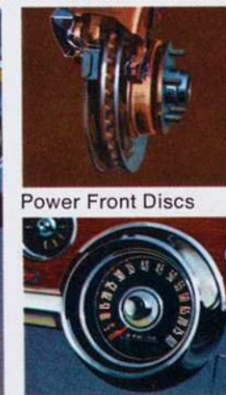
Power Front Discs