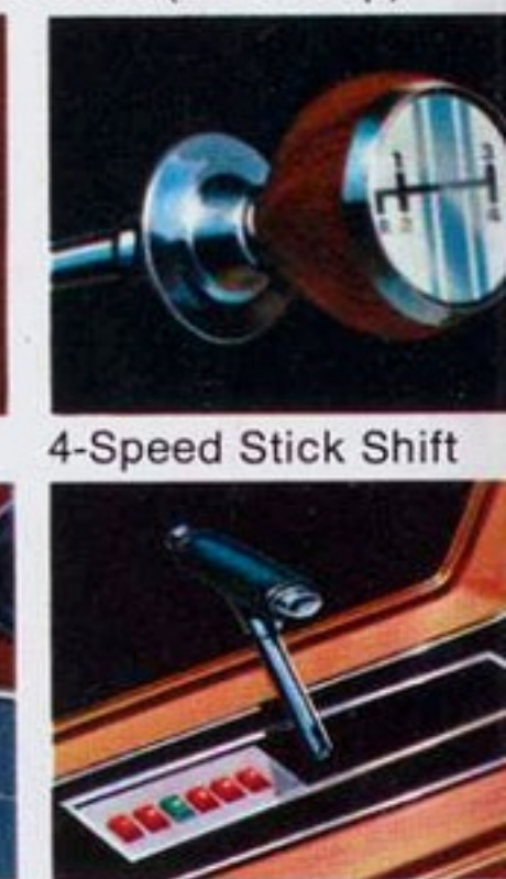
4-Speed Stick Shift