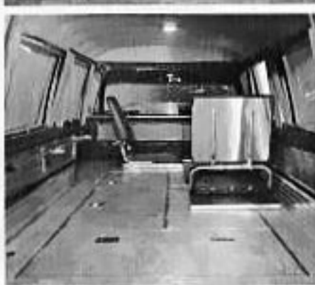
E. & F. S&S Dup-Floor