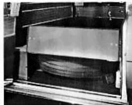
G. Spare Tire Storage