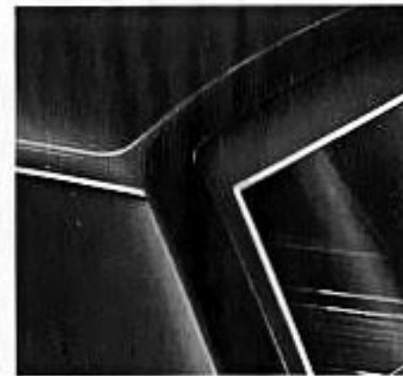
J. Roof Chamfer Line