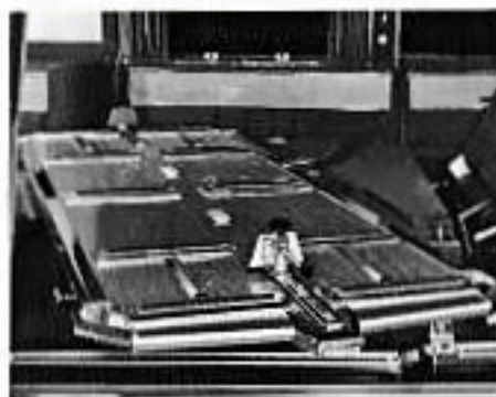
C. S&S Electric 3-Way Compu-Troled Table