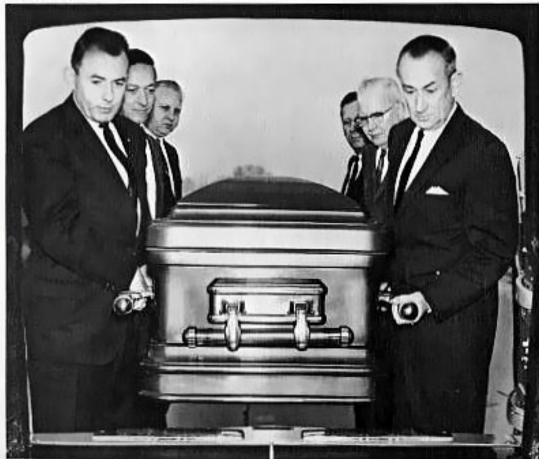
B. Extra-Wide Rear Door