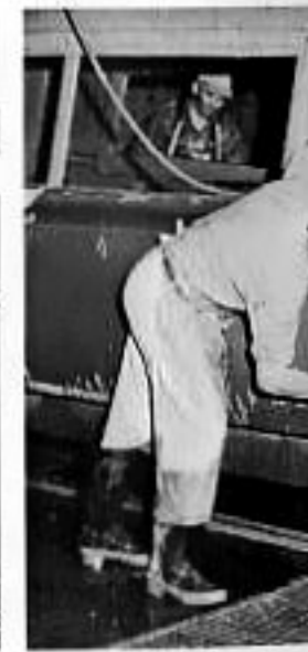
M. Hand Sanding