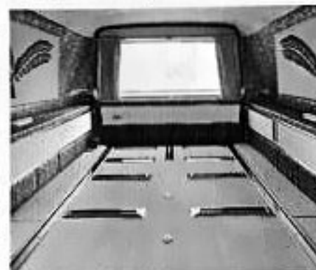
H. Improved Rear Vision