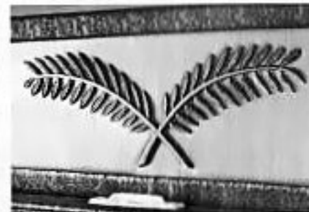
I. The Cycas Leaf