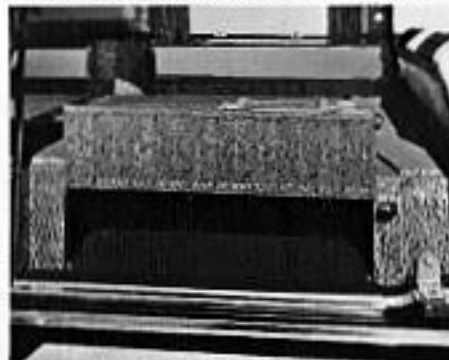
D. Church Truck Compartment