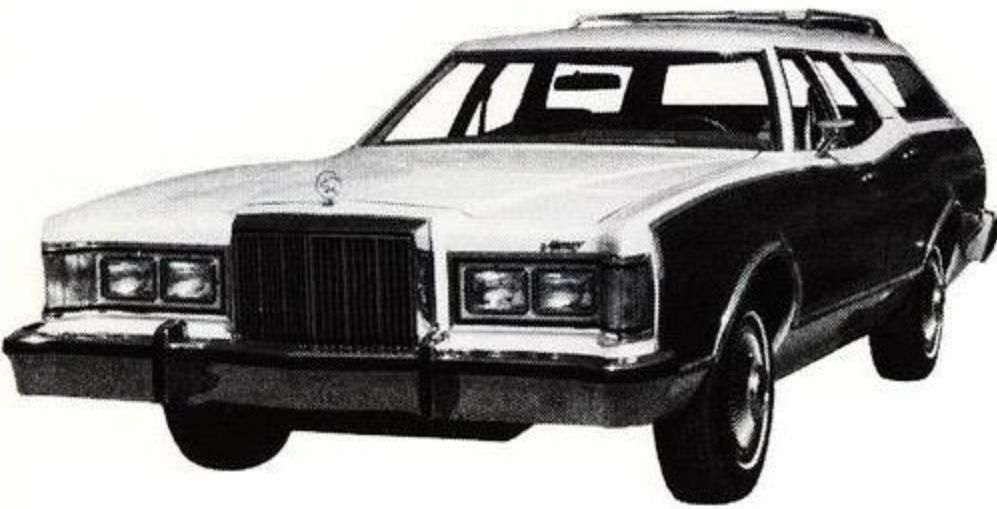
Cougar Villager Station Wagon*