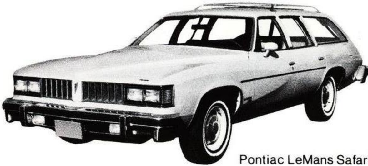
Pontiac LeMans Safari*