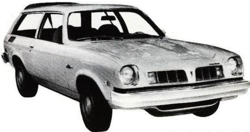
Pontiac Astre Safari*