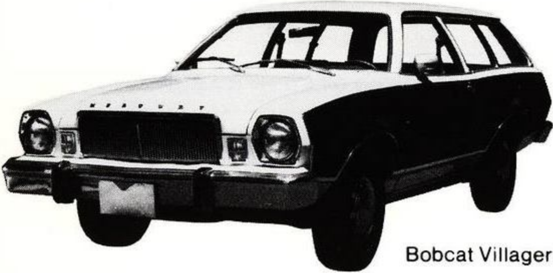
Bobcat Villager Station Wagon*