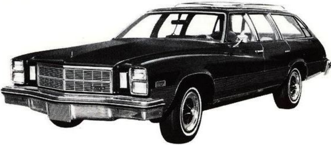
Buick Century Custom Station Wagon with Woodgrain Bodyside Option*