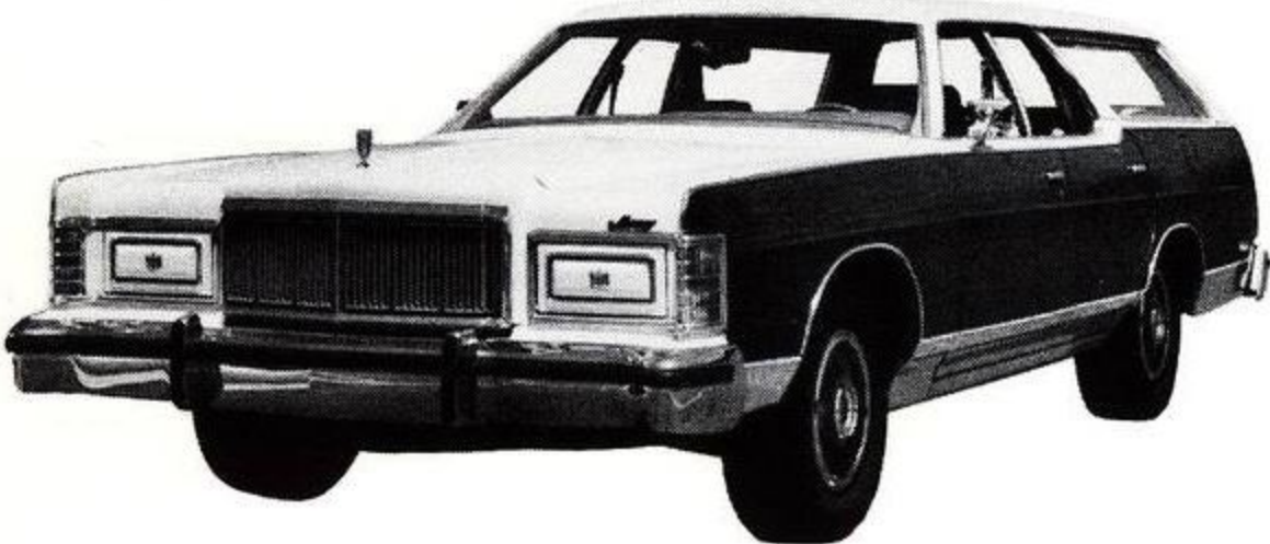
Marquis Station Wagon with Colony Park Option*