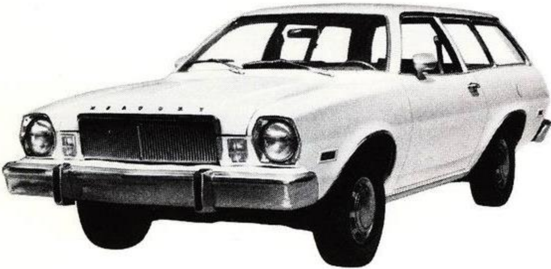
Bobcat Station Wagon*