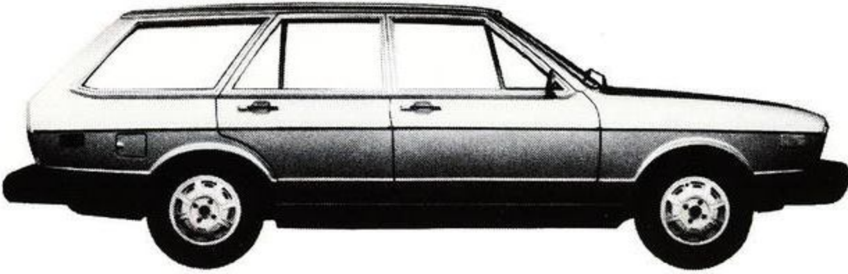
VW Dasher Station Wagon*