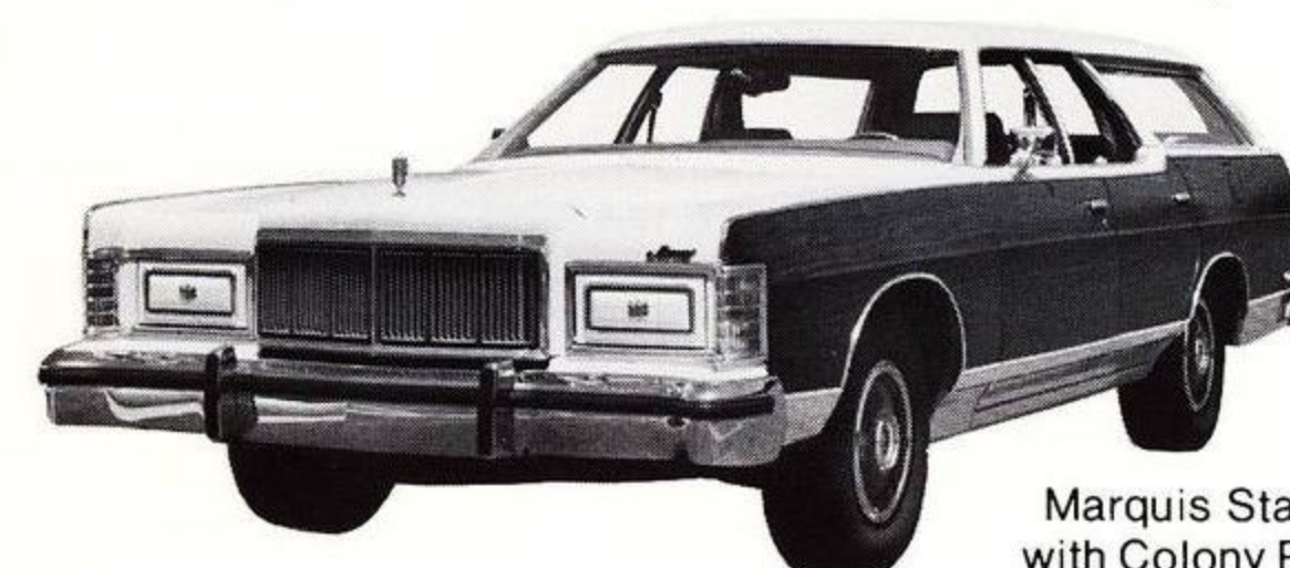
Marquis Station Wagon with Colony Park Option*