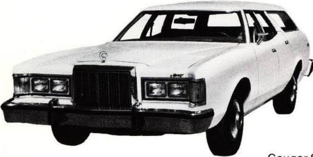
Cougar Station Wagon*