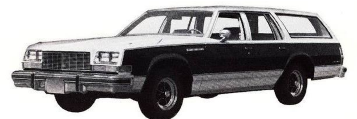
Buick Estate Wagon with Woodgrain Bodyside Option*