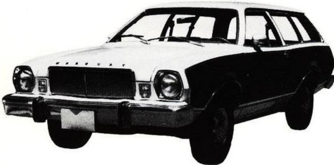
Bobcat Villager Station Wagon*