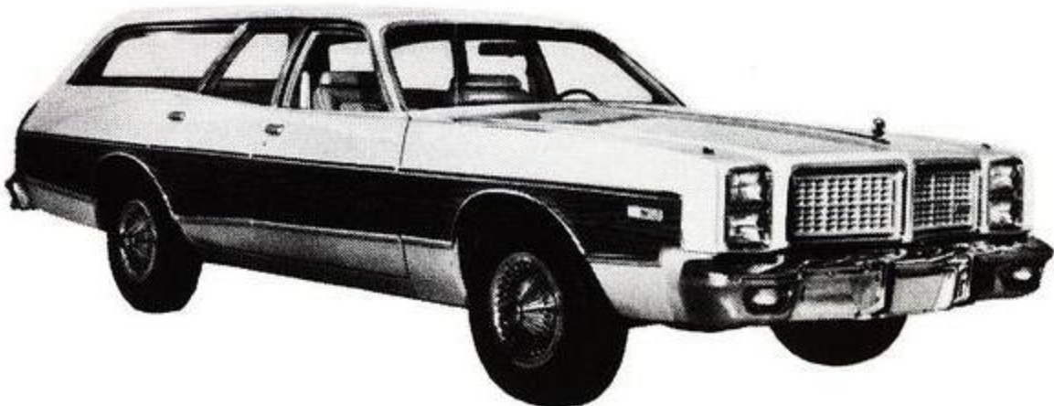
Dodge Monaco Crestwood Station Wagon*