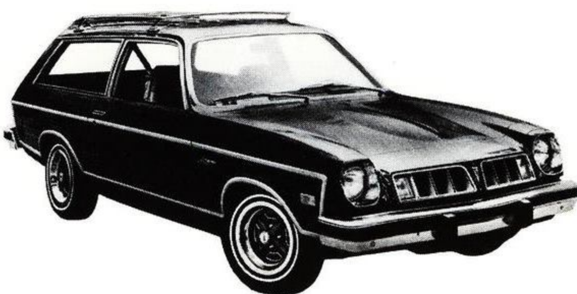
Pontiac Astre Safari with Woodgrain Bodyside Option*