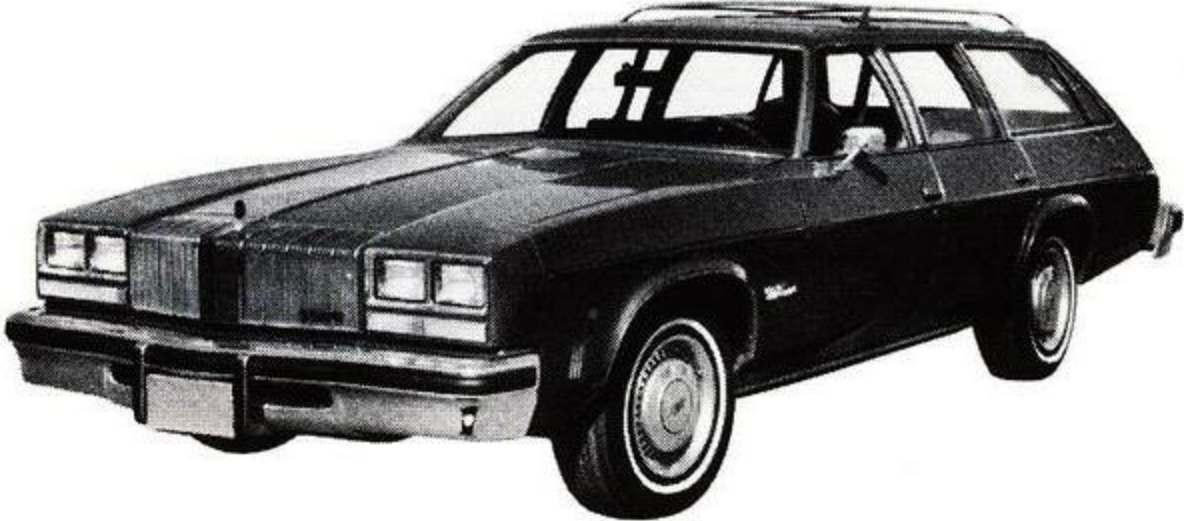
Oldsmobile Vista Cruiser*