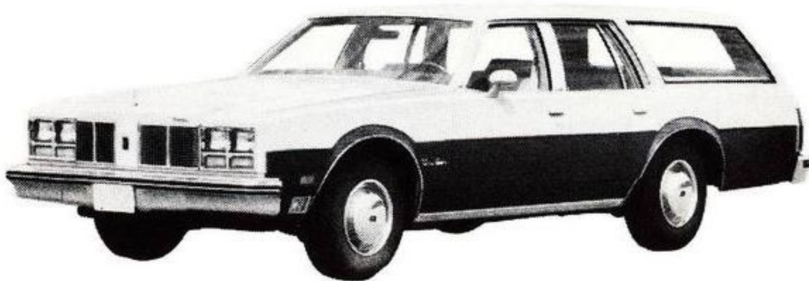
Oldsmobile Custom Cruiser with Woodgrain Bodyside Option*