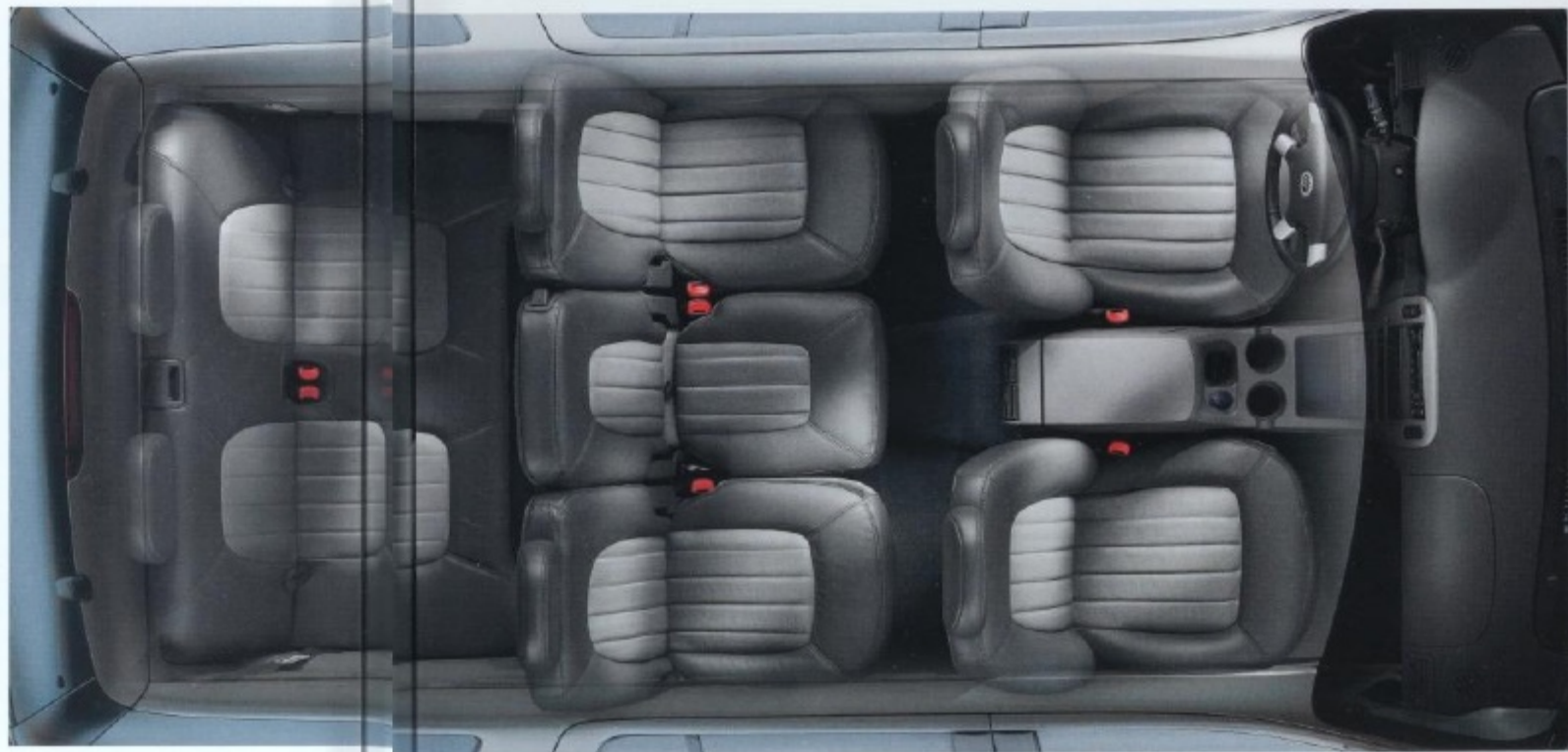
2002 Mercury Mountaineer with two-toned dark graphite interior. Shown with available equipment.