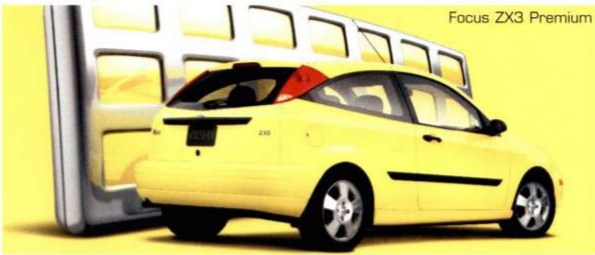
Focus ZX3 Premium

FOCUS IS ALL ABOUT CHOICE. STYLE. GOOD TIMES. DRIVING FUN. FLEXIBILITY. FRIENDS. FAMILY. COME TO THINK ABOUT IT... FOCUS IS A LOT OF THINGS, BECAUSE IT'S NOT JUST ONE CAR, BUT FOUR DIFFERENT CARS. THERE'S FIVE-DOOR FUNCTIONALITY IN FOCUS ZX5. FOCUS ZX3 HAS... YOU GUESSED IT: TWO DOORS AND A HATCH FOR EASY ACCESSIBILITY. TOTAL EUROPEAN SOPHISTICATION IS YOURS IN FOCUS SEDAN. GOT MORE STUFF? FOCUS WAGON IS VERY ACCOMMODATING. BUT LET'S TALK HIGH PERFORMANCE. FOR THAT, YOU'VE GOTTA CHOOSE THE SVT FOCUS ZX3 OR ZX5 (SHOWN RIGHT). IT'S DECKED OUT WITH A HIGH-REVVING TWIN-CAM 16-VALVE ENGINE, GETRAG ™ 6-SPEED MANUAL TRANSMISSION, 17" WHEELS, HUGE 4-WHEEL DISC BRAKES, UNIQUE FRONT/REAR FASCIAS, ALUMINUM PEDALS/SHIFTER, OPTIONAL HIGH-INTENSITY DISCHARGE PROJECTOR HEADLAMPS AND A LOT MORE COOL STUFF. ON TOP OF THAT, EVERY FOCUS HAS A GROUP OF STANDARD EQUIPMENT THAT READS LIKE A MOST-WANTED LIST. YOU'LL BE REWARDED WITH FUN, FUNCTIONAL STUFF LIKE A 60/40 SPLIT-FOLD REAR SEAT (1), STANDARD ROOM FOR FIVE (LEATHER TRIM SHOWN IS OPTIONAL), STORAGE NOOKS EVERYWHERE, PLUS ONE OF THE MOST INTERESTING INSTRUMENT PANELS EVER TO DISPLAY AN ENGINE'S VITALS (2).