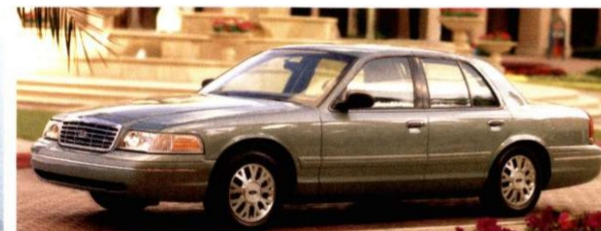
CROWN VICTORIA/PAGE 10