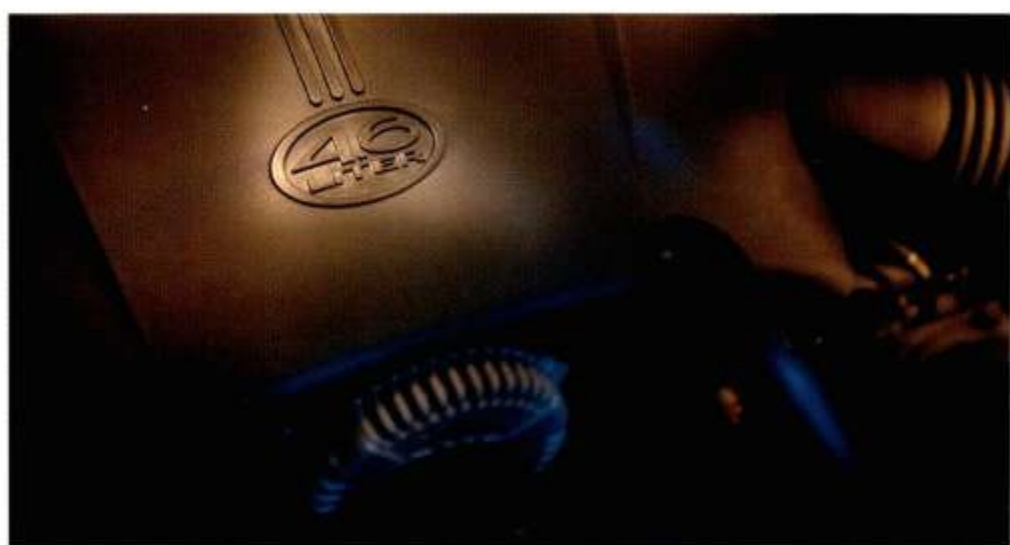
4.6L OHC SEFI V8