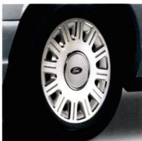
16" Cross-Spoke Locking Wheelcover Standard on Crown Victoria