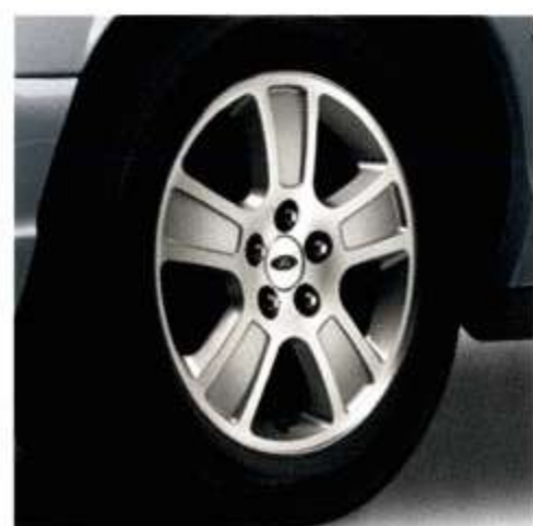
17" 5-Spoke Aluminum Wheel Standard on LX Sport