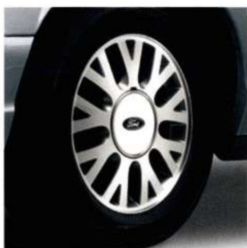
16" 12-Spoke Aluminum Wheel Standard on LX