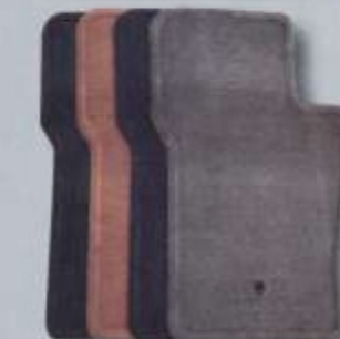
CARPETED FLOOR MATS