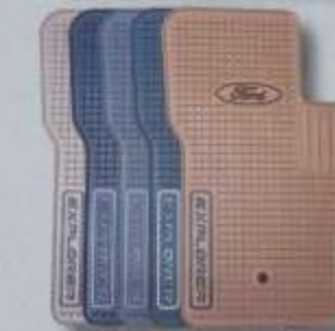
MOLDED VINYL FLOOR MATS