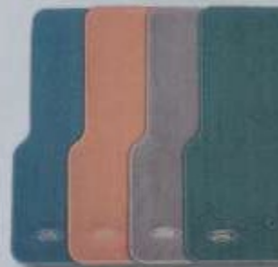
UNIVERSAL FLOOR MATS