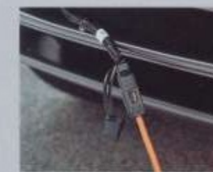
ENGINE BLOCK HEATER

The following Ford Quality Care Brand Accessories are also available to add that "personal touch" to your new Ford Explorer.