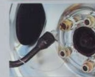
STYLED WHEEL PROTECTOR LOCKS

For complete details on these fine accessories, consult your dealer.