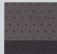
Dark Charcoal Leather

Comparisons based on 2002 competitive models, publicly available information and Ford certification data at time of printing. Some features discussed may be optional. Vehicles shown may contain optional equipment. Features shown may be offered only in combination with other options or subject to additional ordering requirements or limitations. Following publication of the catalog, certain changes in standard equipment, options and the like, or product delays, may have occurred which would not be included in these pages. Your Ford Dealer is the best source for up-to-date information. Ford Division reserves the right to change product specifications at any time without incurring obligations.