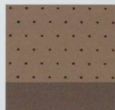
Medium Prairie Tan Leather