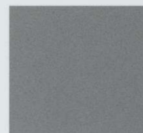
Silver Frost Metallic