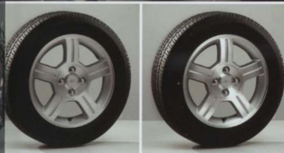
Standard 15" Painted Aluminum Wheel