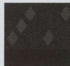
Dark Charcoal Cloth