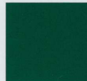
Grabber Green Metallic