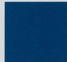
Bright Island Blue Metallic