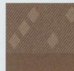
Medium Prairie Tan Cloth