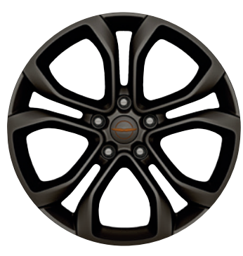
20-INCH LUSTER GRAY POLISHED ALUMINUM Included with Road Tripper Package on Touring L FWD/AWD (WH6)