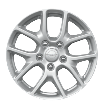
17-INCH FULLY PAINTED TECH SILVER CAST ALUMINUM Standard on Touring L FWD (WFN)