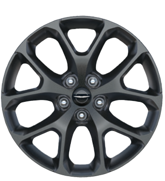
20-INCH ALUMINUM WITH FORESHADOW FINISH Included with S Appearance Package on Touring L FWD/AWD (WPF)