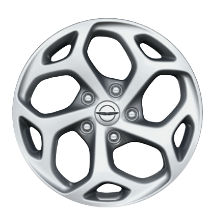
18-INCH PAINTED CAST ALUMINUM Standard on Limited FWD/AWD (WBA)