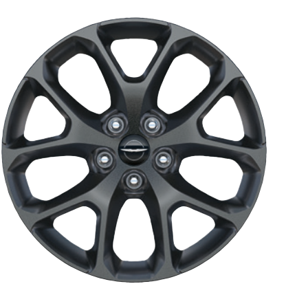
20-INCH CAST ALUMINUM WITH FORESHADOW FINISH Included with S Appearance Package on Limited FWD/AWD (WPF)