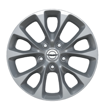
18-INCH FULL-POLISHED HIGH-GLOSS ALUMINUM Standard on Touring L AWD (WBS)