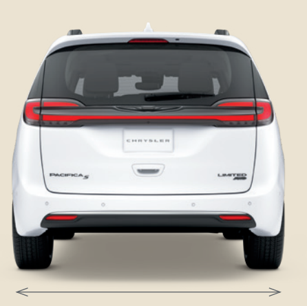
68.3 FWD / 68.8 AWD / 68.2 PLUG-IN HYBRID rear track