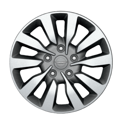
17-INCH DIAMOND-CUT CAST ALUMINUM WITH BALTIC GRAY POCKETS Standard on Select Plug-In Hybrid (WJR)