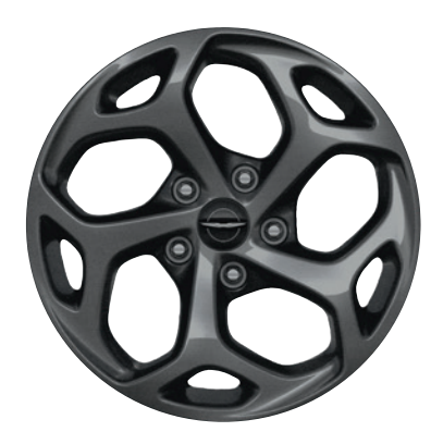
18-INCH CAST ALUMINUM WITH FORESHADOW FINISH Included with S Appearance Package on Select Plug-In Hybrid (WP6)