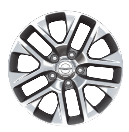
18-INCH POLISHED CAST ALUMINUM WITH BALTIC GRAY POCKETS Standard on Pinnacle Plug-In Hybrid (WDP)