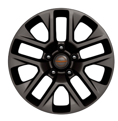
18-INCH LUSTER GRAY POLISHED ALUMINUM WITH ORANGE CHRYSLER WING CENTER CAP BADGING Included with Select Road Tripper (WBF)