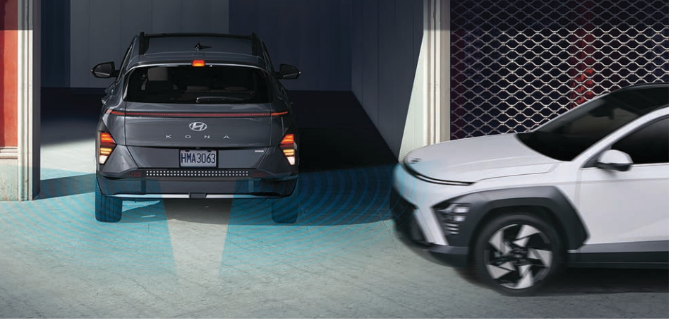
Rear Cross-Traffic Collision-Avoidance Assist

Parking? Kona Electric Limited's Surround View Monitor helps alleviate the stress of chaotic parking lots.11 Its Parking Distance Warning-Reverse/Forward/Side feature with a new Contour Warning provides visual and audio alerts based on the proximity of surrounding objects. Parking Collision-Avoidance Assist-Reverse automatically assists with emergency braking if the risk of a collision increases after the initial warning. Using buttons on your key fob. you can also pull your vehicle into and out of tight parking spaces using Remote Smart Parking Assist from outside of your vehicle.<sup>13</sup>