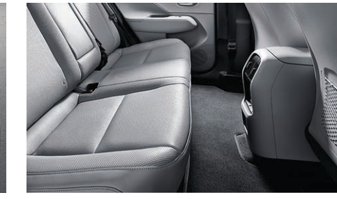
2nd-row flat floor