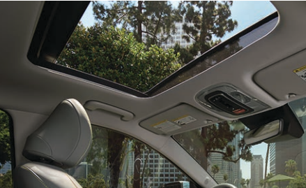
Power tilt-and-slide sunroof