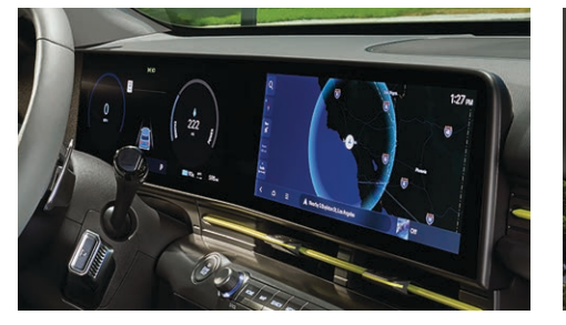
Dual 12.3" integrated displays