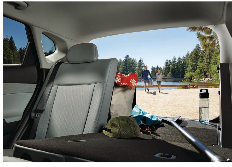
60/40 split fold-flat 2nd-row seatbacks