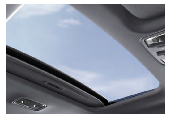
Power sunroof<sup>1</sup> for that wide-open, blue sky feeling.

Settle into the standard heated front seats and enjoy the pleasing feel of the surfaces and controls. For a sportier feel, step up to the GT trims, with air-cooled, sport front seats, a leather-wrapped sport steering wheel, and paddle-shifters. The 2024 Forte. A total treat for the senses.