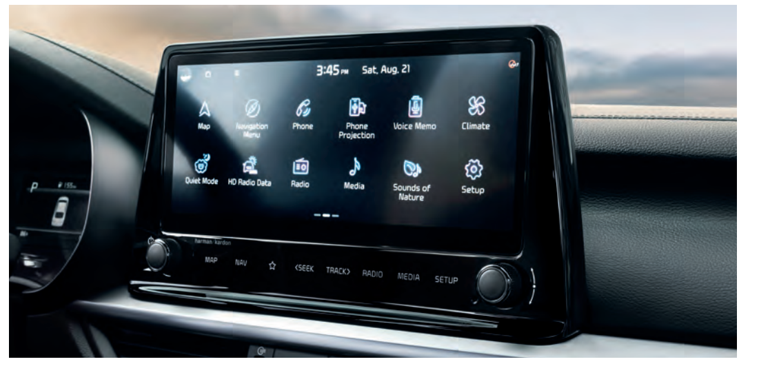
10.25" multimedia interface <sup>1,4</sup> with integrated touch-screen navigation.

The Forte's modern cockpit has a clean, sleek design, intuitively placed controls, and the features you want to keep you comfortably in control.