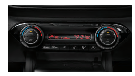
Dual-zone automatic climate control <sup>1</sup> lets you set your ideal cabin temperature.