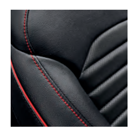
EX Black cloth