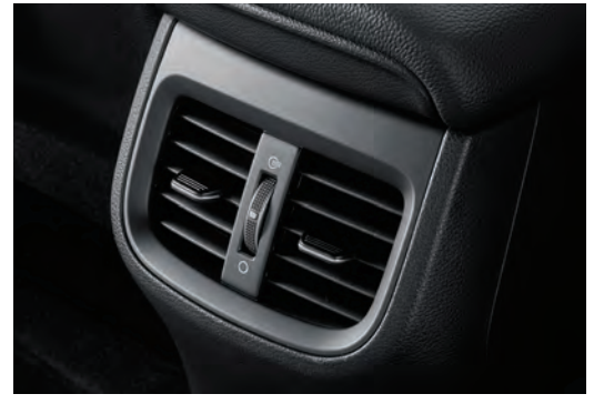
Rear ventilation provides comfort to rear seat passengers.