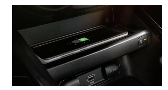
Wireless charging<sup>1,3</sup> keeps your smartphone charged while you're on the road.