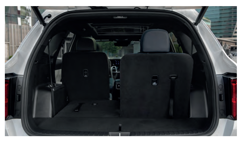
The smart power liftgate opens automatically —and lets you set a maximum opening height.*

* Available feature. Visit kia.ca for full details.