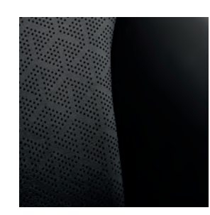
EX, EX+ Black leather (synthetic)