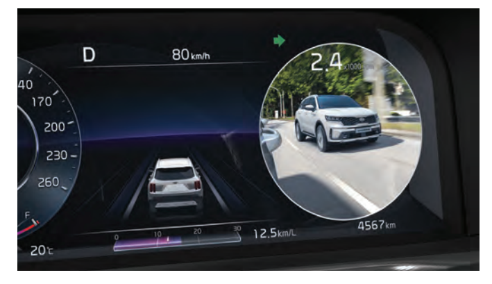
Blind view monitor displays the blind spot in the direction your turn signal is indicating.*

Multi-zone automatic climate control lets you set your ideal cabin temperature.