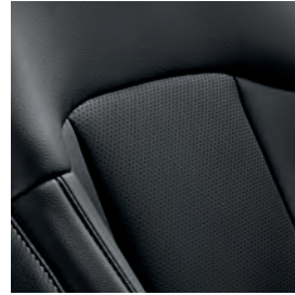
EX Black leather (synthetic)