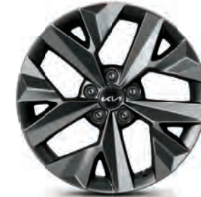
SX 18" alloy wheels