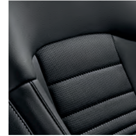
SX Black quilted leather (synthetic)