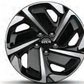
EX 17" alloy wheels