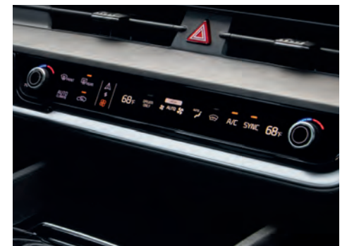
Infotainment/climate switchable controller share the same LCD softkey keyboard.