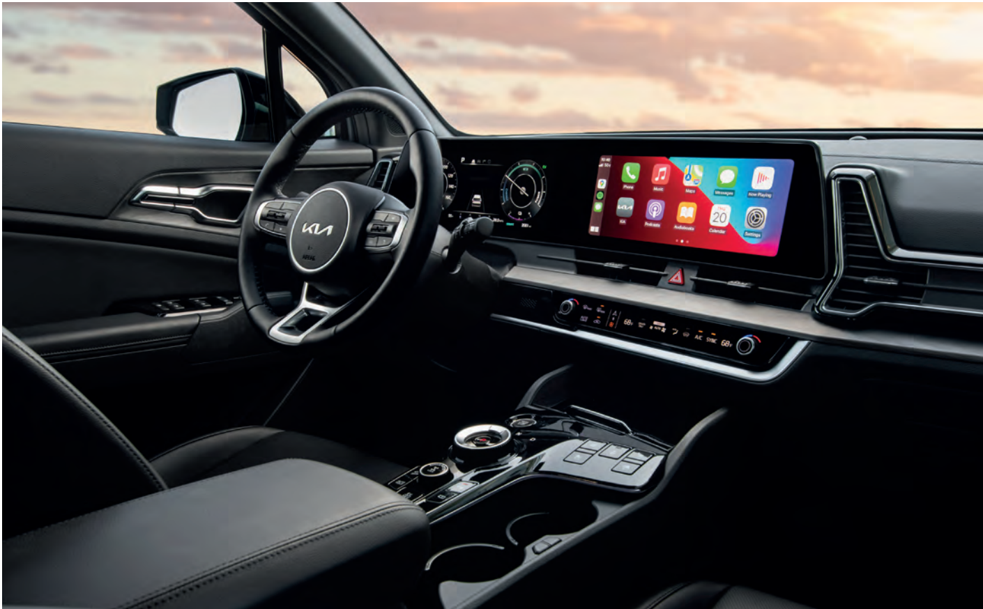
A 12.3" multimedia interface gives you at-a-glance control of navigation, audio and various vehicle system functions.