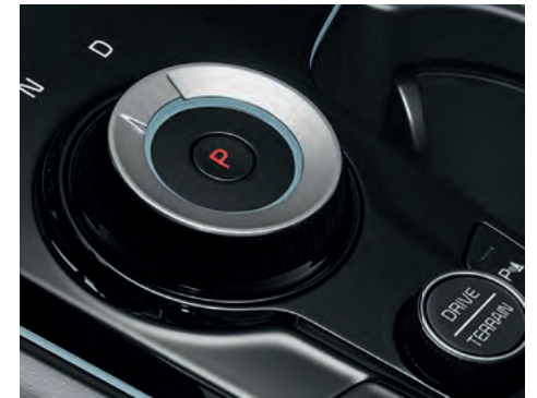
Quick-shifting electronic Shift By Wire (SBW) technology and standard Drive Mode Select (DMS) that adjusts transmission, throttle, and steering response.