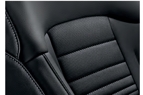
Eco-friendly seat trim combines the rich look and feel of quilted leather with the durability and spill resistance of a synthetic.*