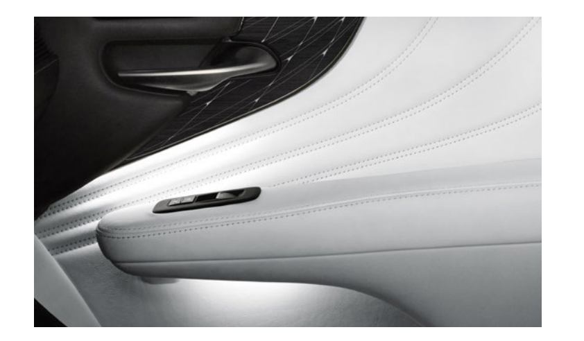
LS shown with Palomino leather and Artwood Organic Gloss interior trim