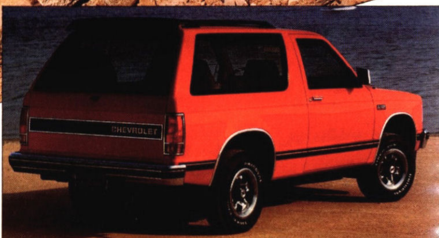
■ S-10 Blazer Tahoe in Cinnamon Red.

2WD S-10 Blazer. The possibilities are endless.