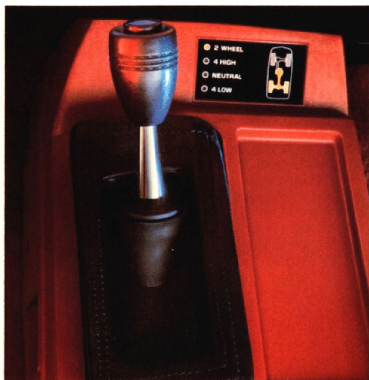
■ Insta-Trac 4-wheel-drive made easy.