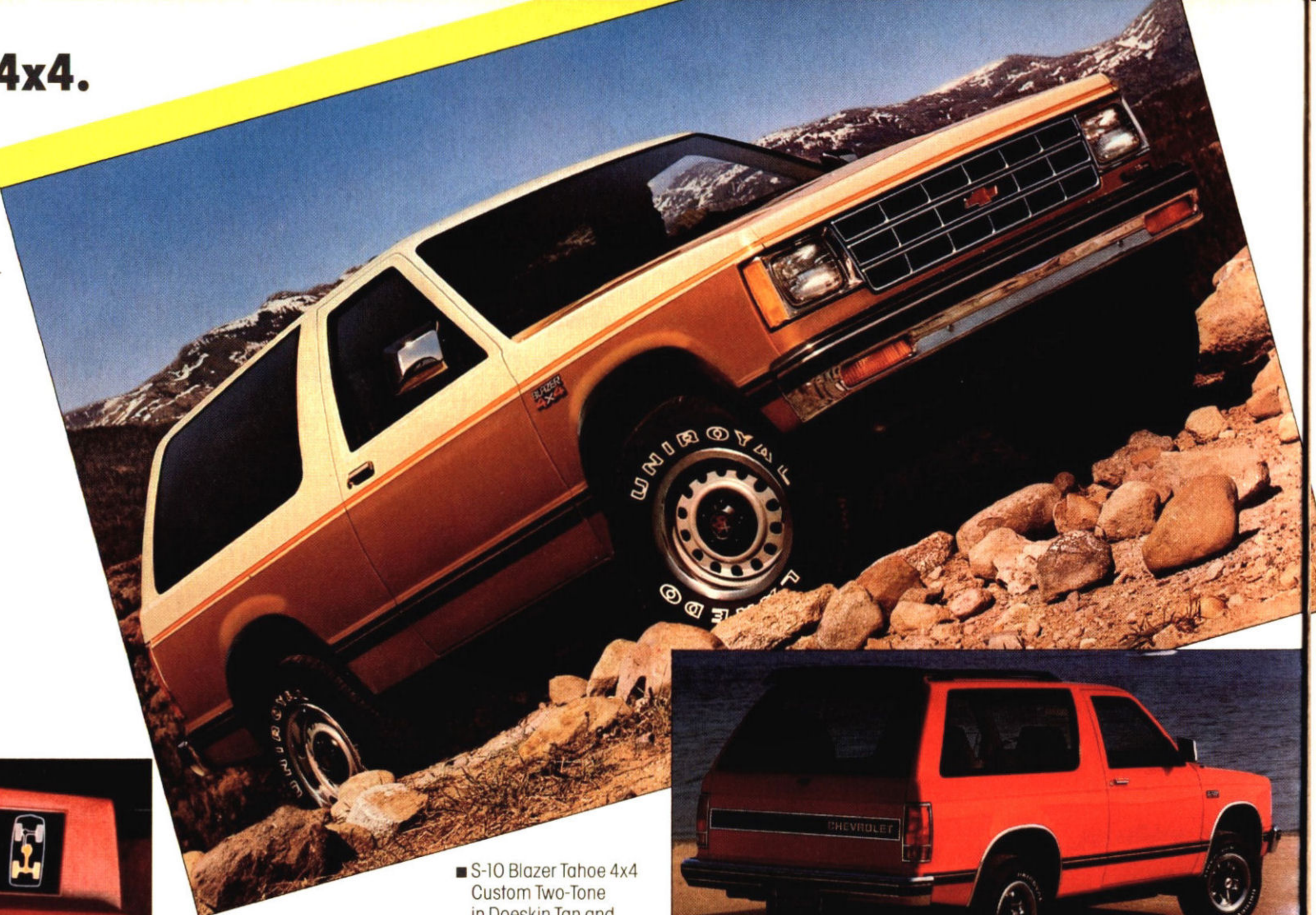
■ S-10 Blazer Tahoe 4x4 Custom Two-Tone in Doeskin Tan and Nevada Gold Metallic.

If you push the limits, S-10 Blazer 4x4 is your way to go.