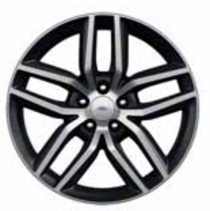
XR6 Turbo 19 " x 8.0 " alloy

*Prestige paint is an option that incurs an additional charge. Colour range shown for vehicles produced as at August 2016. Colours may be discontinued any time at Ford's discretion. Stock may vary and certain colours may not be available from time to time. Always consult with an authorised Ford dealer for the latest information on colour availability