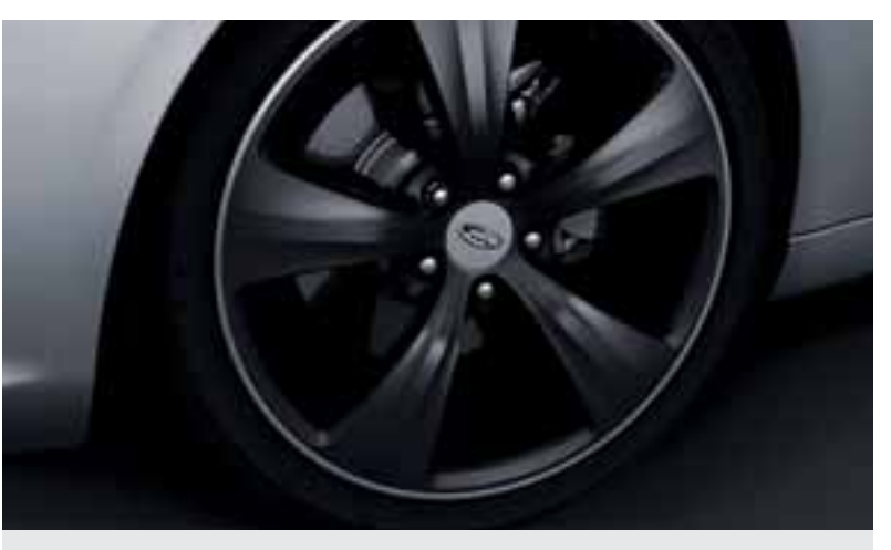
\ensuremath{\mathsf{FPV}} wheel. These distinctive FPV alloy wheels are purpose-designed to complement the Ford Falcon's dynamic lines.