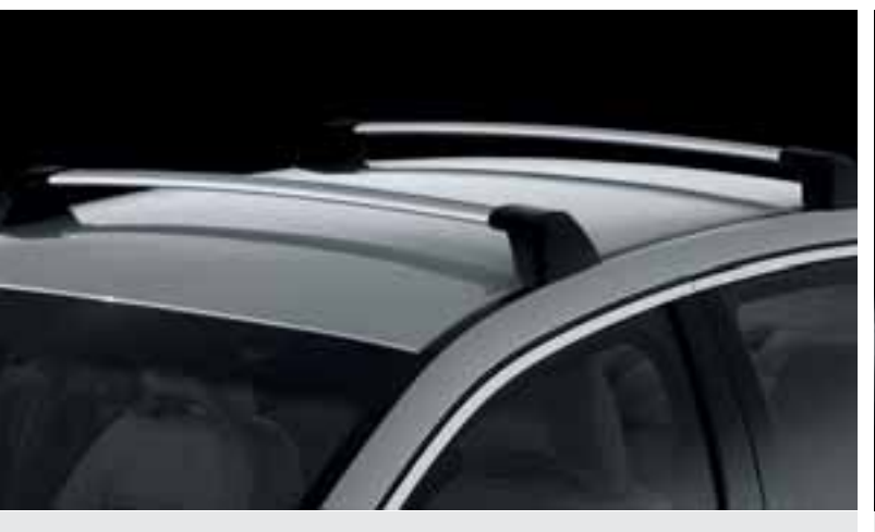
Carry Bars. Easily fitted to the Ford Falcon's roof rails, these carry bars can carry up to 75kg of cargo.