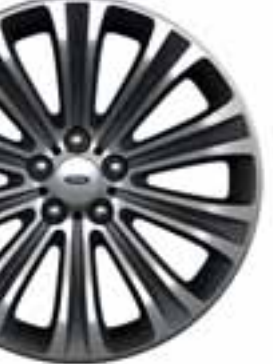
G6E Turbo 19 " x 8.0 " alloy