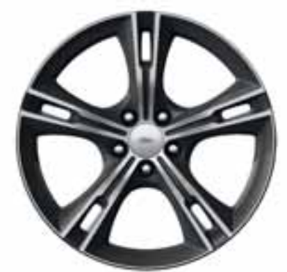
XR8 19 " x 8.0 " alloy (front) 19" x 9.0" alloy (rear)