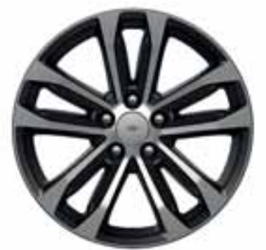
XR6 (standard) 18 " x 8.0 " alloy