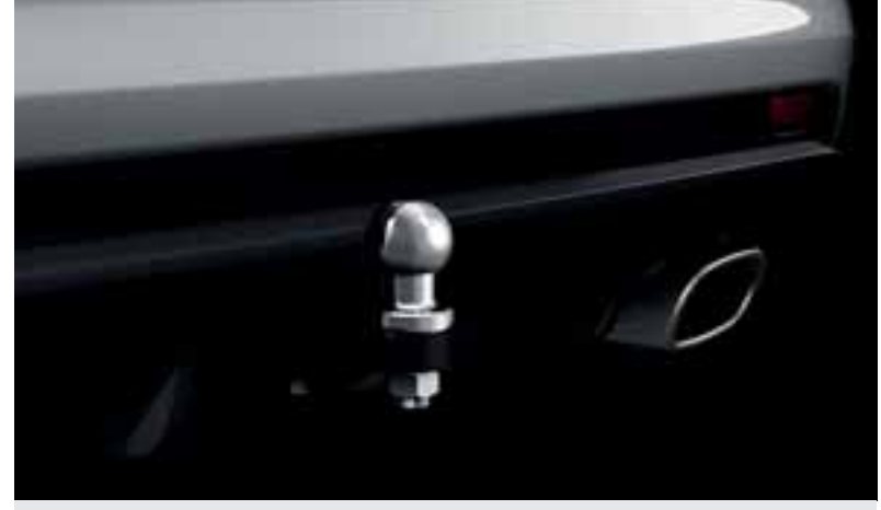
Tow bar. <sup>#~</sup> Genuine Ford towpack makes towing a breeze, whether it's for work or a weekend trip.