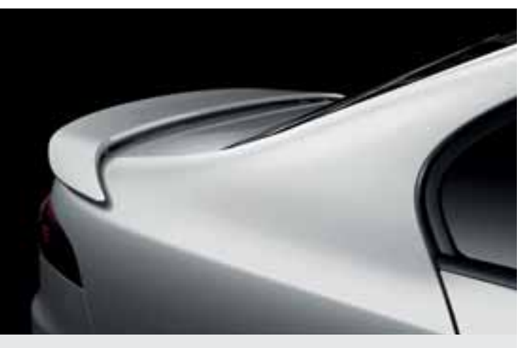
Rear Spoiler. Enhance the contours of the Ford Falcon with this tough, durable polycarbonate Spoiler.

Bonnet Protector.* Protect your bonnet from stones and other objects with this UV resistant acrylic bonnet protector.