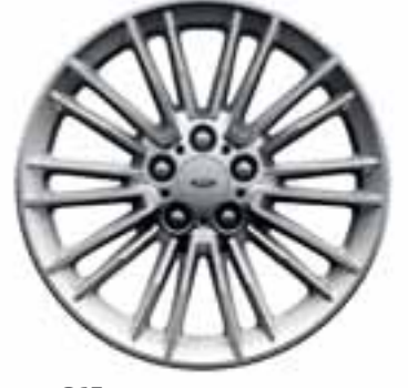
G6E 18 " x 8.0 " alloy