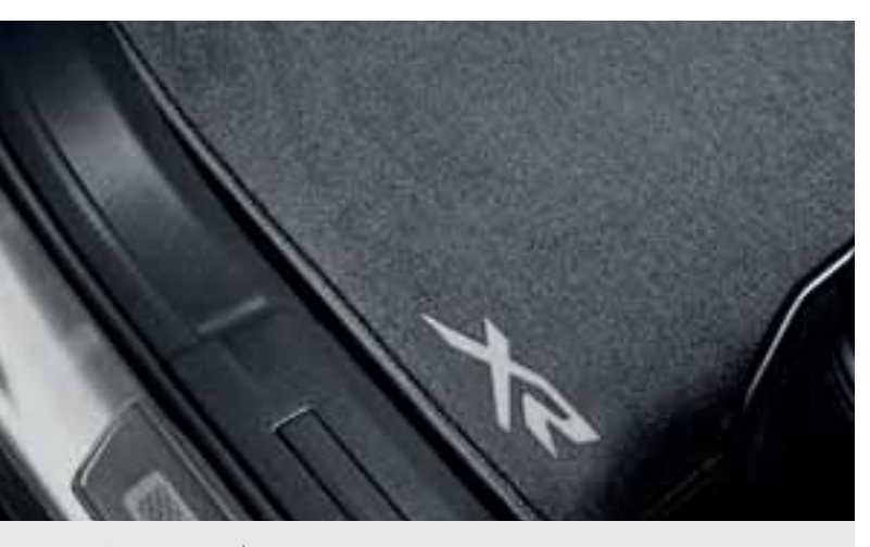
Carpet mats<sup>‡</sup> Protect your passenger seating wells from dirt, mud and outdoor muck with a set of three smartly designed mats.

Get exactly what you want from your Falcon, by picking the perfect features and accessories to tailor it to your needs and requirements.