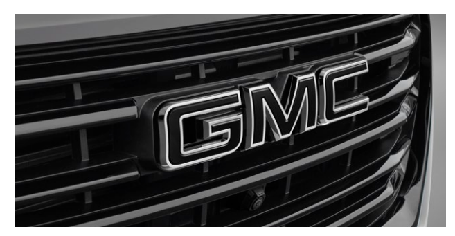
GMC EMBLEM IN BLACK