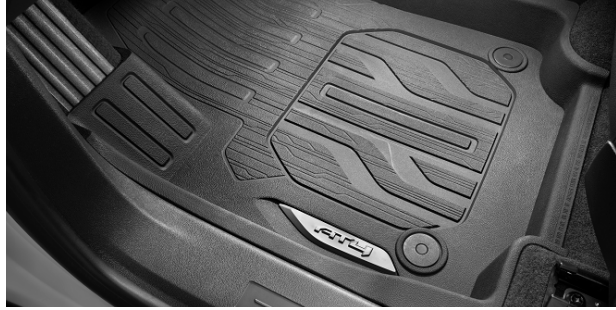
PREMIUM ALL-WEATHER FLOOR LINERS