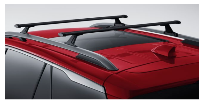
ROOF RACK CROSSRAIL PACKAGE IN BLACK