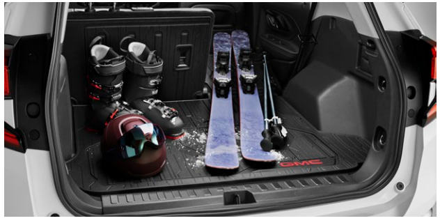
INTEGRATED CARGO LINER WITH GMC EMBLEM