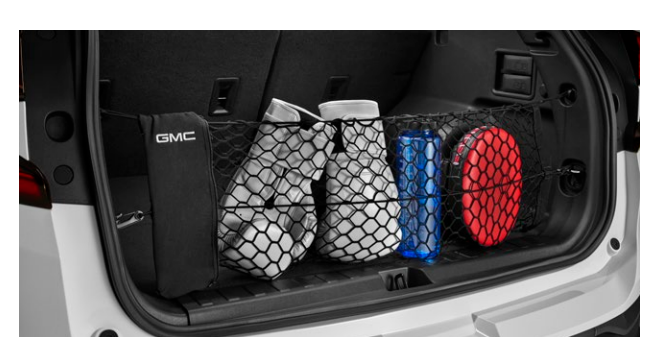
VERTICAL CARGO NET