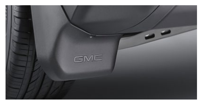
REAR SPLASH GUARD IN BLACK