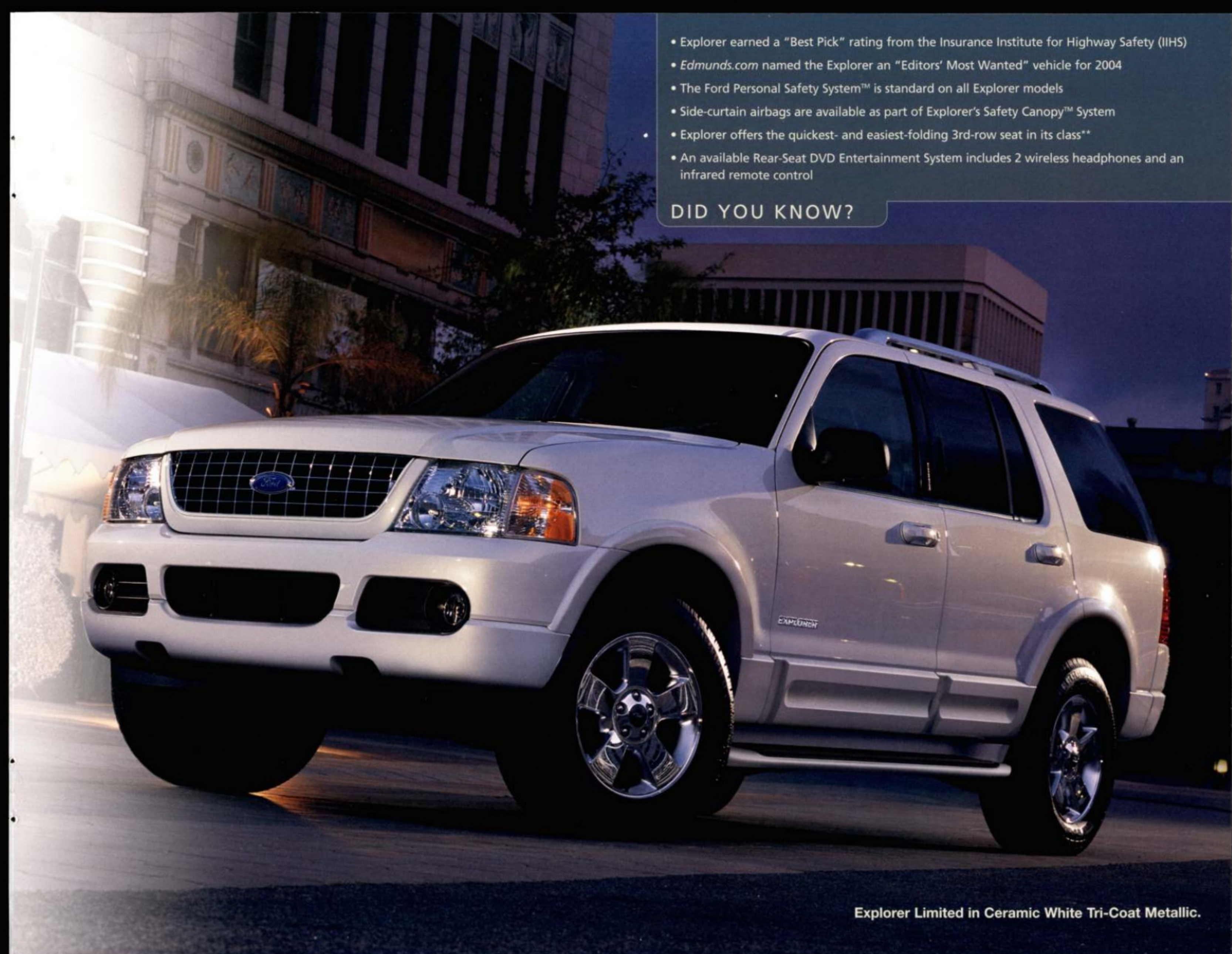
Explorer Limited in Ceramic White Tri-Coat Metallic.