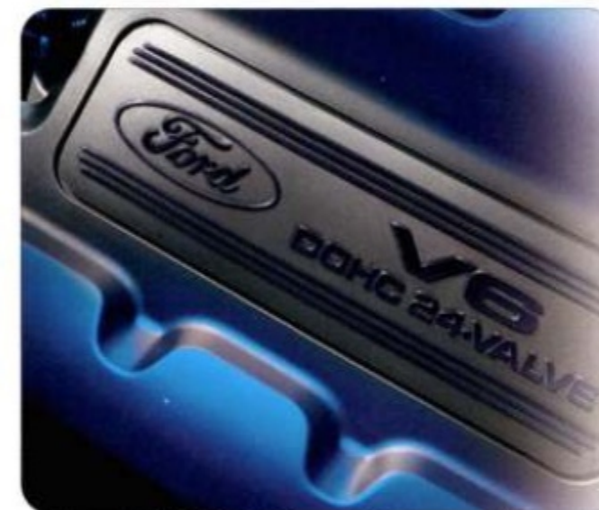
Available 201-hp 3.0L Duratec V6