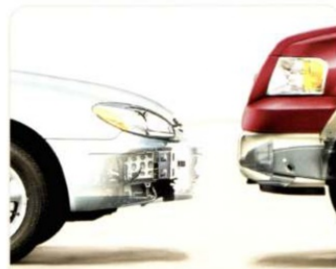
Passenger-Car Bumper Compatibility