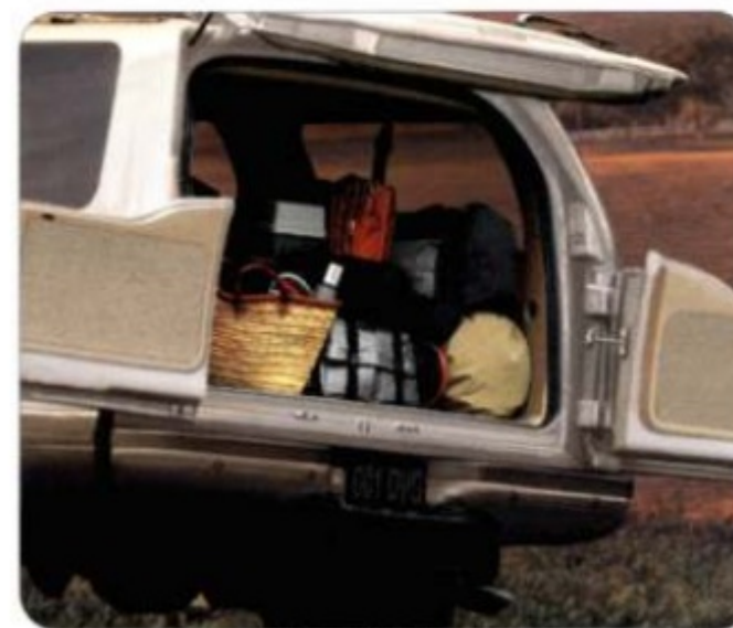
Rear Tri-Panel Door™ System