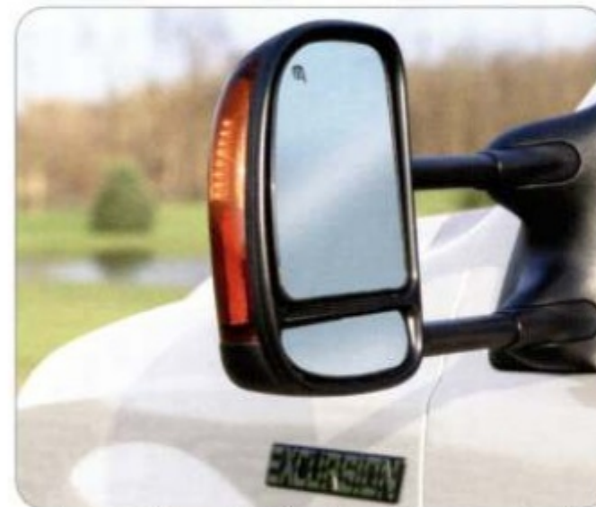
Power Trailer Tow Mirrors