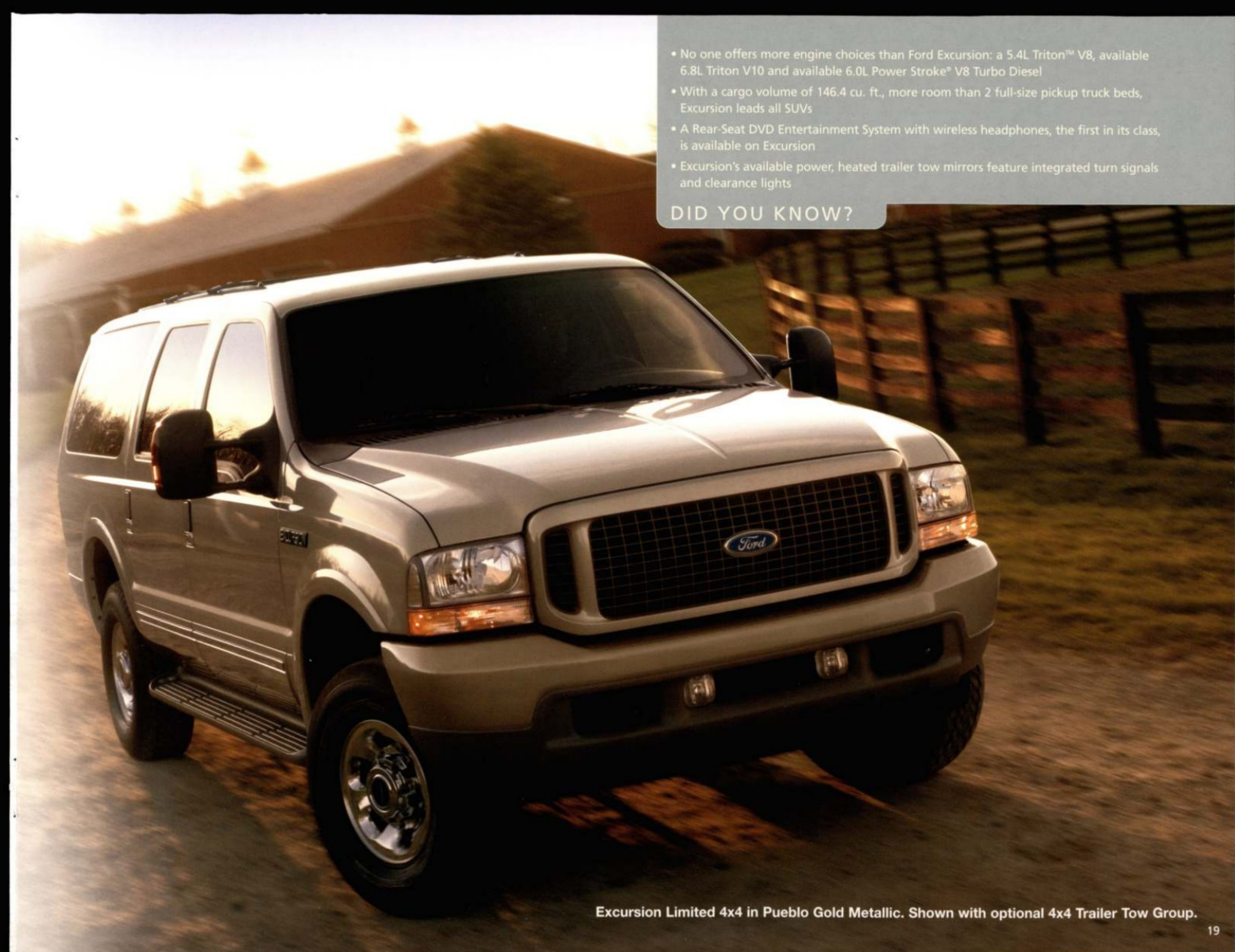
Excursion Limited 4x4 in Pueblo Gold Metallic. Shown with optional 4x4 Trailer Tow Group.