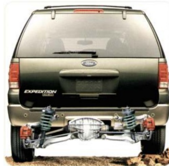
Double-Wishbone, Fully Independent Rear Suspension