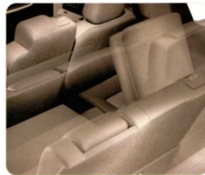
PowerFold™ 3rd-Row Seat