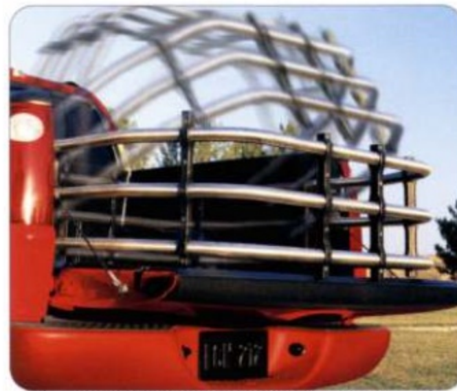
Available Cargo Cage Bed Extender