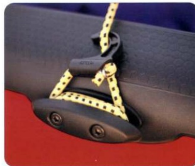
Cargo Bed Tie-Down Hooks