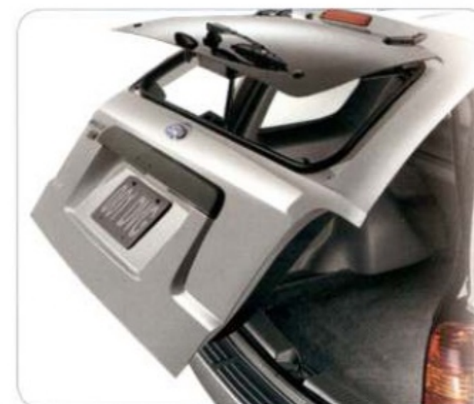
Easy-Access Liftgate with Flip-Up Glass