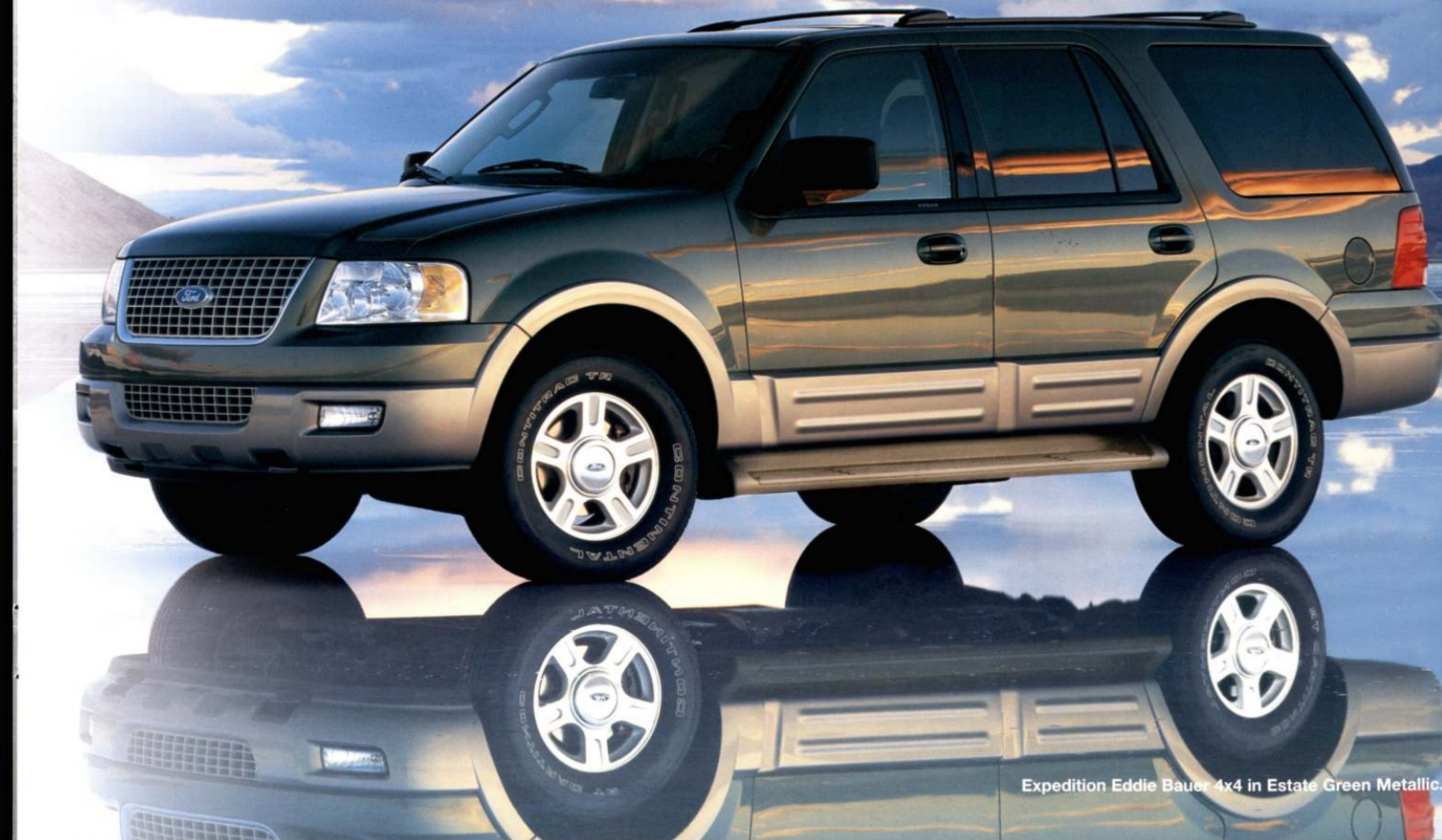
Expedition Eddie Bauer 4x4 in Estate Green Metallic.