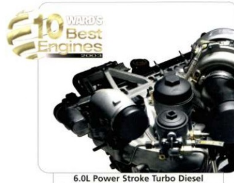
6.0L Power Stroke Turbo Diesel

*Heavy-duty wagons class. **Cargo and load capacity limited by weight and weight distribution.