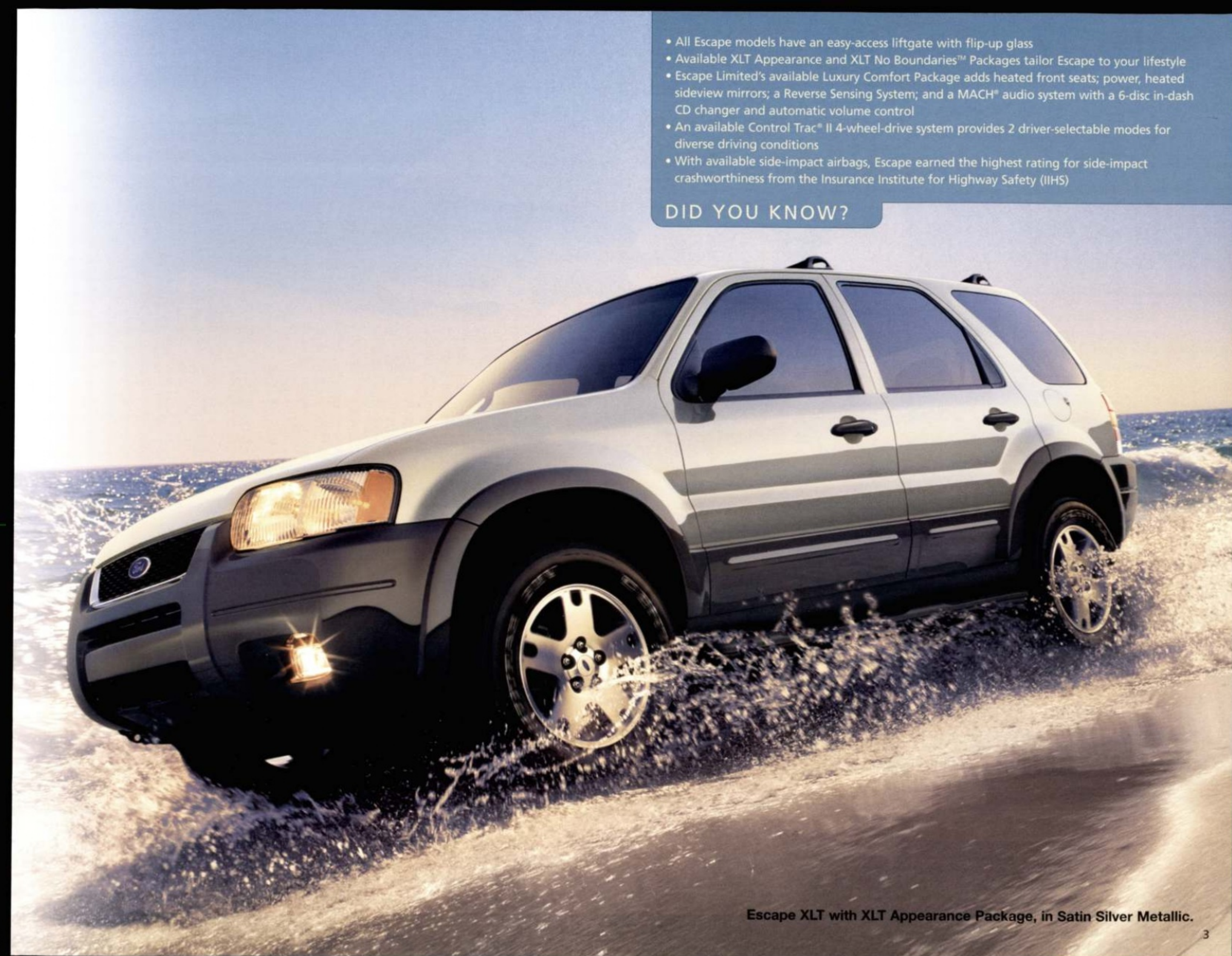
Escape XLT with XLT Appearance Package, in Satin Silver Metallic.