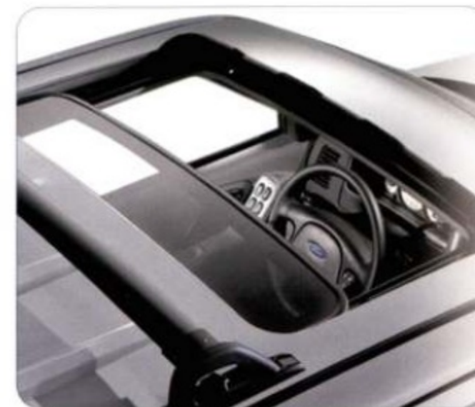
Available Power Moonroof