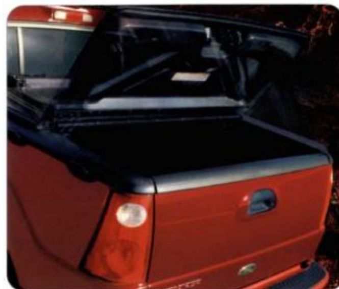
Available Folding Hard Tonneau Cover