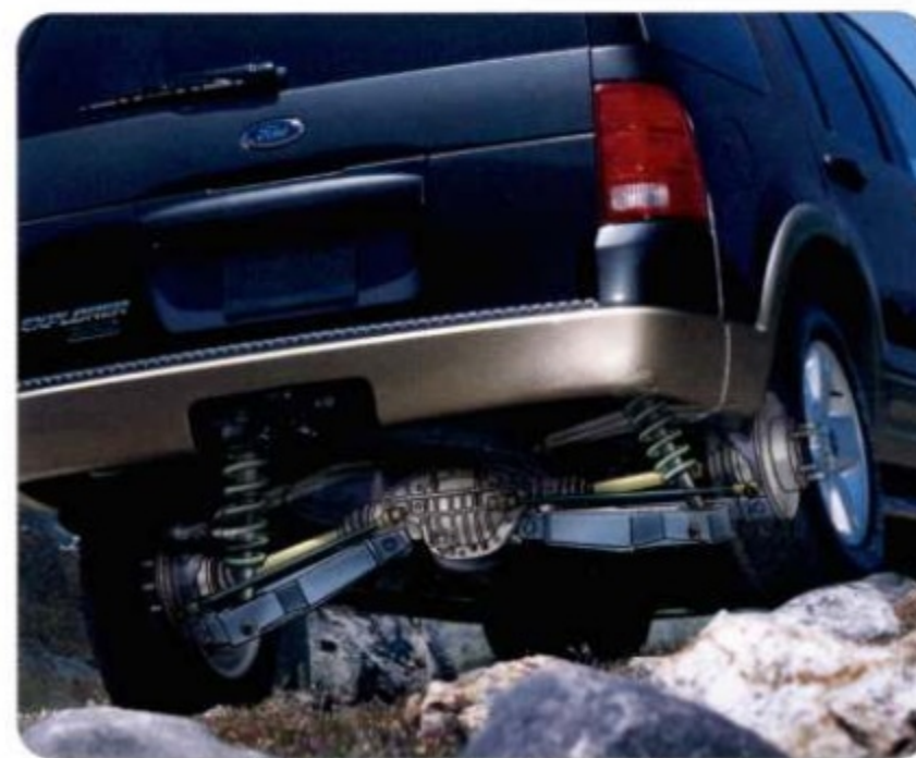
Independent Rear Suspension