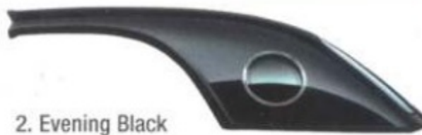
2. Evening Black