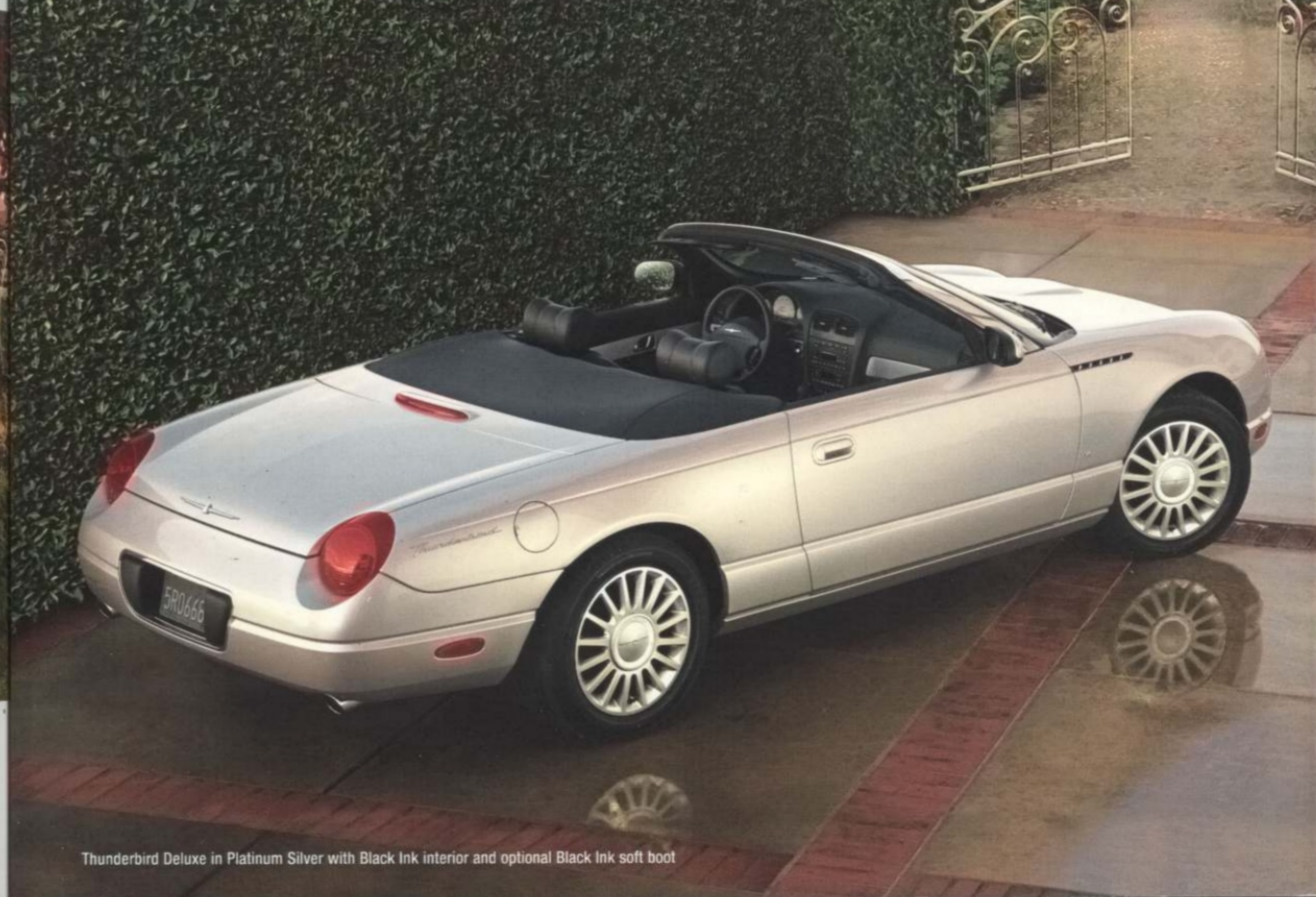
Thunderbird Deluxe in Platinum Silver with Black Ink interior and optional Black Ink soft boot

*Pre-approved credit is subject to the following conditions: All of your Ford Credit accounts, if any, must be in good standing, and your income must be sufficient to cover normal living expenses and your vehicle payment at the time of transaction. For new vehicles, the pre-approved amount applies to the manufacturer's suggested retail price (MSRP). If you have any questions regarding your pre-approval credit offer, just call Program Headquarters at 1-800-235-5346. Please note that information contained in your credit record was used to generate your name for this offer. The offer of credit was extended because you met the credit criteria established by Ford Motor Credit Company. The credit offer may be withdrawn if it is found that you no longer meet the established credit criteria. You have the right to notify any credit bureau that you do not wish to have information from your credit report used in future offerings involving pre-approved credit. Experian Target Marketing Services, P.O. Box 919, Allen, TX 75013, 1-888-567-8688; TransUnion - Name Removal Opt-Out Request, P.O. Box 7245, Fullerton, CA 92367, 1-888-567-8688; Equifax Option, P.O. Box 740123, Atlanta, GA 30374-0123, 1-888-567-8688.