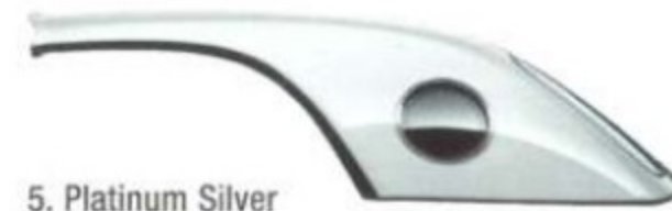
5. Platinum Silver