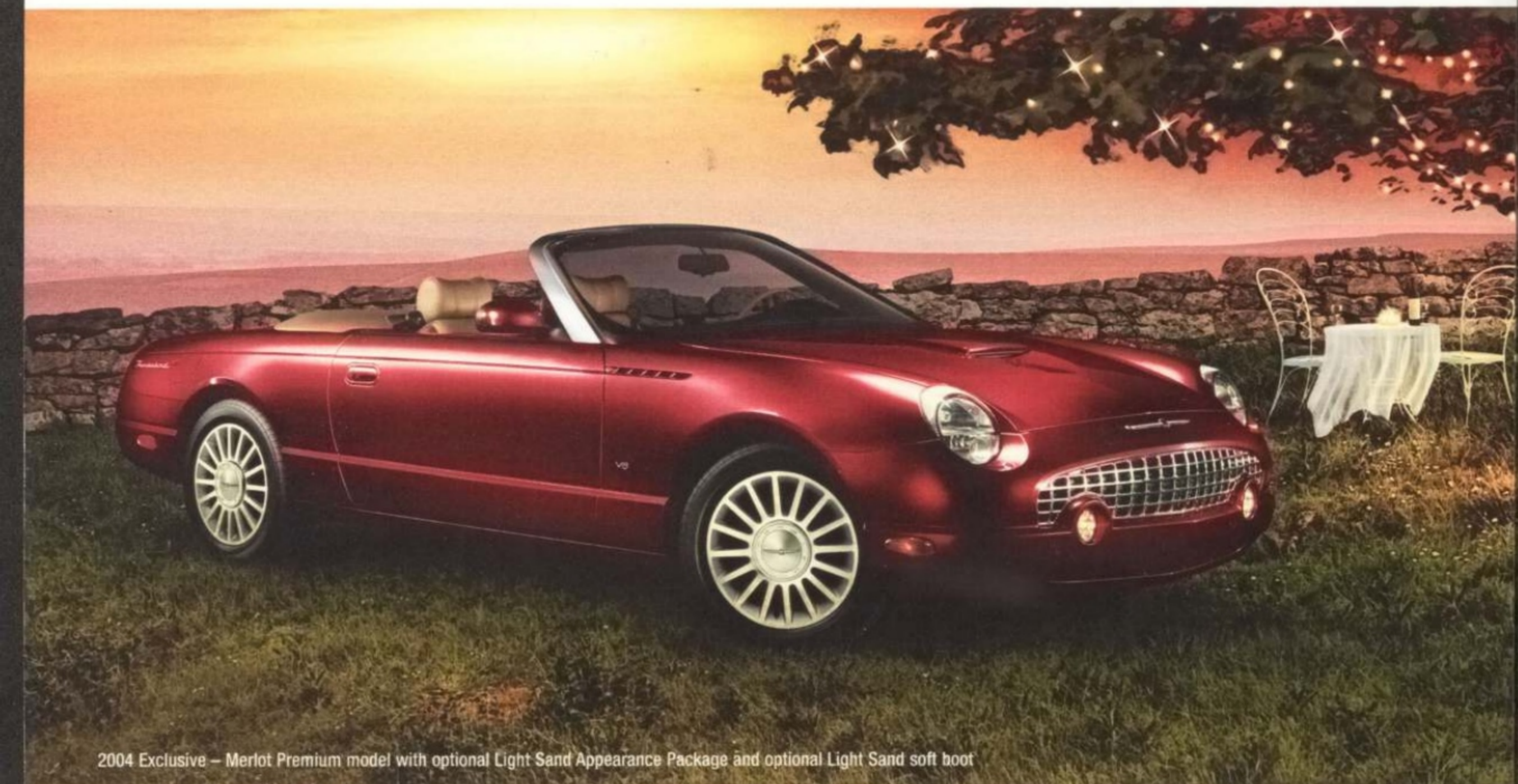
2004 Exclusive – Merlot Premium model with optional Light Sand Appearance Package and optional Light Sand soft boot

Thunderbird is about style. And the design cues that make it stand out. Like the crease you'll find in its decklid. A subtle touch and yet, it wouldn't be a Thunderbird without it. Or the porthole window in the removable top. There isn't another car with a window like it. And then, there are the lights. There's no mistaking the front and rear lights of a Thunderbird as it passes by. But the experience isn't just about style, it's also about showing that style off. So, get on the road quickly with a V8 engine that transfers its power directly to the pavement through rear-wheel drive. And have fun while you're there with the available SelectShift Automatic® transmission that provides the control of a manual without the trouble of a clutch. Because no matter where you go or how long you stay, you'll get noticed in a Thunderbird.