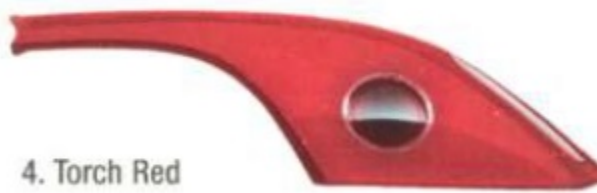
4. Torch Red