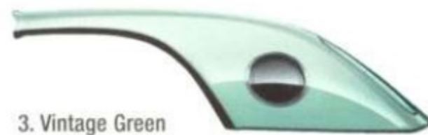
3. Vintage Green

First, pick which of the five Thunderbird exterior colors you like best. Then pair it with an optional removable top to complete the look. You'll find every possible coordinating exterior color and removable top here.