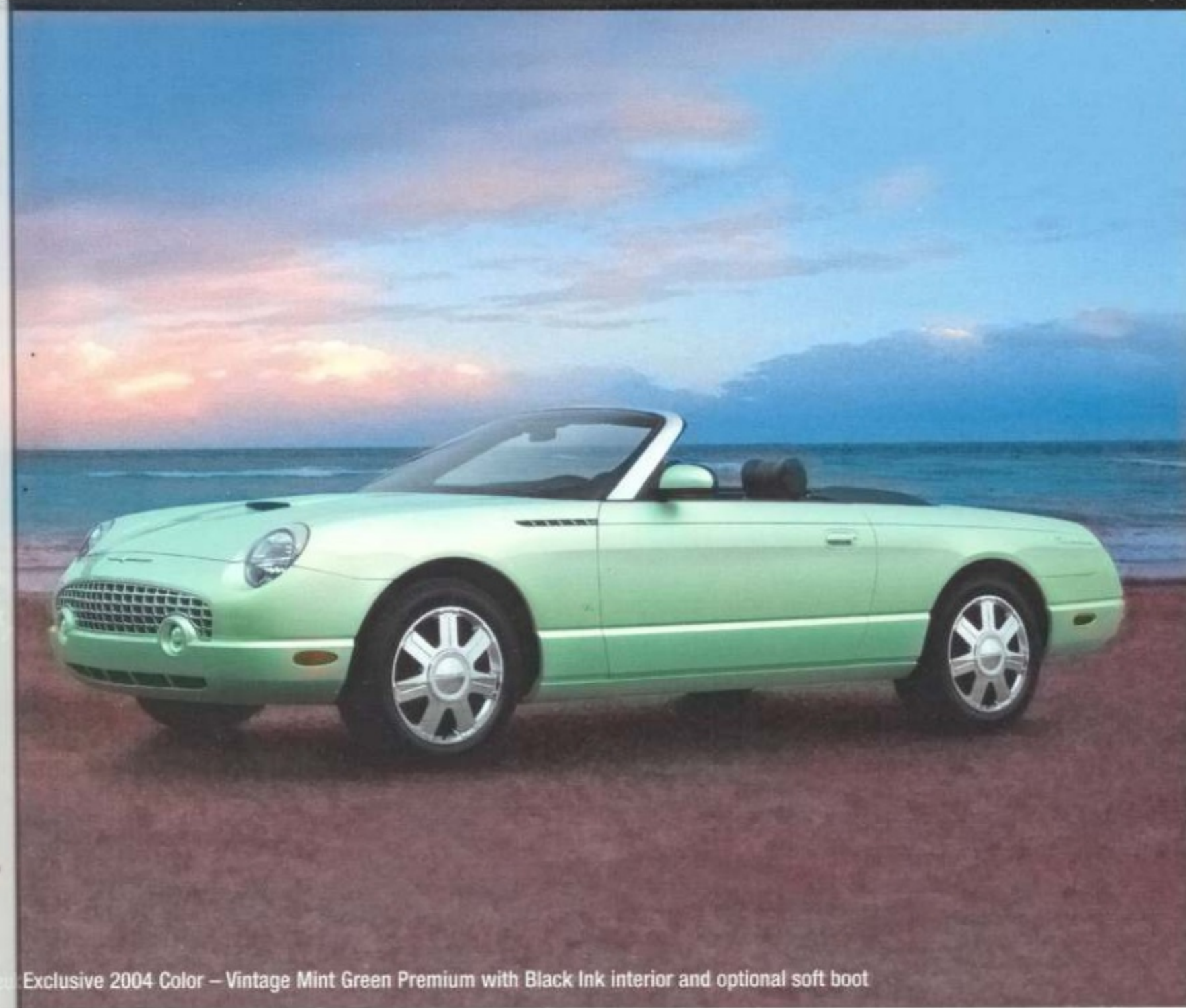
Exclusive 2004 Color - Vintage Mint Green Premium with Black Ink interior and optional soft boot

1 Coordinates with Merlot. 2 Coordinates with Evening Black, Torch Red, Vintage Mint Green, Platinum Silver or Merlot. 3 Coordinates with Vintage Mint Green. 4 Coordinates with Torch Red. 5 Coordinates with Evening Black, Torch Red, Vintage Mint Green or Platinum Silver. 6 Coordinates with Evening Black, Torch Red and Vintage Mint Green.