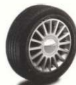
17" 16-Spoke Painted Aluminum Wheel Standard on Deluxe

Audiophile is a trademark of Audiophile, Inc.