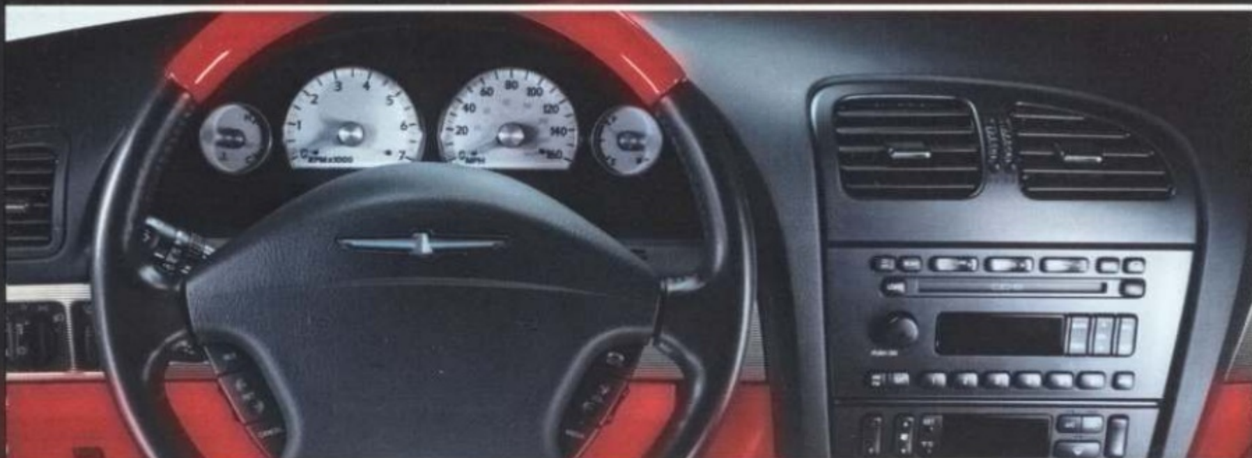
2004 Exclusive – Optional Light Sand Appearance Package and optional Light Sand soft boot

1 There are six interior color choices when it comes to Thunderbird – all in premium leather trim. The Partial Color Accent Package in Performance White is shown here. 2 Need to get somewhere fast? The standard 32-valve 3.9L V8 engine delivers the power of 280 horses and 286 lbs.-ft. of torque. 3 This AM/FM Audiophile™ Sound System has a 6-disc in-dash CD player Audiophile is a trademark of Audiophile, Inc.