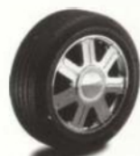
17" 7-Spoke Chrome Aluminum Wheel Standard on Premium