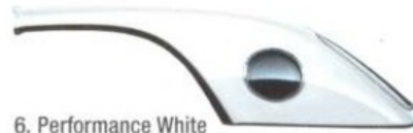
6. Performance White

1 Coordinates with Merlot. 2 Coordinates with Evening Black, Torch Red, Vintage Mint Green, Platinum Silver or Merlot. 3 Coordinates with Vintage Mint Green. 4 Coordinates with Torch Red. 5 Coordinates with Evening Black, Torch Red, Vintage Mint Green or Platinum Silver. 6 Coordinates with Evening Black, Torch Red and Vintage Mint Green.