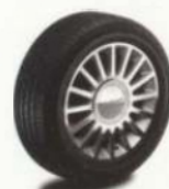
17" 16-Spoke Micro-Machined Aluminum Wheel Optional on Premium