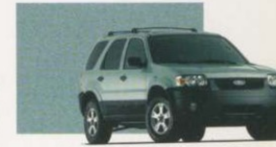
Titanium Green Clearcoat Metallic (XLS and XLT)