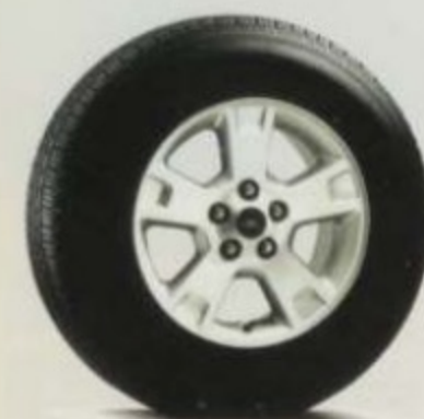
16" painted aluminum (XLT No Boundaries™ Package)