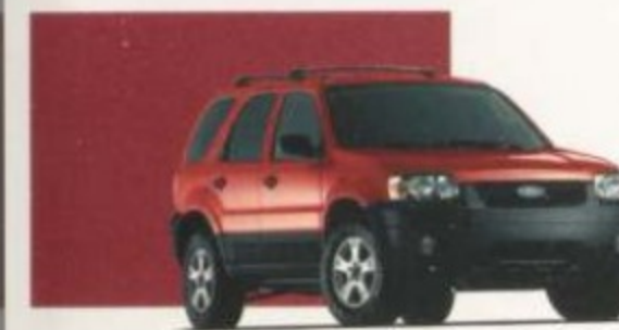
Red Fire Clearcoat Metallic (All series)