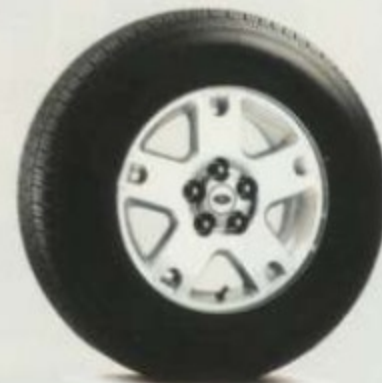
16" cast aluminum (XLT)