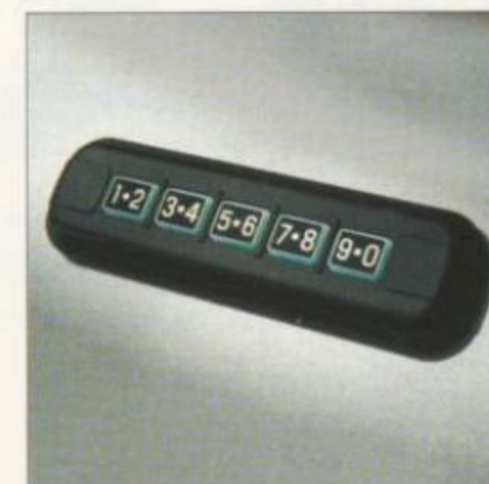
NEW Keyless Entry Pad