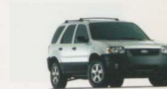
Oxford White Clearcoat (XLS and XLT)