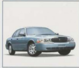
2004 Grand Marquis