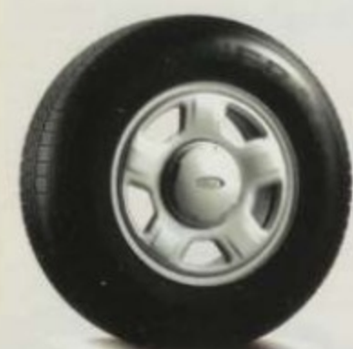
15" styled steel (XLS w/manual transmission)