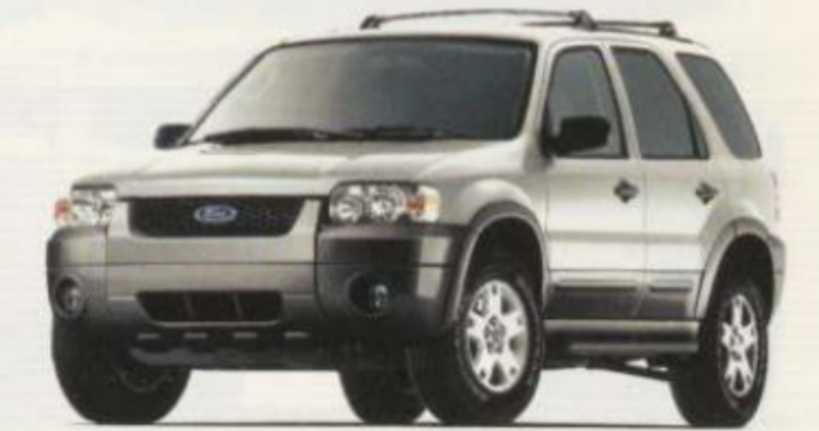
2005 Ford Escape