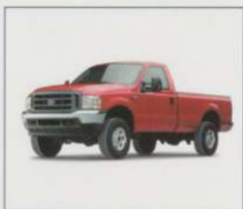
2004 F-Series Super Duty