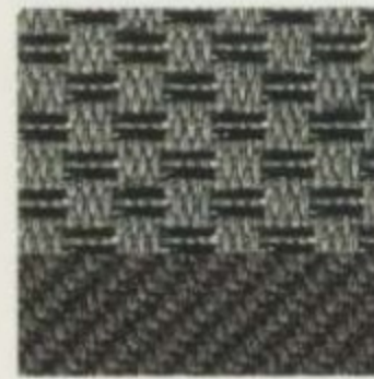
Medium/Dark Flint Premium Cloth (XLT)