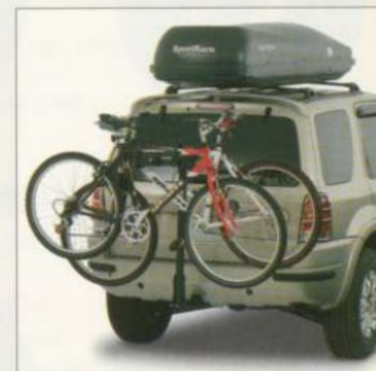
SportRack Cargo Box and QuarterRoc® Bike Carrier