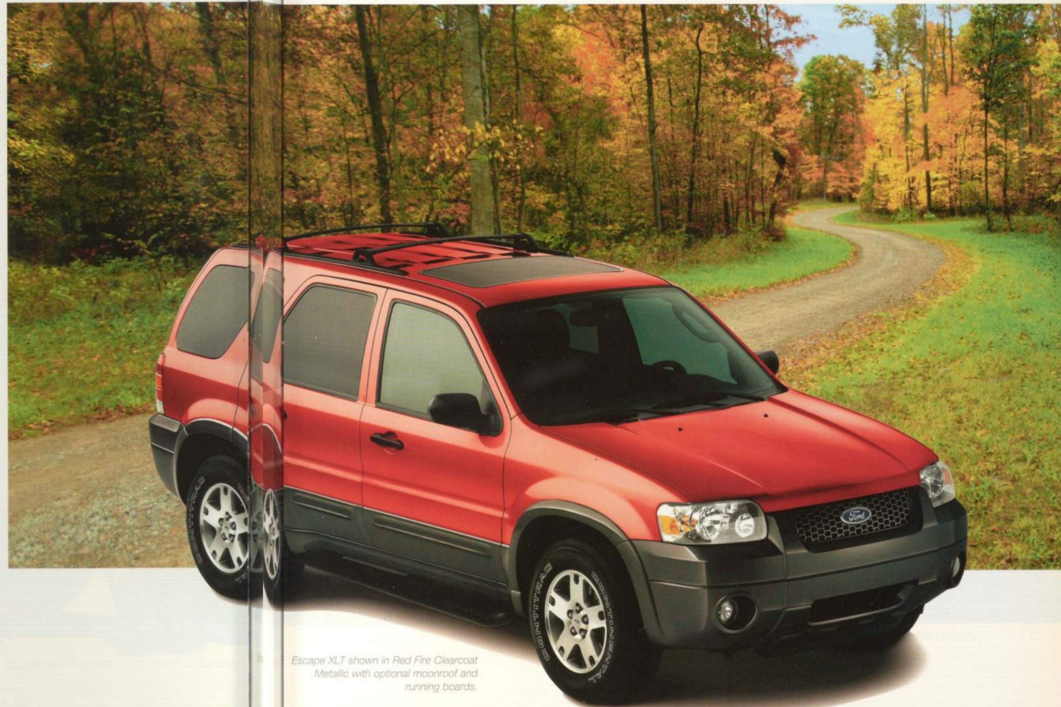
Escape XLT shown in Red Fire Clearcoat Metallic with optional moonroof and running boards.