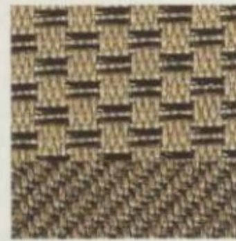
Medium/Dark Pebble Premium Cloth (XLT)