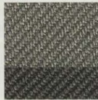
Medium/Dark Flint Cloth (XLS)