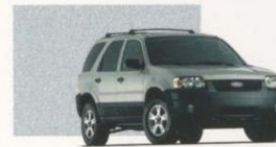
Silver Clearcoat Metallic (All series)