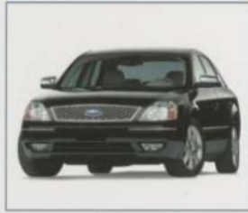
2005 Five Hundred