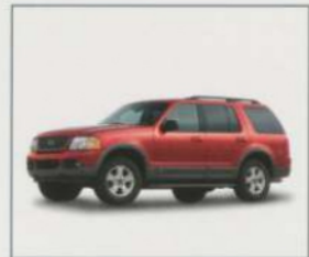
2004 Explorer 4-Door