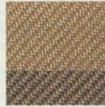
Medium/Dark Pebble Cloth (XLS)