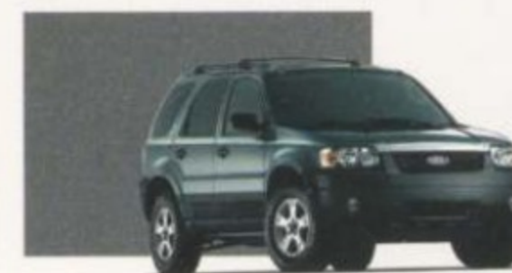
Dark Shadow Grey Clearcoat Metallic (All series)