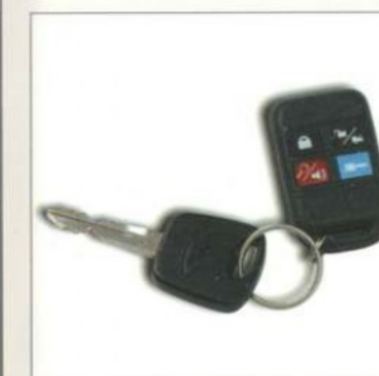
Remote Start System