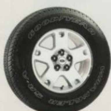
16" bright machined aluminum (Limited and XLT Sport Package)