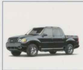
2004 Explorer Sport Trac