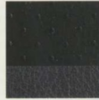
Ebony Black Premium Leather (Limited)