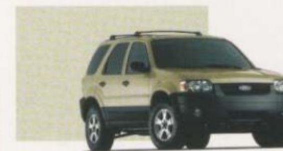
Gold Ash Clearcoat Metallic (All series)