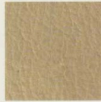
Medium/Dark Pebble Leather (Optional on XLT)