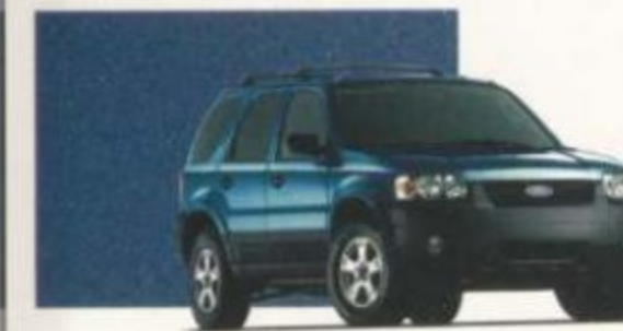
Norsesea Blue Clearcoat Metallic (XLS and XLT) (Late availability)