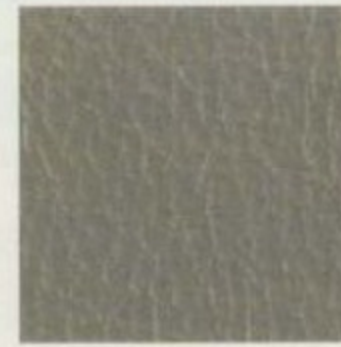
Medium/Dark Flint Leather (Optional on XLT)