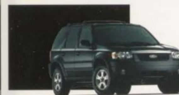
Black Clearcoat (All series)