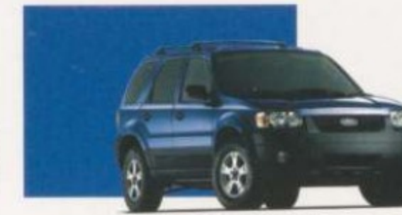
Sonic Blue Clearcoat Metallic (XLS and XLT)