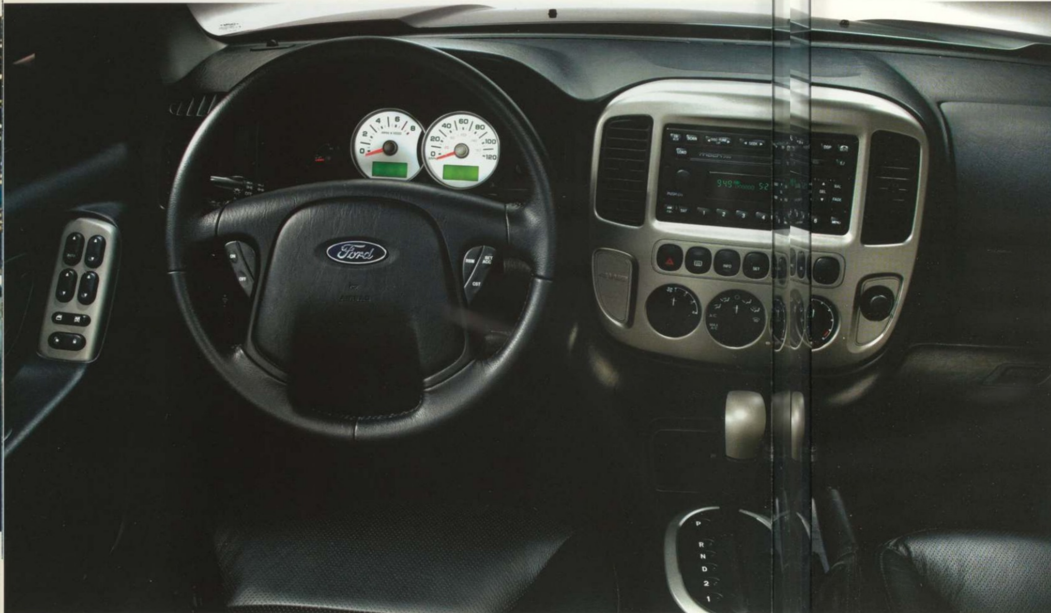
Escape Limited interior shown in Ebony Black Premium Leather. U.S. model shown.