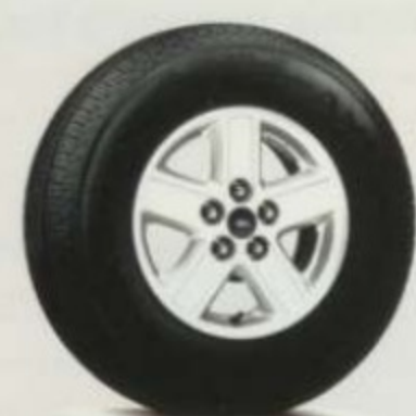
15" cast aluminum (XLS w/automatic transmission; optional on XLS w/manual transmission)