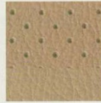
Medium/Dark Pebble Premium Leather (Limited)