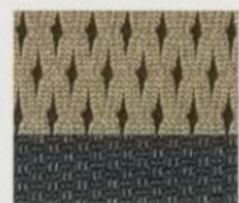
Medium/Dark Pebble Unique Premium Cloth