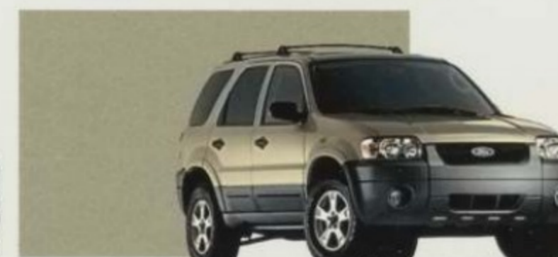
Gold Ash Metallic