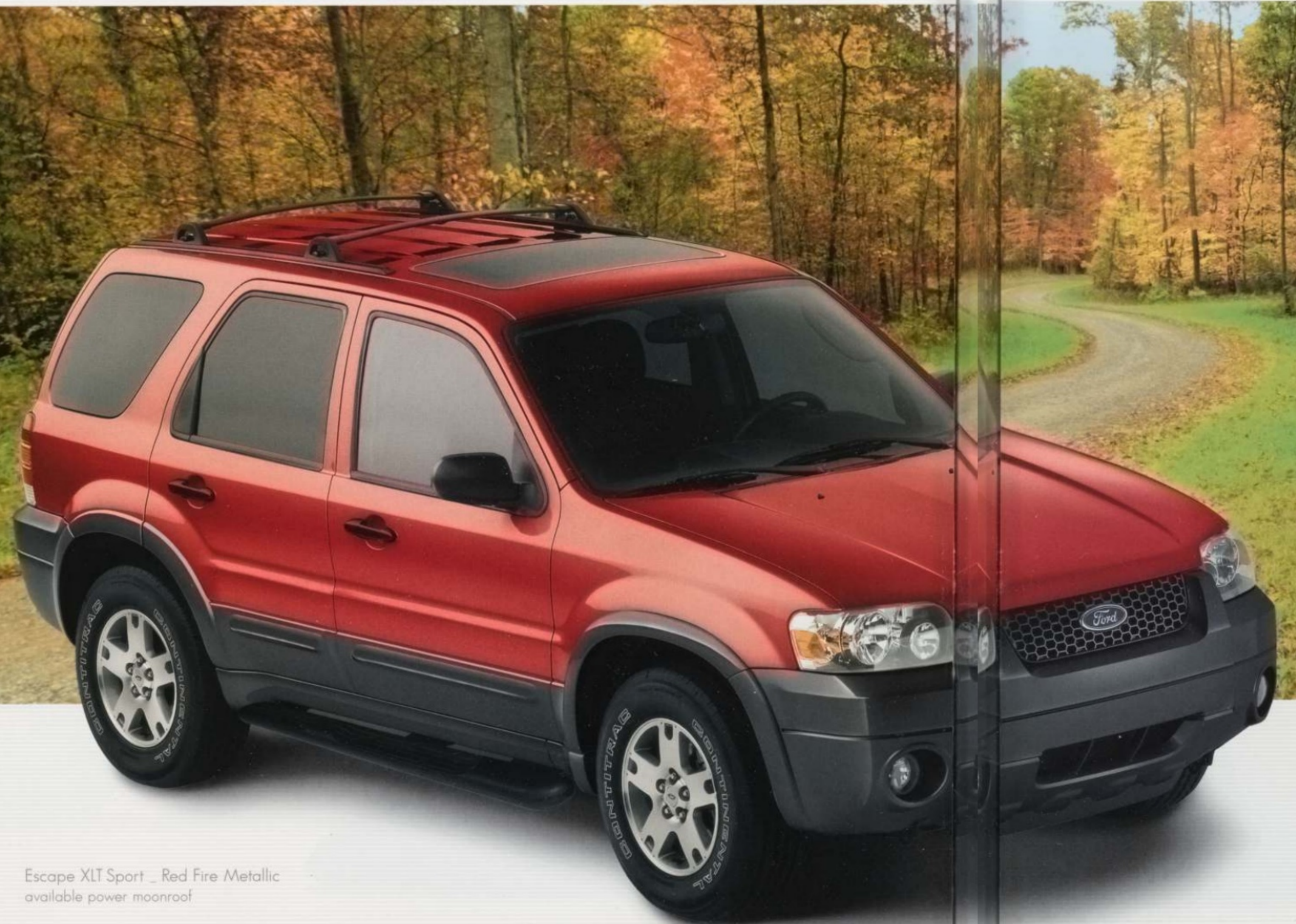
Escape XLT Sport – Red Fire Metallic available power moonroof

4-Wheel Anti-Lock Braking System – Now standard on all Escape models, ABS with Quick Brake Assist can recognize hard braking and help deliver maximum braking power to achieve a shorter stopping distance.