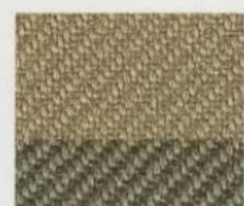
Medium/Dark Pebble Cloth