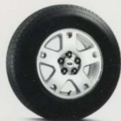
16" Bright Machined-Aluminum Wheel Standard on Limited