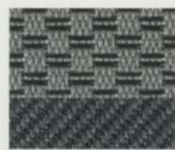
Medium/Dark Flint Premium Cloth