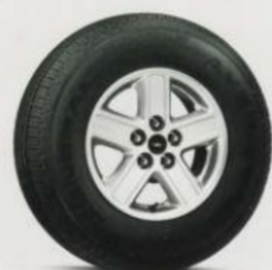
15" Aluminum Wheel Optional on XLS Manual and XLS