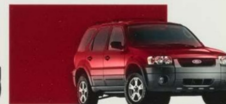
Red Fire Metallic