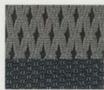
Medium/Dark Flint Unique Premium Cloth