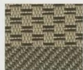
Medium/Dark Pebble Premium Cloth

Optional on XLT/XLT No Boundaries Package/XLT Sport