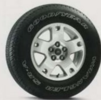
16" Painted Aluminum Wheel Included in XLT No Boundaries Package