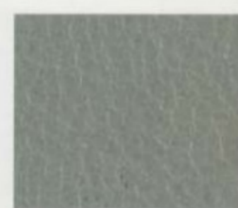
Medium/Dark Flint Leather

Optional on XLT/XLT No Boundaries Package/XLT Sport