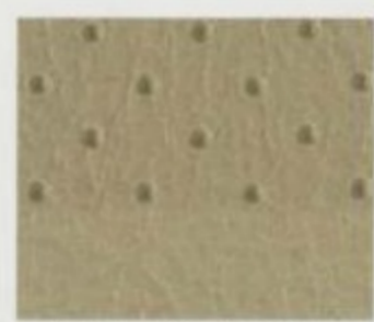
Medium/Dark Pebble Premium Leather