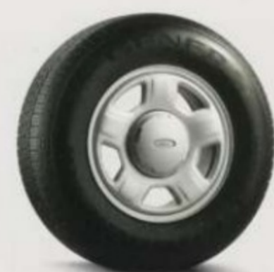
15" Styled-Steel Wheel Standard on XLS Manual and XLS