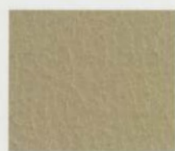
Medium/Dark Pebble Leather