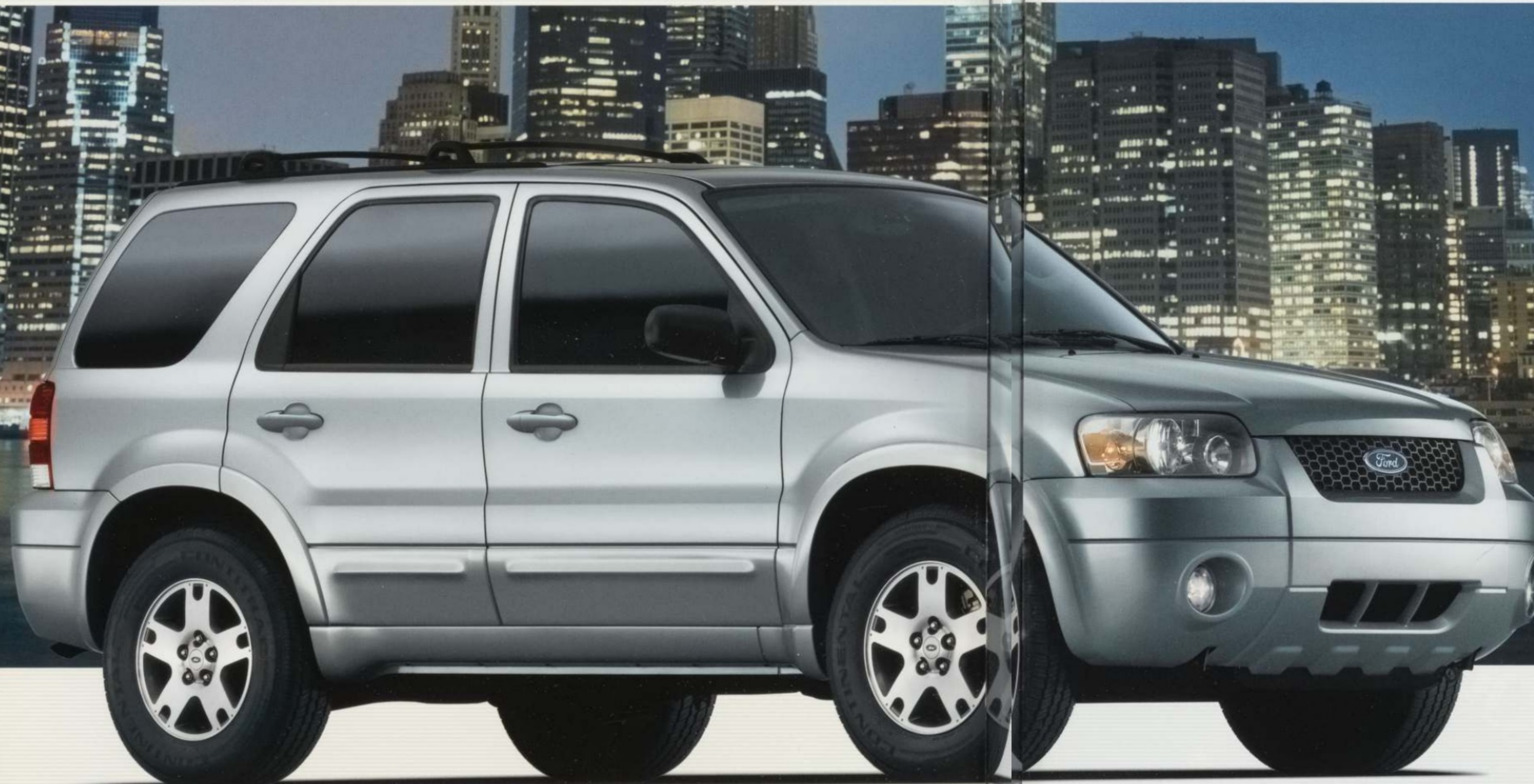
Escape Limited _ Silver Metallic available power moonroof

Customized Dealer Accessories Standard and Available Equipment New Colors and Fabrics