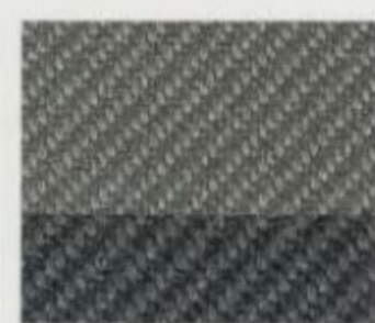
Medium/Dark Flint Cloth