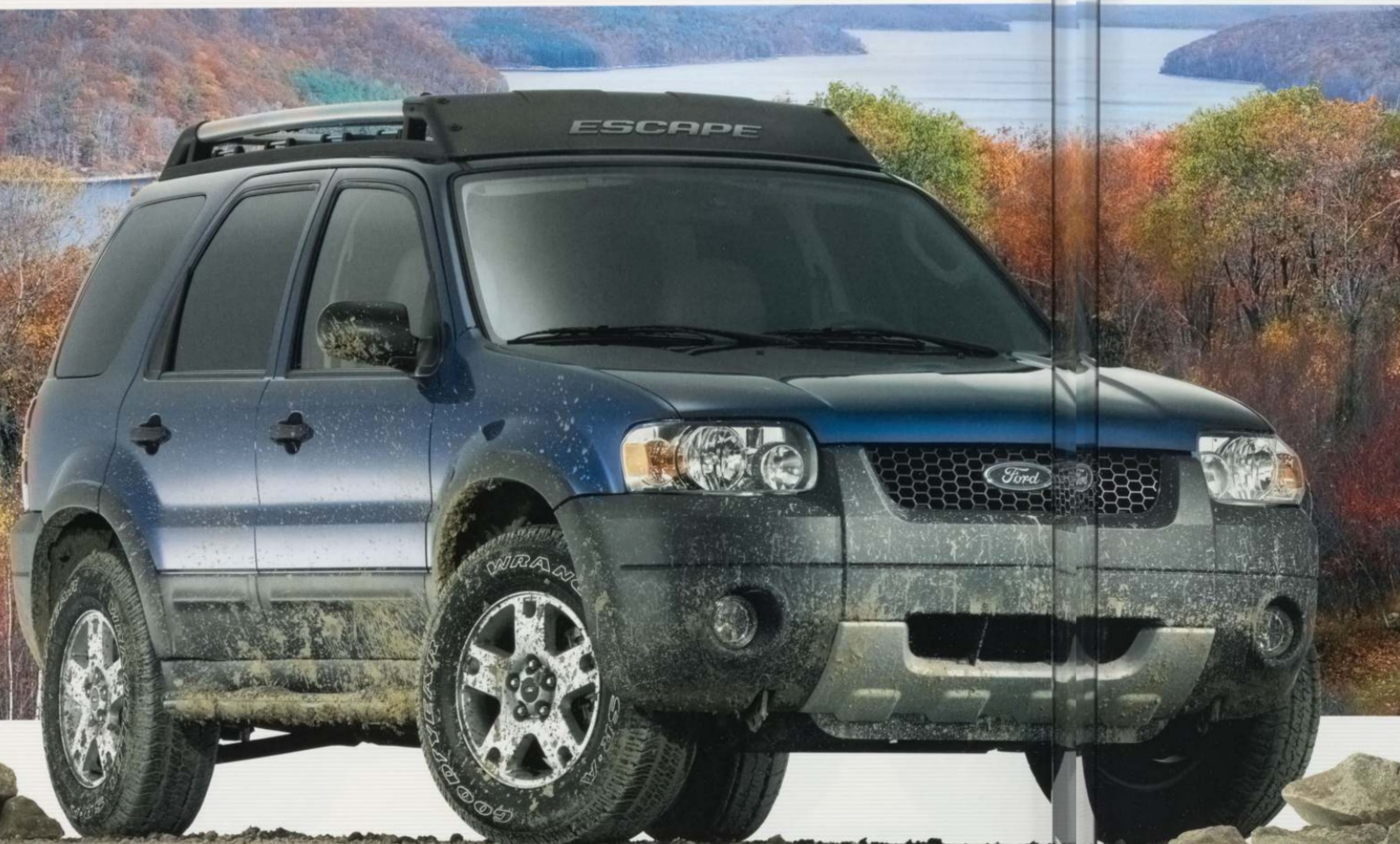
Escape XLT with XLT No Boundaries™ Package _ Sonic Blue Metallic