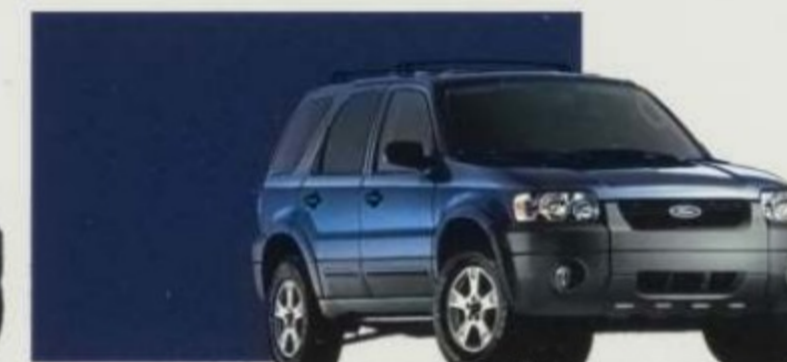
Sonic Blue Metallic

Escape XLT 4WD shown. Ford uses clearcoat paint for beauty and protection. Colors shown are representative only. Not all colors are available on all models. See your dealer for actual paint/trim options.