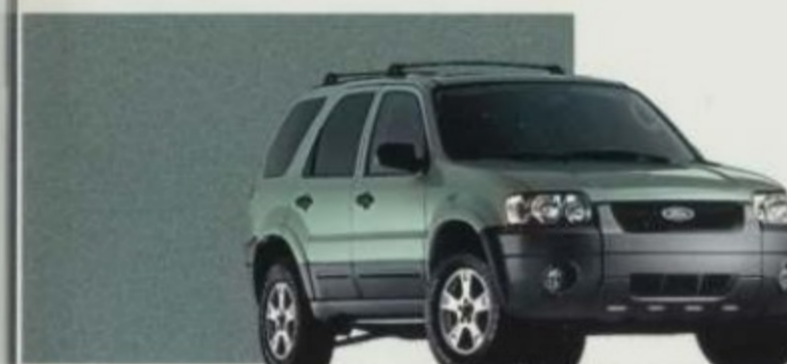
Titanium Green Metallic