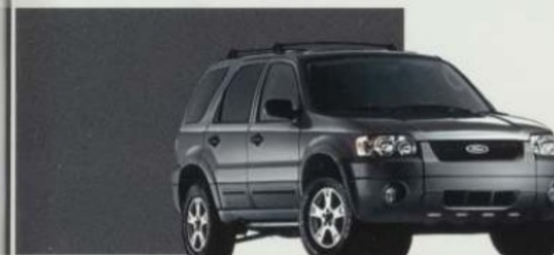
Dark Shadow Grey Metallic