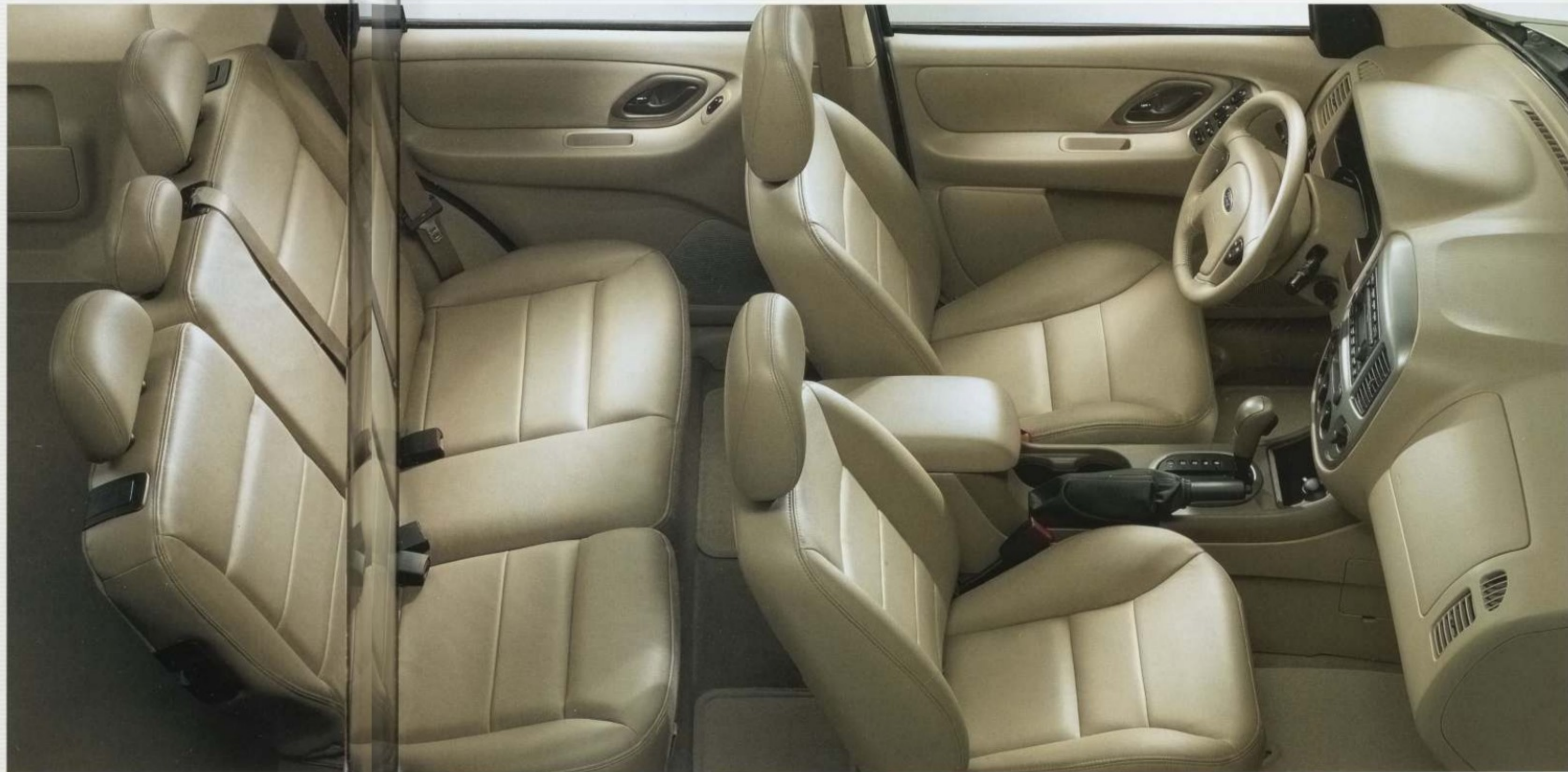
Escape XLT – Medium/Dark Pebble Interior available leather-trimmed seats