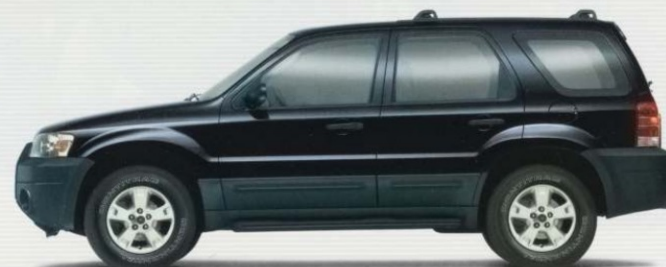
Escape XLT 4WD – Black available side step bars