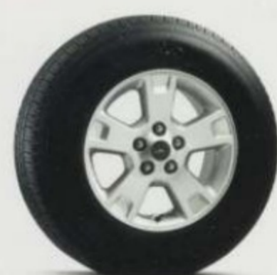
16" Aluminum Wheel Standard on XLT