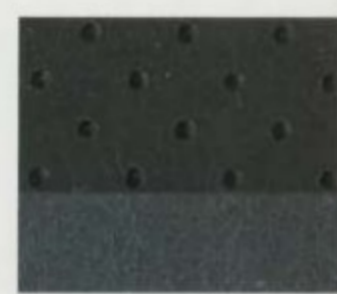
Ebony Black Premium Leather