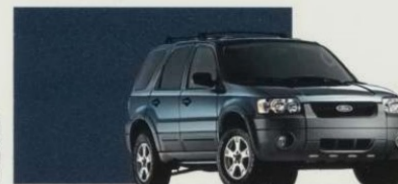
Norsea Blue Metallic