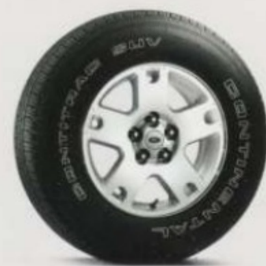
16" Bright Machined-Aluminum Wheel Standard on XLT Sport