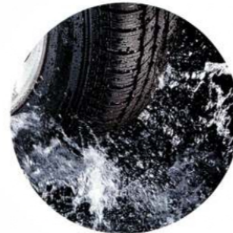
ANTI-LOCK BRAKE SYSTEM

The standard 4-wheel disc Anti-lock Brake System (ABS) helps prevent wheel lockup during hard or emergency braking. The result: greater steering control. All-Speed Traction Control uses the ABS computer to sense wheel slippage and improve traction at all vehicle speeds on slippery or loose surfaces. It is standard on GS Convenience and the LS Series.