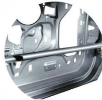
SIDE-IMPACT DOOR BEAMS

Along with integrated front and rear crumple zones that help absorb collision impact, high-strength steel side-impact door beams enhance occupant safety in certain side-impact collisions by helping to preserve the integrity of the Grand Marquis passenger compartment.