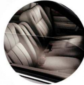
LAMINATED SIDE WINDOWS

Laminated side-window glass is more intrusion-resistant than traditional glass. Thanks to a special coating that blocks harmful UV rays, it also keeps the interior cooler and helps prevent the premature aging of materials. Available on the LS series.