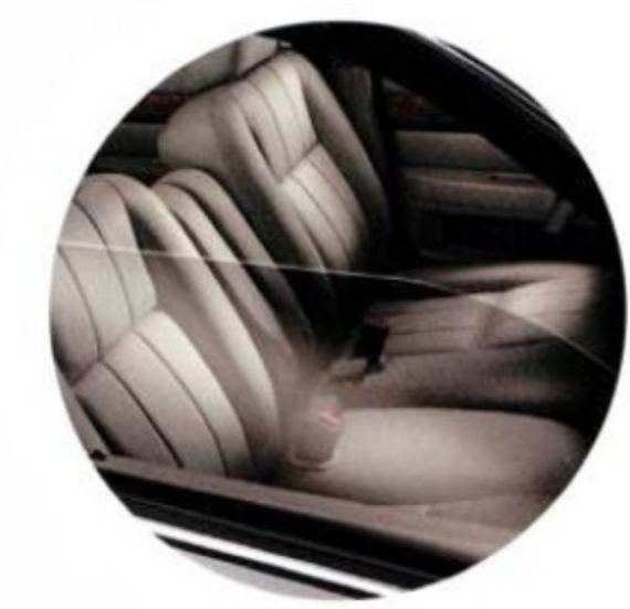
LAMINATED SIDE WINDOWS

Laminated side-window glass is more intrusion-resistant than traditional glass. Thanks to a special coating that blocks harmful UV rays, it also keeps the interior cooler and helps prevent the premature aging of materials. Available on the LS series.