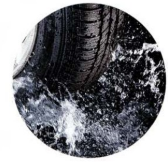
ANTI-LOCK BRAKE SYSTEM

The standard 4-wheel disc Anti-lock Brake System (ABS) helps prevent wheel lockup during hard or emergency braking. The result: greater steering control. All-Speed Traction Control uses the ABS computer to sense wheel slippage and improve traction at all vehicle speeds on slippery or loose surfaces. It is standard on GS Convenience and the LS Series.