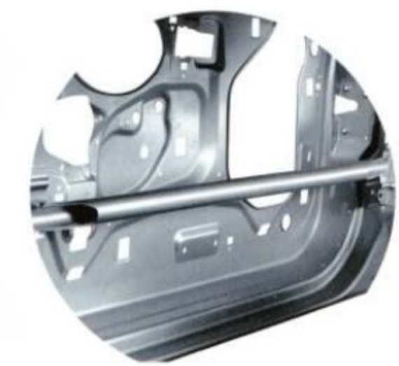
SIDE-IMPACT DOOR BEAMS

Along with integrated front and rear crumple zones that help absorb collision impact, high-strength steel side-impact door beams enhance occupant safety in certain side-impact collisions by helping to preserve the integrity of the Grand Marquis passenger compartment.