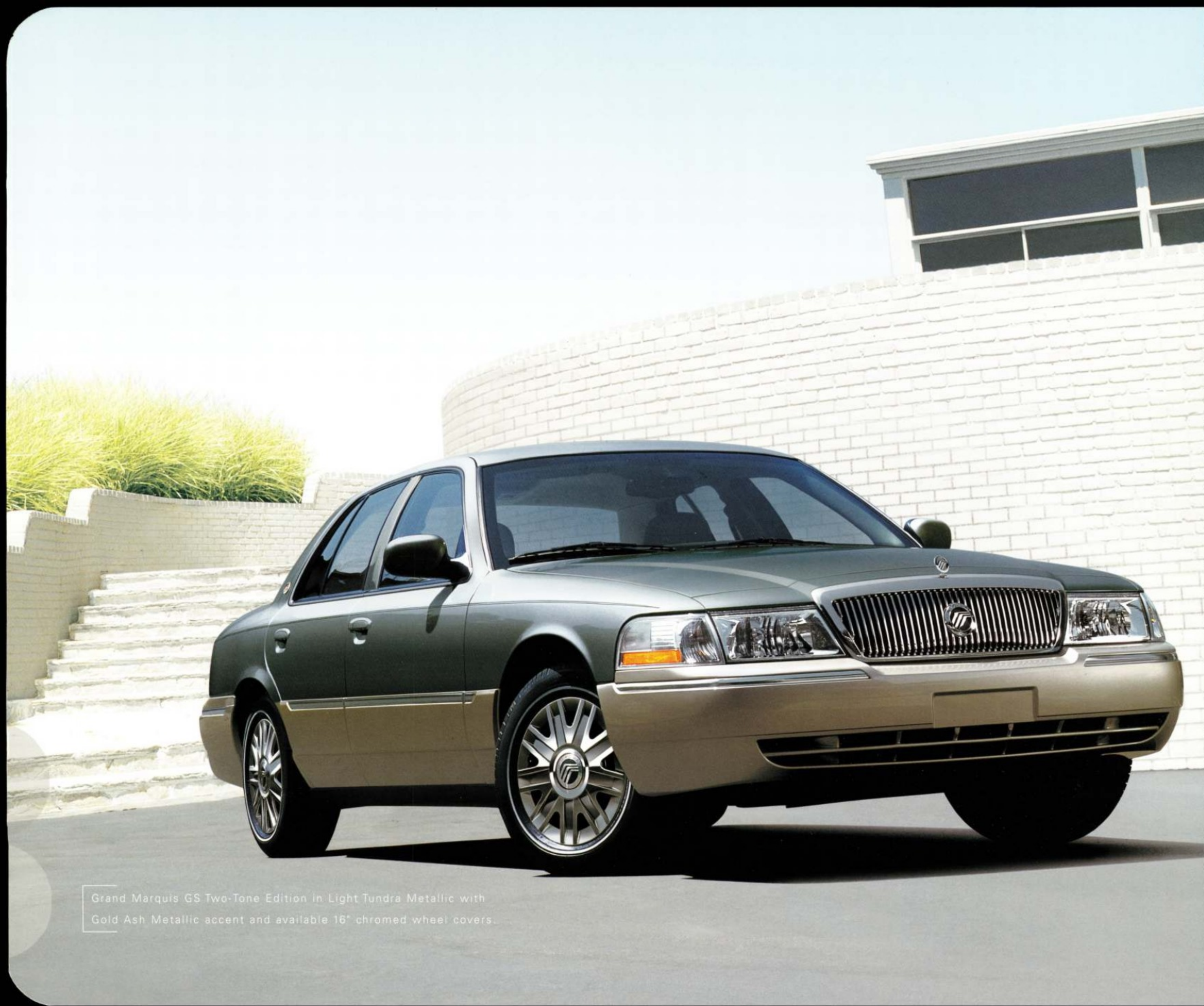
Grand Marquis GS Two-Tone Edition in Light Tundra Metallic with Gold Ash Metallic accent and available 16" chromed wheel covers.

HIGHEST GOVERNMENT SAFETY RATING For 10 consecutive years, Grand Marquis has received the highest government frontal-crash safety rating (1996-2005). In addition, when equipped with available side-impact airbags, Grand Marquis is the only vehicle in its class to receive the highest government crash safety rating in all 5 categories – driver frontal impact, passenger frontal impact, front-seat side impact, rear-seat side impact, and Rollover Resistance Rating – an achievement it has garnered 2 years in a row (2004-2005). This exceptional record of safety is built on innovative safety systems.