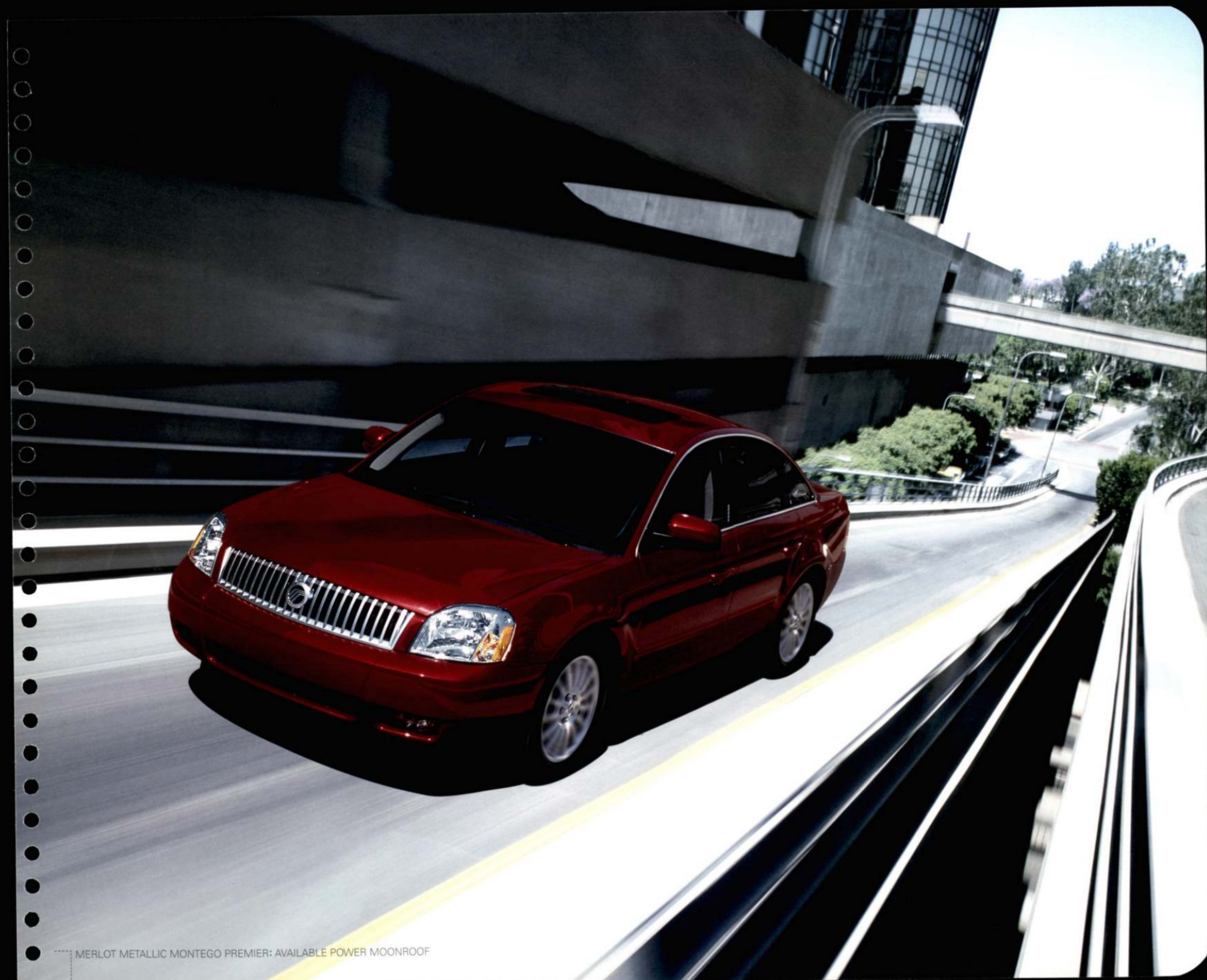
MERLOT METALLIC MONTEGO PREMIER: AVAILABLE POWER MOONROOF