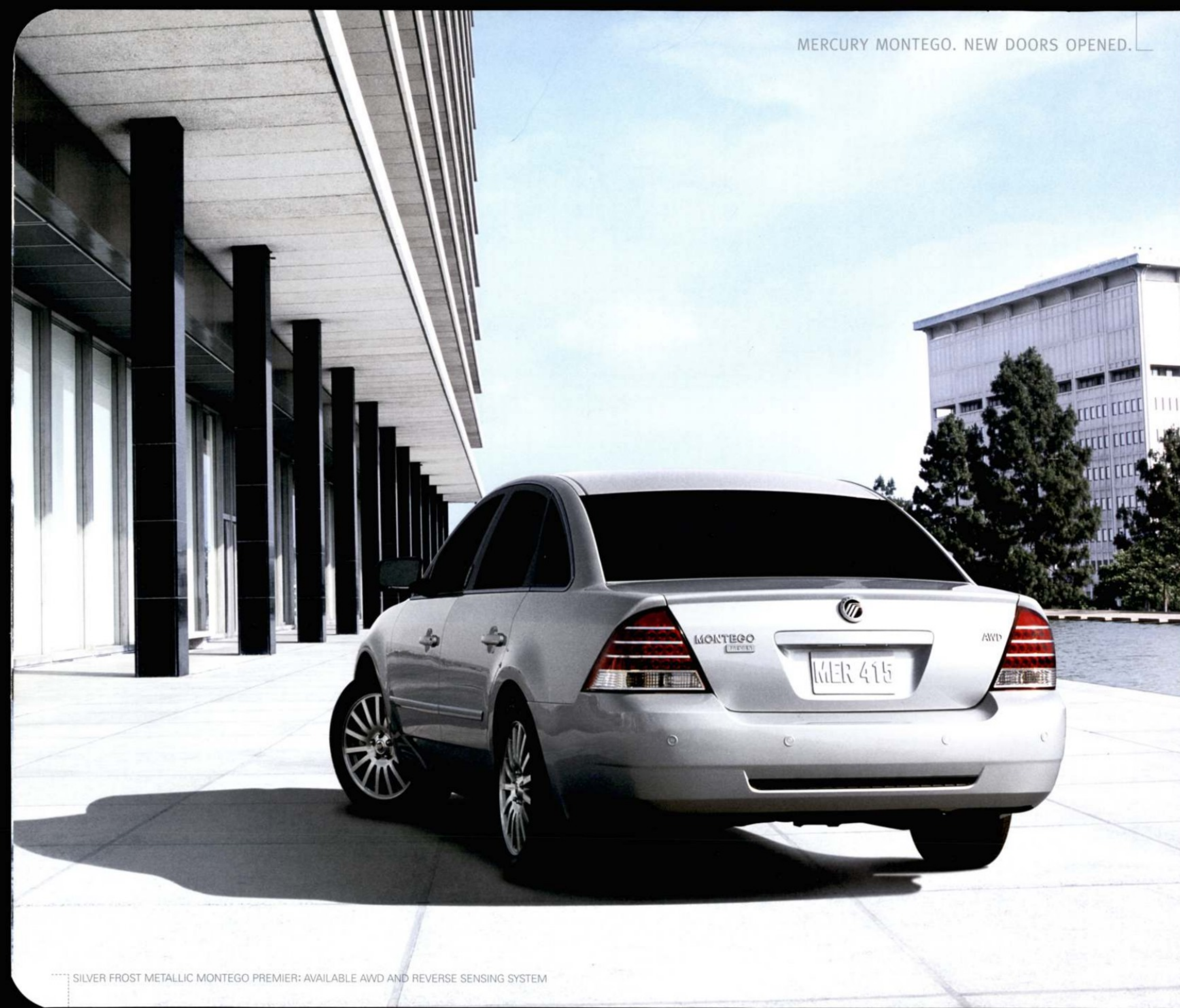
SILVER FROST METALLIC MONTEGO PREMIER: AVAILABLE AWD AND REVERSE SENSING SYSTEM

EXTERIOR PAINT AND INTERIOR FABRIC SWATCHES