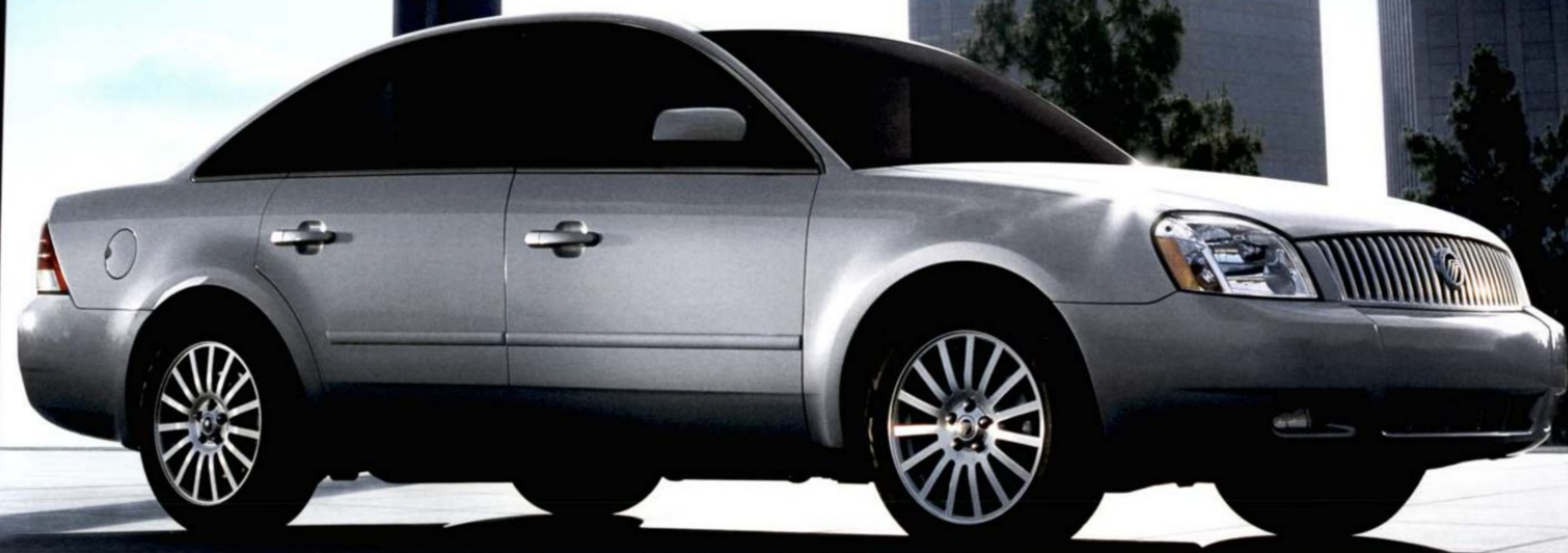
SILVER FROST METALLIC: MONTEGO PREMIER