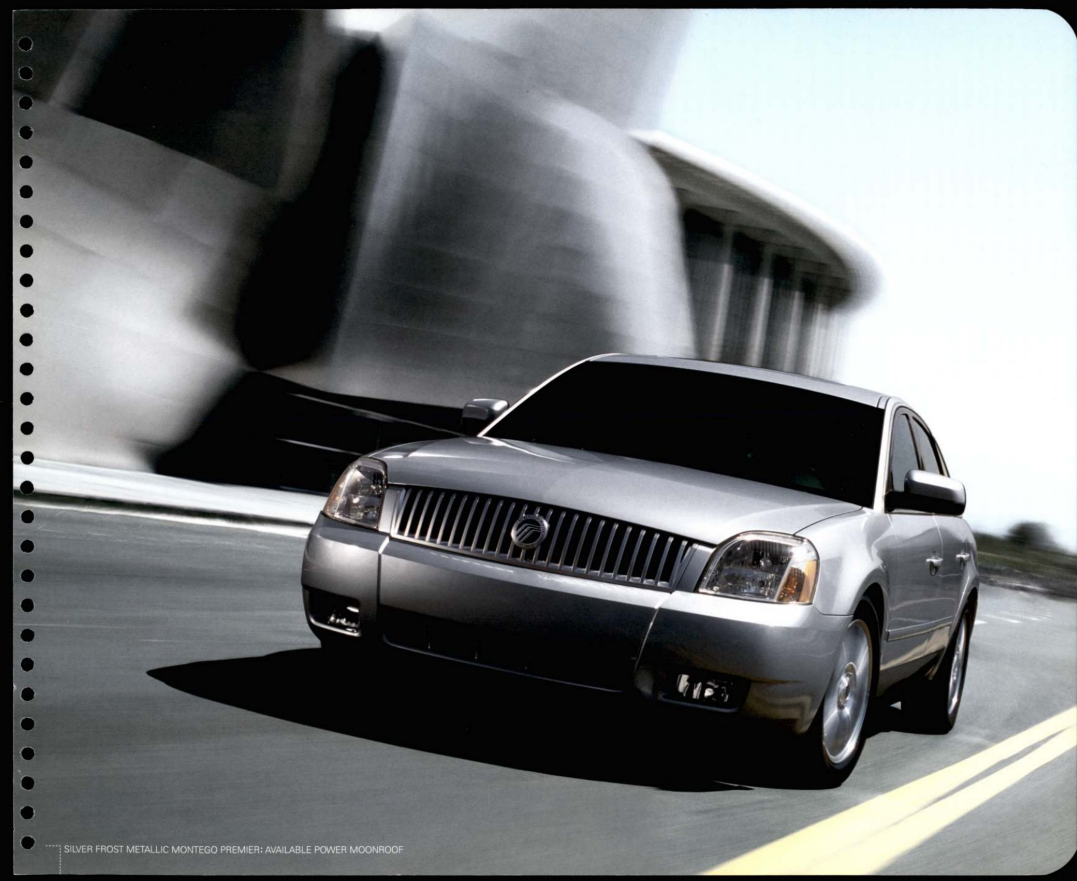
SILVER FROST METALLIC MONTEGO PREMIER: AVAILABLE POWER MOONROOF