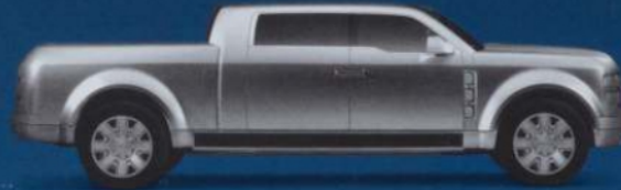
F-250 SUPER CHIEF CONCEPT