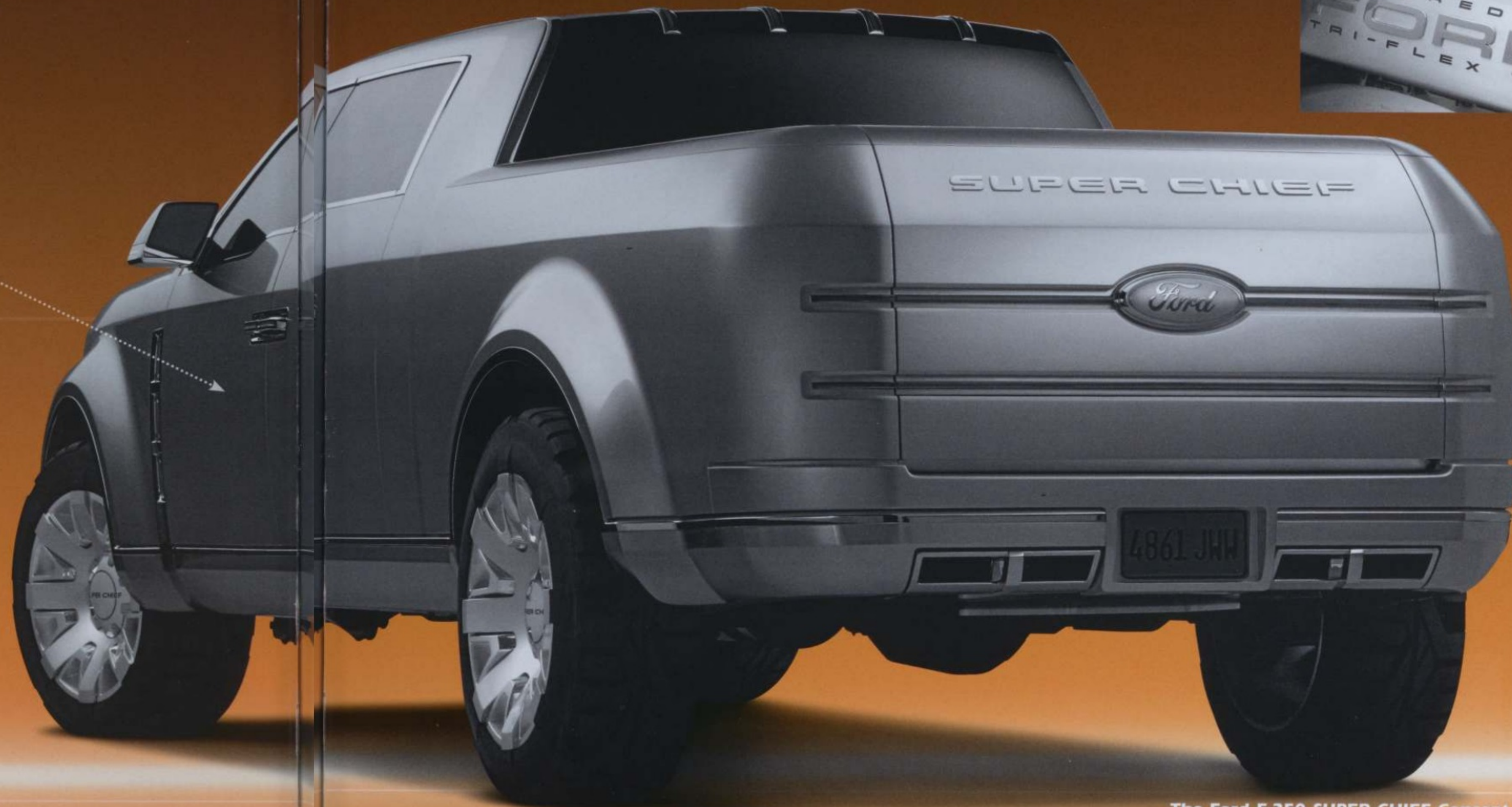
The Ford F-250 SUPER CHIEF Concept