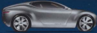
FORD REFLEX CONCEPT