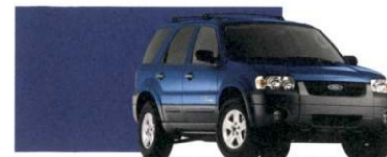
Sonic Blue Metallic