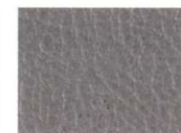
Medium Flint Leather Available