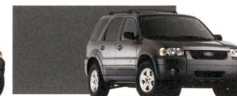
Dark Shadow Grey Metallic*