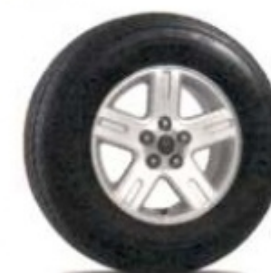
16" Aluminum Wheel Standard