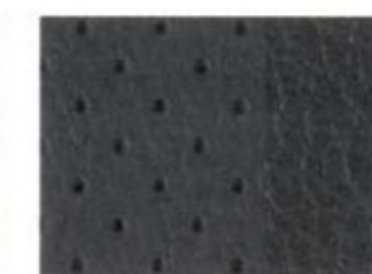
Dark Flint Premium Leather with Perforated Inserts Standard on Premium Package