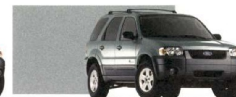
Titanium Green Metallic*