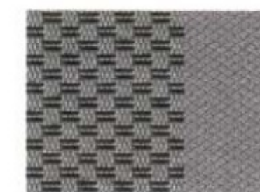
Medium/Dark Flint Premium Cloth Standard