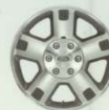
18-Inch Machined Cast Aluminum Wheel (Optional)