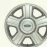
17-Inch Cast Aluminum Wheel

Box Availability: Styleside – 5 ½-foot, 6 ½-foot or 8-foot; Flareside – 6 ½-foot