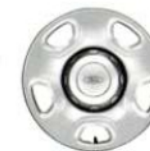
17" Grey Styled-Steel Wheel (XL)

Chrome front and rear step bumpers (with monotone paint) • Arizona Beige front and rear step bumpers (with two-tone paint) • Arizona Beige honeycomb-style grille • Color-coordinated wheel-lip moldings • Power, heated sideview mirrors with integrated turn signals • 18" bright aluminum wheels • Illuminated, covered visor vanity mirrors • Electronic Automatic Temperature Control • Rear-window defroster • Carpeted floor mats • Message center • Color-coordinated leather-wrapped steering wheel with secondary audio and climate controls • Power driver's seat • Leather-trimmed front seats • Auto-dimming rearview mirror