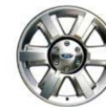
20" 6-Spoke Machined-Aluminum Wheel (FX4, Lariat, King Ranch – available)