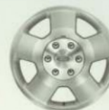
17-Inch Machined Aluminum Wheel

Box Availability: Styleside – 5 ½-foot or 6 ½-foot; Flareside – 6 ½-foot