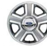
17" Machined-Aluminum Wheel w/ Painted Accents (XLT – available)