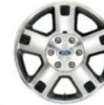
18" Machined Cast-Aluminum Wheel (FX4)