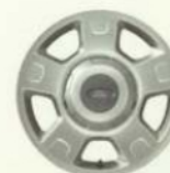
17-Inch Sport Cast Aluminum Wheel

Box Availability: Styleside – 5 ½-foot or 6 ½-foot; Flareside – 6 ½-foot