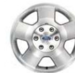
17" Machined-Aluminum Wheel (STX)