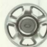
17-Inch Chrome Clad Steel Wheel (Optional)