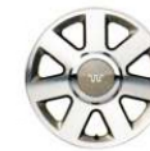
18" 7-Spoke Cast-Aluminum Wheel (King Ranch)