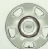
17-Inch Grey Styled Steel Wheel

Box Availability: Styleside – 6 ½-foot or 8-foot