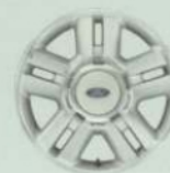
18-Inch Bright Aluminum Wheel

Box Availability: Styleside – 5 ½-foot or 6 ½-foot