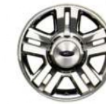
18" Chrome-Aluminum Wheel (Chrome Packages)