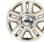
18" Bright Aluminum Wheel (Lariat)