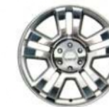
22" Polished Forged-Aluminum Wheel (Harley-Davidson™ Package)

Ford uses clearcoat paint for beauty and protection. Colors shown are representative only. Not all colors are available on all models. See your dealer for actual paint/trim options. Comparisons based on 2005 competitive models, publicly available information and Ford certification data at time of printing. Some features discussed may be optional. Vehicles shown may contain optional equipment. Features shown may be offered only in combination with other options or subject to additional ordering requirements or limitations. Following publication of this brochure, certain changes in standard equipment, options and the like, or product delays may have occurred which would not be included in these pages. Your Ford Dealer is the best source for up-to-date information. Ford Division reserves the right to change product specifications at any time without incurring obligations.