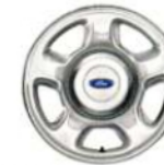
17" Chrome-Clad Steel Wheel (XLT – standard; STX – available)