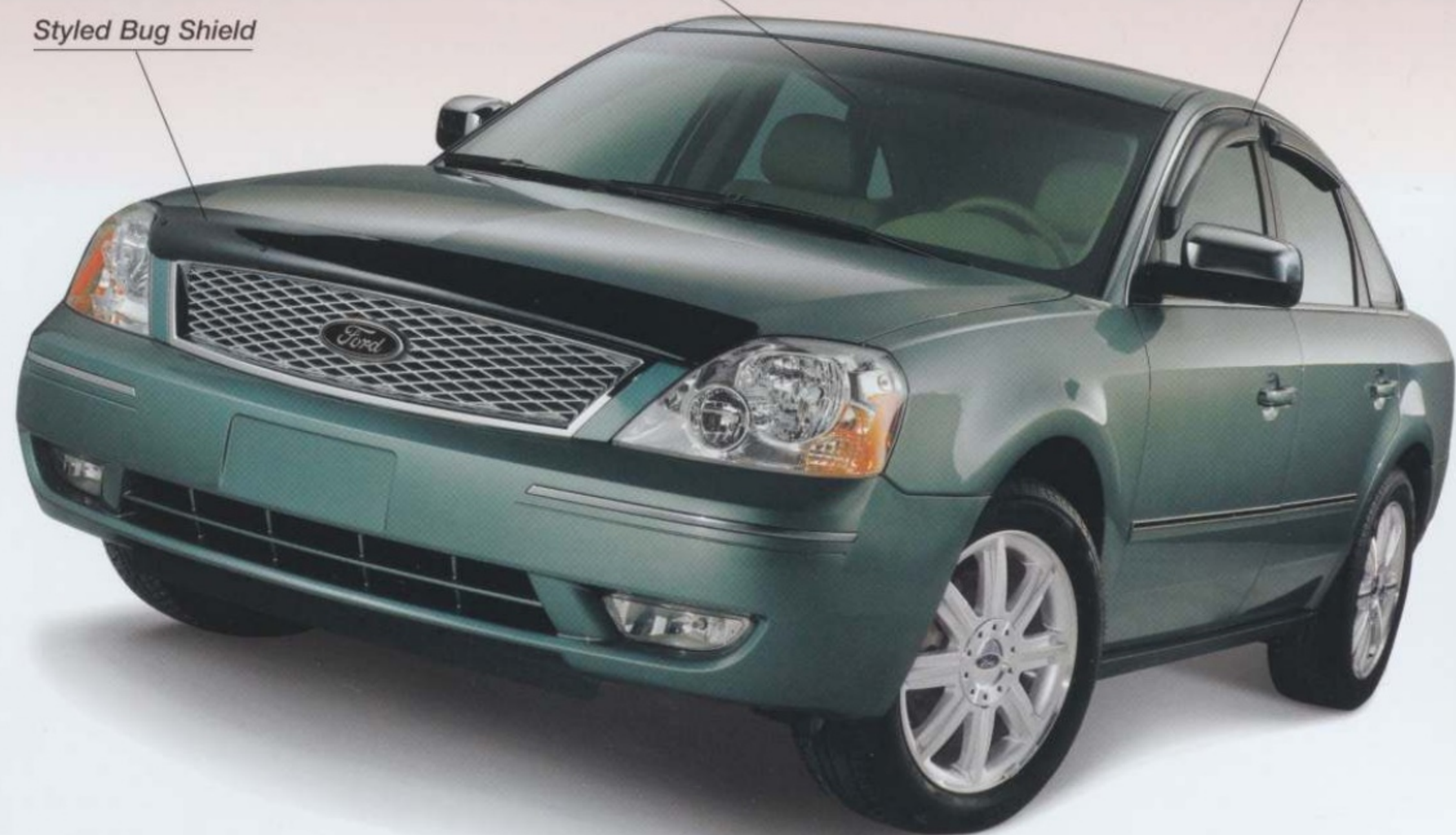
Styled Bug Shield