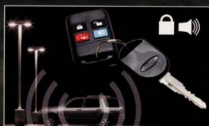
Vehicle Security System