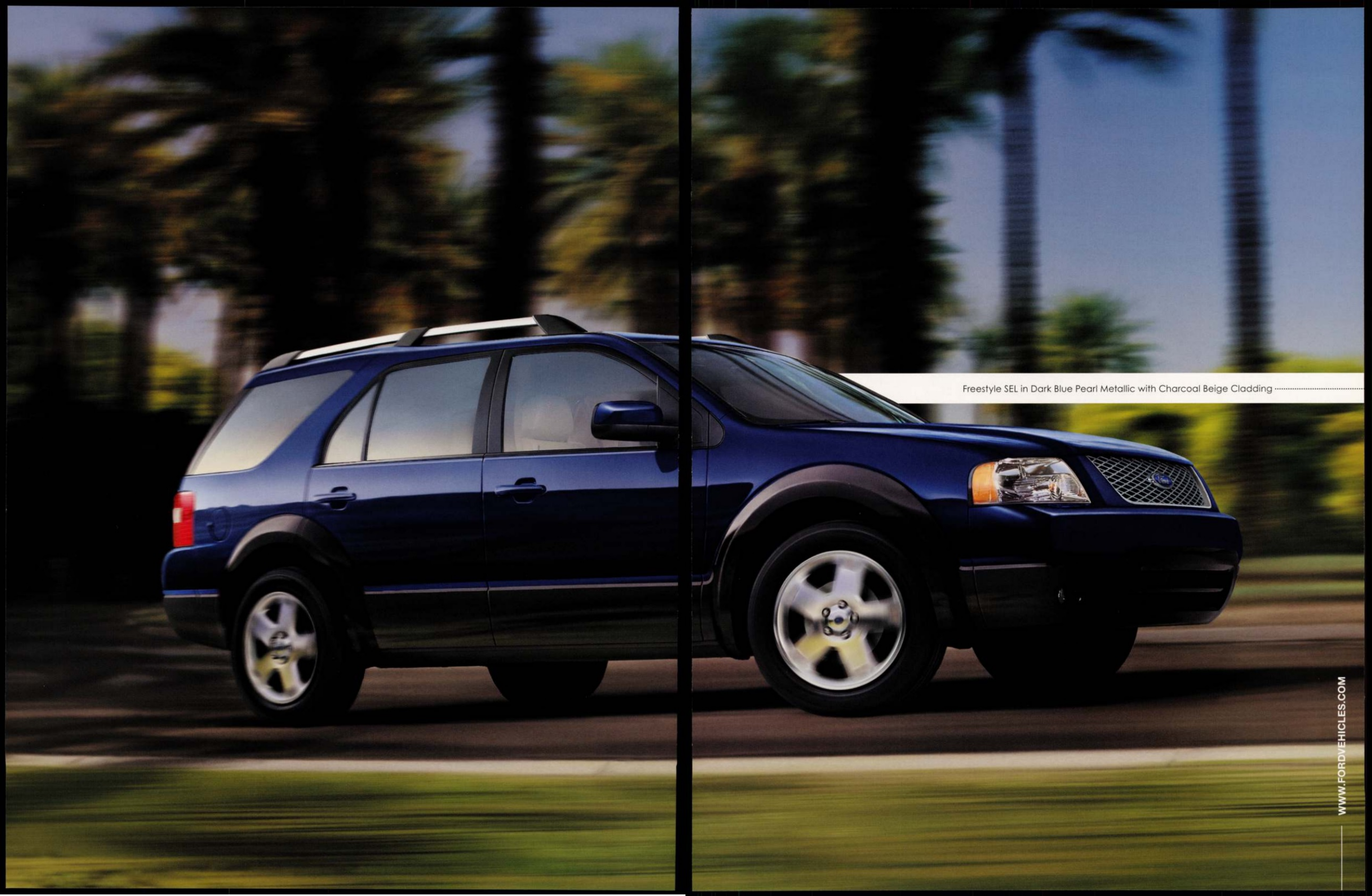
Freestyle SEL in Dark Blue Pearl Metallic with Charcoal Beige Cladding .....