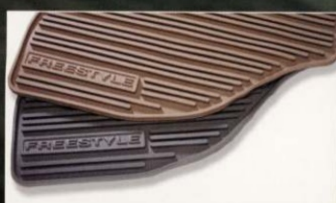
All-Weather Vinyl Floor Mats