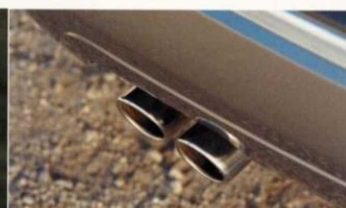
Chrome Exhaust Tips