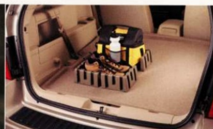
Cargo-Logic® Cargo Organizer