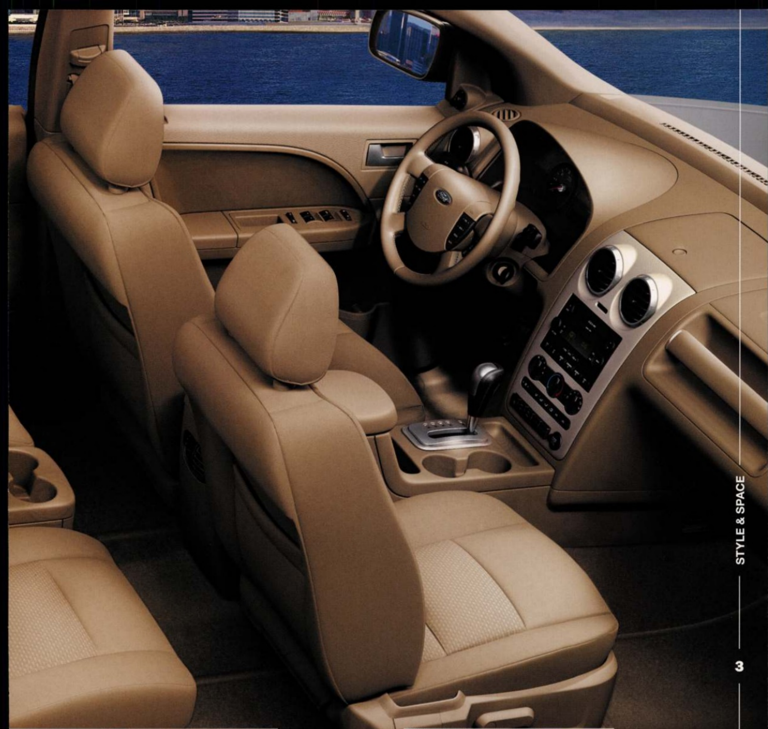
Freestyle SEL Cloth Interior in Pebble