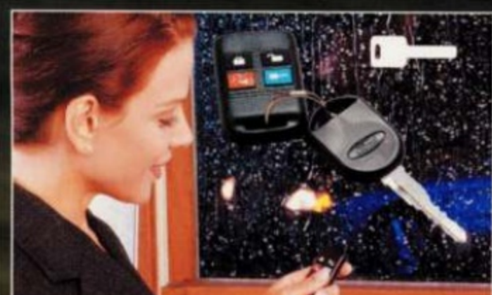
Remote Start System