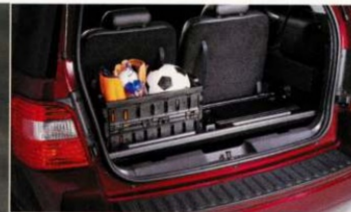
Rear Parcel Shelf