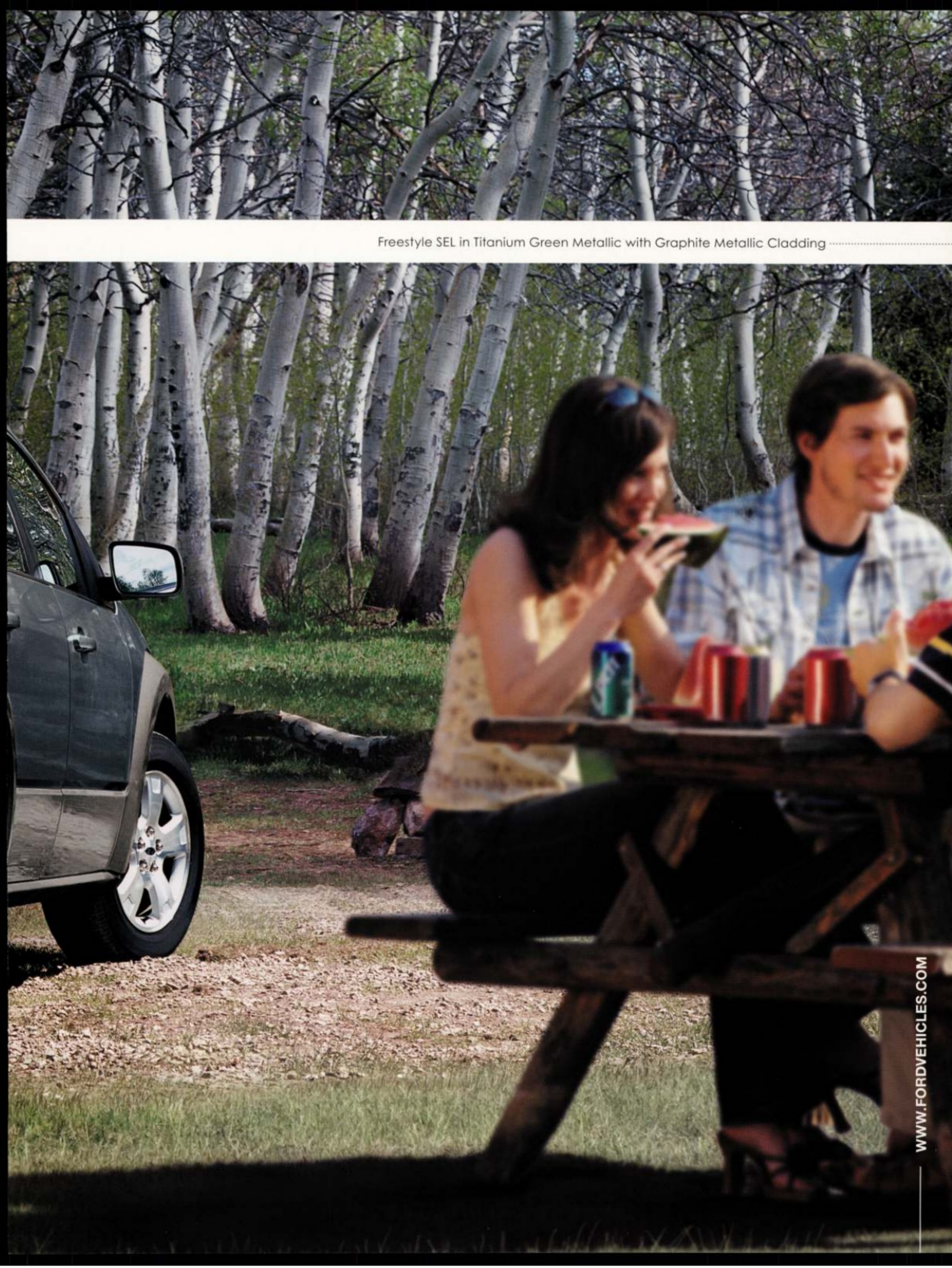
Freestyle SEL in Titanium Green Metallic with Graphite Metallic Cladding