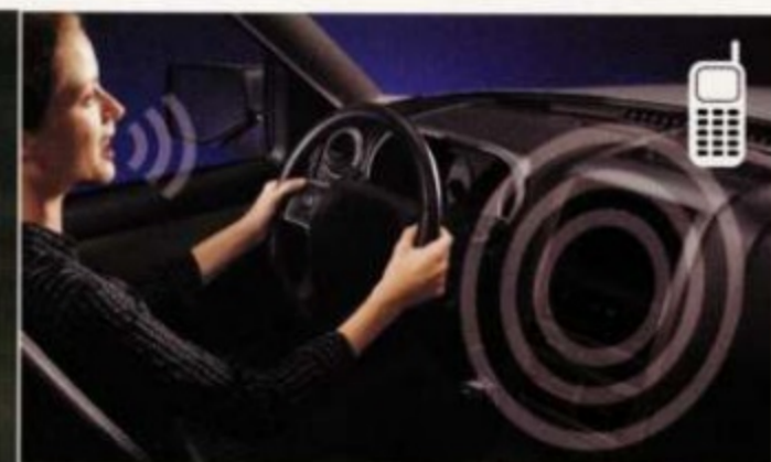
Mobile-Ease™ Hands-Free Communication System