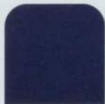
DARK BLUE PEARL METALLIC