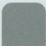
TITANIUM GREEN METALLIC