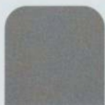
SILVER FROST METALLIC