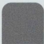
TUNGSTEN SILVER METALLIC