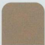
DUNE PEARL METALLIC