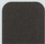
CHARCOAL BEIGE METALLIC

*Pending certification. Based on Ford preliminary data. **Optional features. Vehicles shown may contain optional equipment. Features shown or described may be offered only in combination with other options or subject to additional ordering requirements. Following the publication of this brochure, certain changes in standard equipment, options and the like, or product delays may have occurred which would not be reflected in these pages. Your Ford Dealer is the best source for up-to-date information. Ford Division reserves the right to change product specifications at any time without incurring obligations.